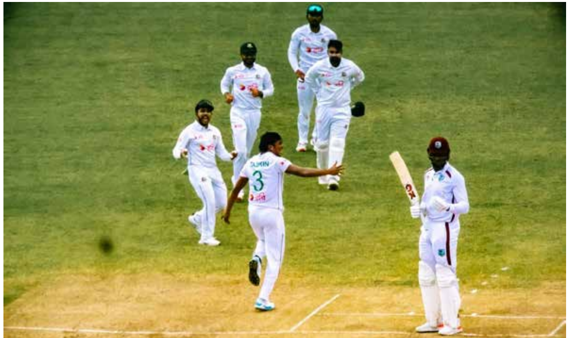
Bangladesh fast bowler Taskin Ahmed (#3) celebrates after taking one of his six wickets against the West Indies on the fourth day of the first cricket Test at the Sir Vivian Richards Stadium in North Sound, Antigua, on Monday, November 25, 2024.

Earlier, a superb spell of fast bowling from right-arm seamer Taskin Ahmed, who bagged six for 64, helped