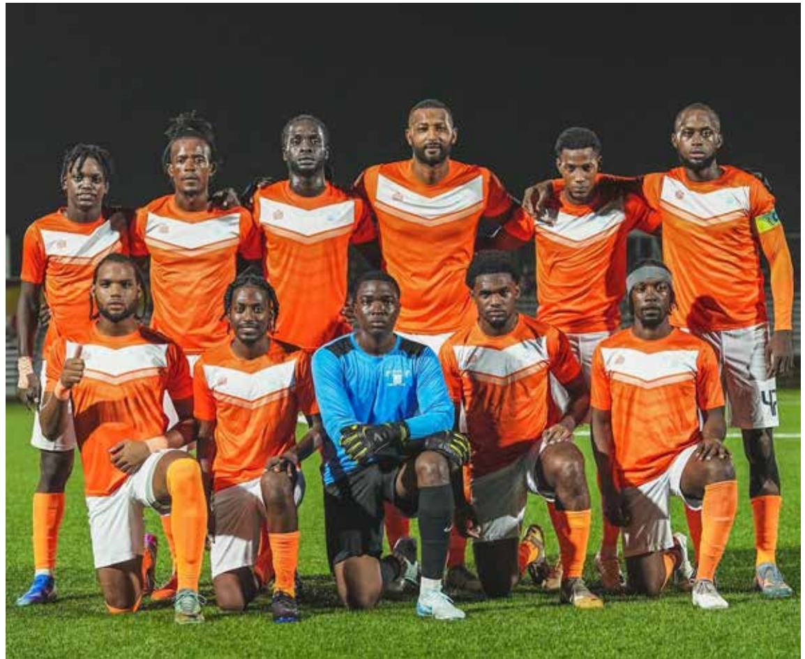
Players of the Terminix Pigotts Bullets football team.