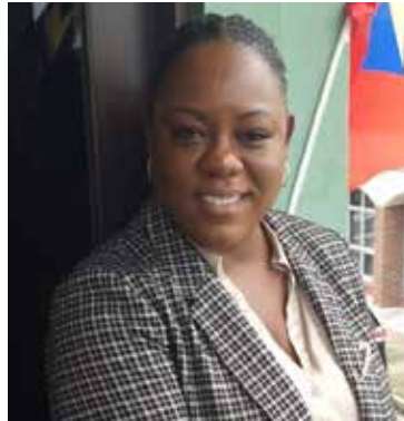
Senator Knacyntar Nedd-Charles

Violence against women is an egregious violation of human rights and a stark reminder of the inequalities that persist in our world. It transcends boundaries of age, race, and socioeconomic sta-