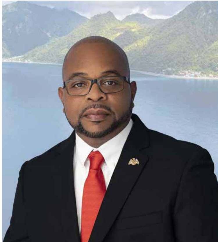
Dominica's Minister of Agriculture, Fisheries and Blue and Green Economy, Roland Royer.

The pavilion, which featured contributions from IICA and its partners from