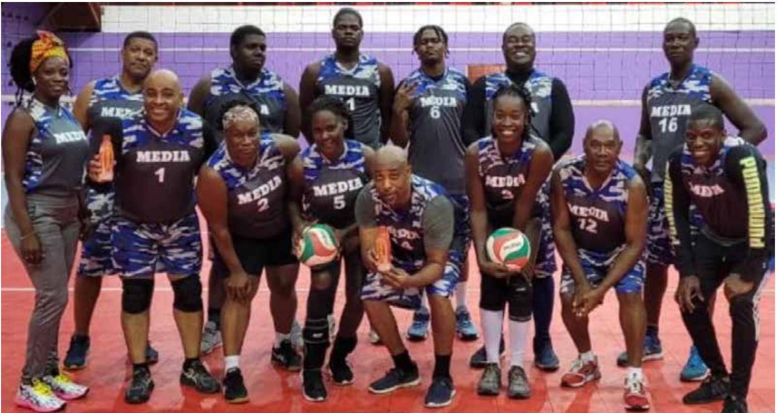
The media volleyball team