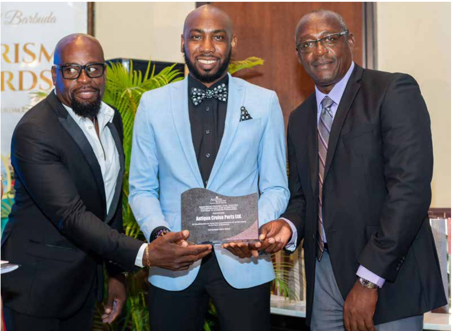
Antigua Cruise Port Ltd won the Cruise Industry Award at the Antigua and Barbuda Tourism Awards Gala 2024. Story on page 3.