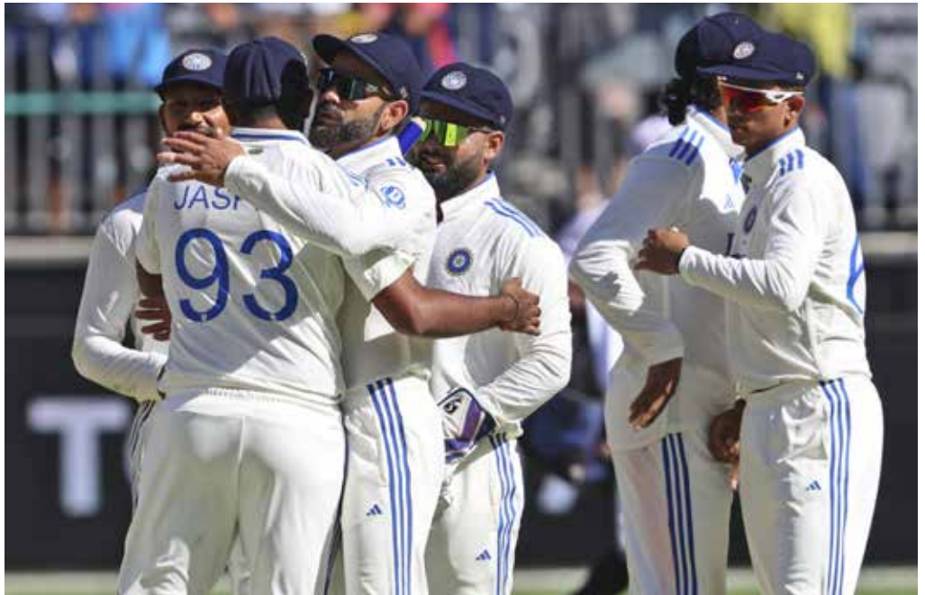
India's captain Jasprit Bumrah hugs teammate Virat Kohli after winning the first cricket Test against Australia in Perth, Australia, Monday, Nov. 25, 2024.

The 30-year-old elected to bat first in seam-friendly conditions, a decision which has always paid dividends at