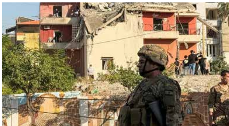
The Lebanese army would be expected to increase its presence in the ceasefire zone.

Concerns over how a ceasefire would be enforced, given the compar-