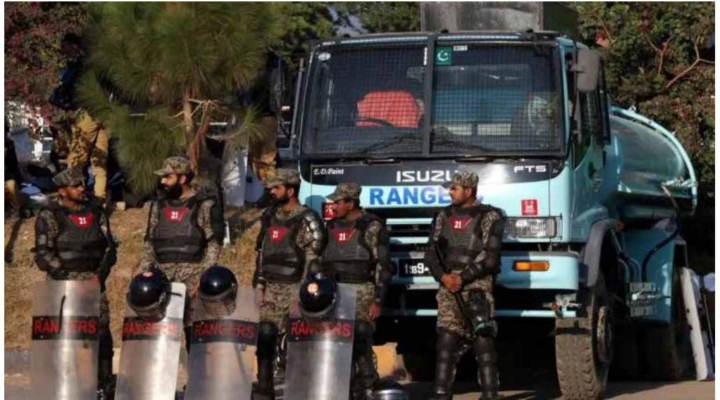
The rally has been declared illegal and Islamabad is under lockdown.

Some internet services have been suspended. Schools and colleges have been shut because of fears of violence.