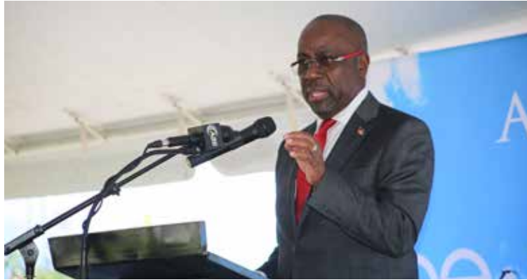
MP for St Paul, E.P. Chet Greene

"Sir Gerald was not one to mince words or curry favour. The person, I believe, who benefitted most from Sir Gerald in the parliament was the Leader of the Opposition Jamale Pringle. He was so woefully short in his ability, in his presentation