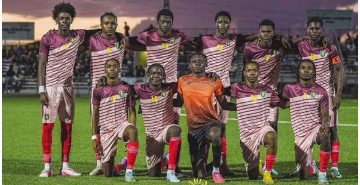
Players of the Aston Villa Lions teams

The Attacking Saints will remain in the lower half of the 14-team stand-