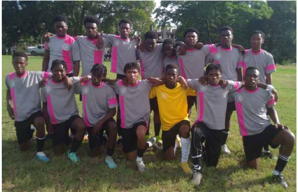
The Princess Margaret School's Under-20 Boys football team.