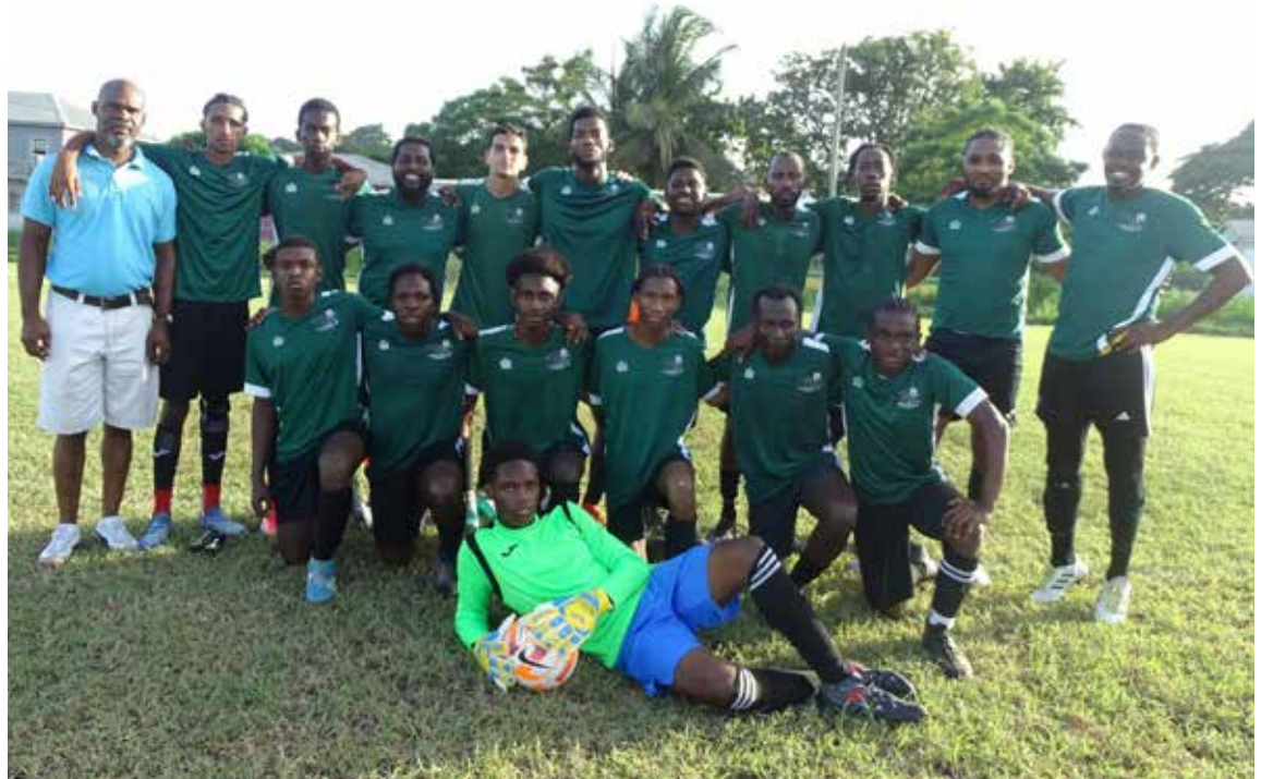
The CPTSA Wings football team.

Rowe had conversions in the 14th and 70th min-