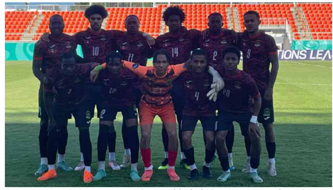
The Antigua and Barbuda starting XI for their CONCACAF Nations League Group D match against Dominica at the Estadio Cibao FC in Santiago de los Caballeros, Dominican Republic, on Tuesday, November 19, 2024.

Antigua and Barbuda earned their only point in this edition but were relegated to League C for the first time in the nation's history.