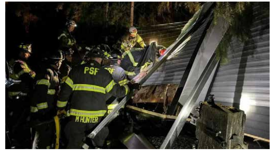
Rescue crews freed two people trapped in a trailer home after a tree fell on them.

"If you are able, head to the lowest floor you can and stay away from