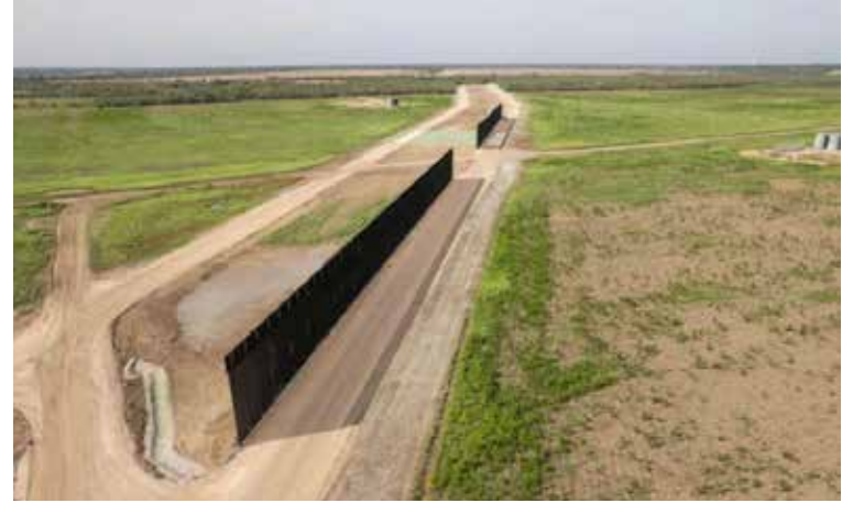
The land is in Texas' Starr County in the Rio Grande Valley, on the border with the Mexican state of Tamaulipas.

But the Democratic governors of three other southern border states - Cal-