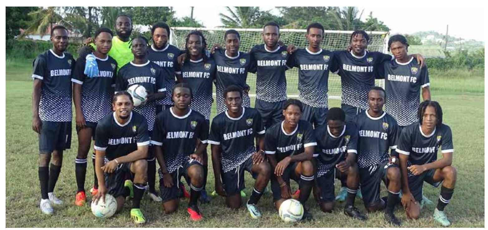
Belmont FC recorded their fourth win in the ABFA's Second Division on Tuesday, November 19, 2024.