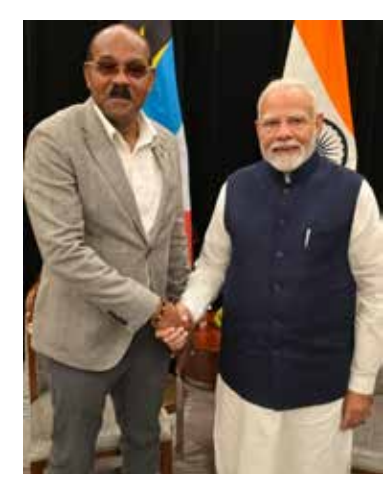
Prime Ministern Gaston Browne, left, and Prime Minister of India the Honourable Shri Narendra Modi

Prime Minister Browne said that the meetings come at a time when the region and the world are grappling with a number of major issues, particularly the multifaceted and protracted crisis in Haiti, the rising threat over the links between migration and the spread of international terrorism and organized crime, the post COVID-19 economic recovery, the on-