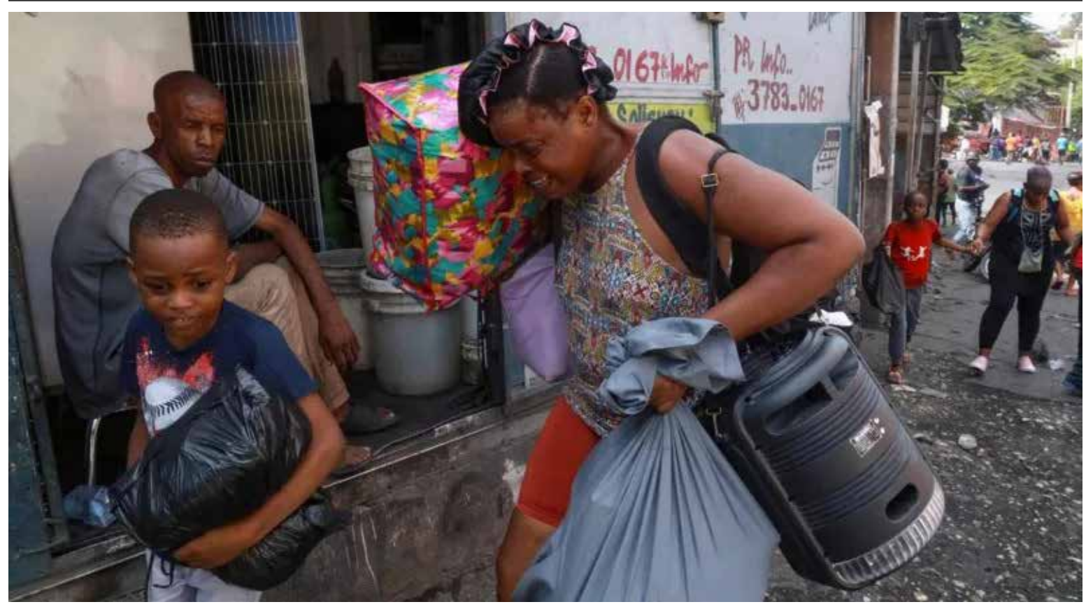
People carry belongings as they flee Port-au-Prince's neighbourhood of Nazon due to gang violence. Photo: 14 November 2024.