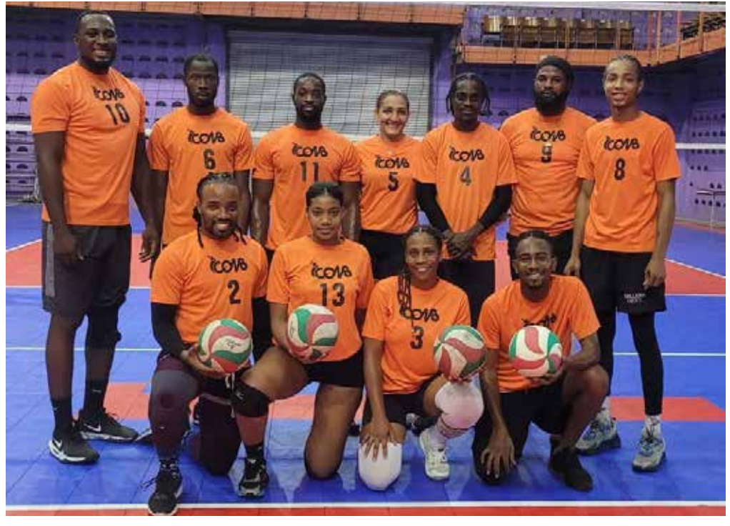
ICONS won their second game in the Antigua and Barbuda Amateur Volleyball Association's Business League Championship at the YMCA Sports Complex on Tuesday, November 19, 2024.

utes to win the encounter, prevailing 25-17, 27-25, as Island Academy slipped to their second loss in three matches