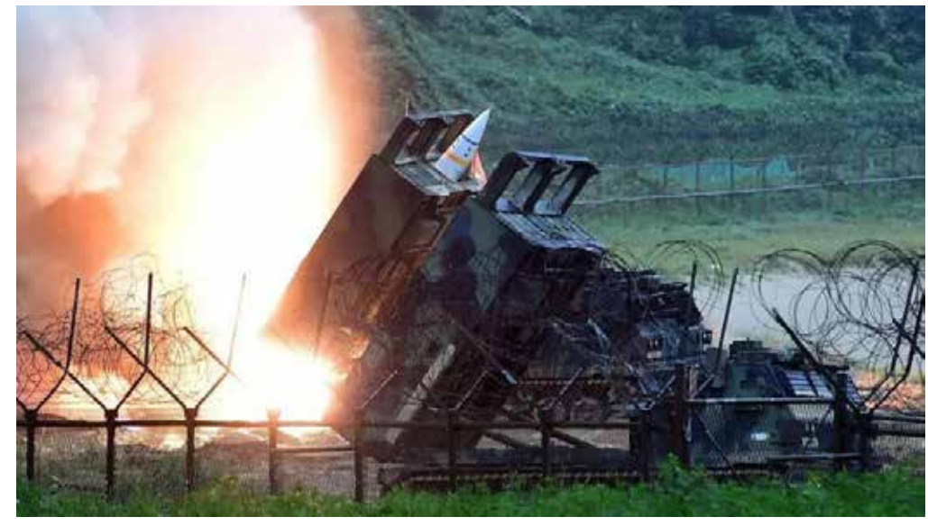
The US has approved the use of ATACMS missiles against targets inside Russia (file photo)

Unconfirmed reports say North Korea may send as many as 100,000