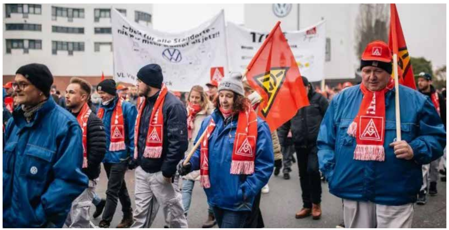
Volkswagen workers recently protested outside of its factory in Osnabrueck, Germany.