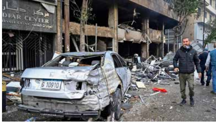
An Israeli strike on the Mar Elias area of Beirut on Sunday night killed two people.

A day earlier, the first air strikes in the area for about a month killed seven others.