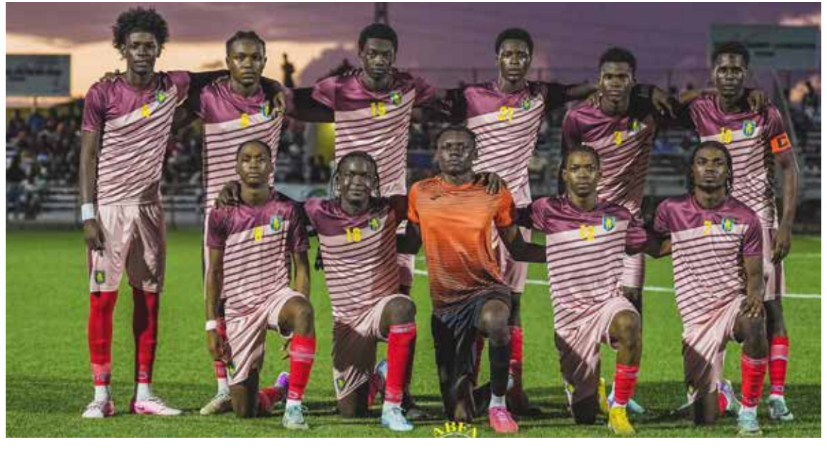
Players of the Aston Villa Lions football team.

The Attacking Saints will remain in the lower half of the 14-team standings