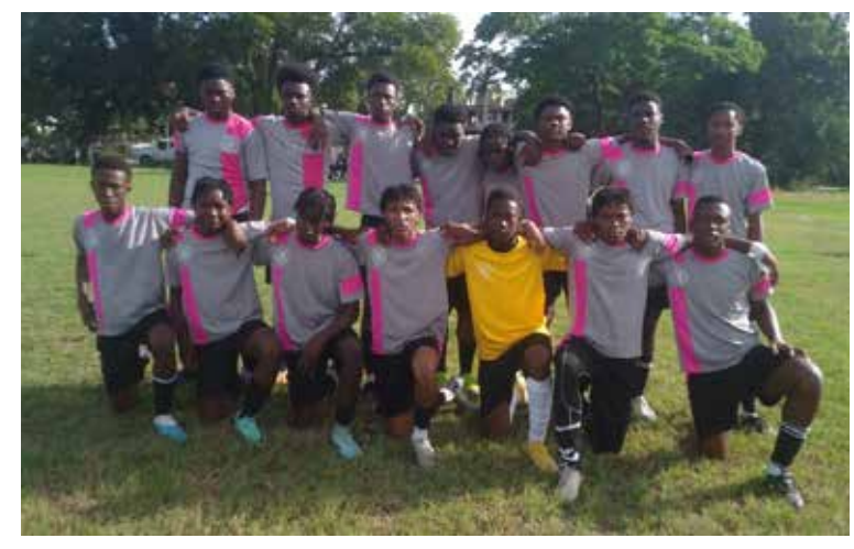
The Princess Margaret School Under-20 Boys football team

The result also allowed Princess Margaret School