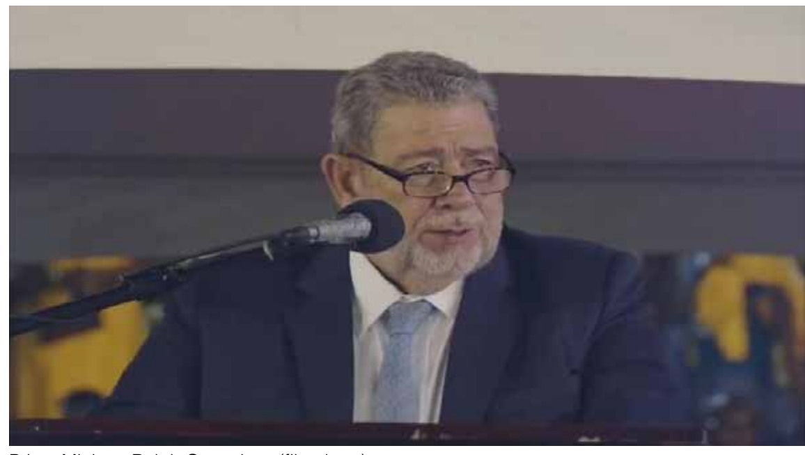
Prime Minister Ralph Gonsalves (file photo)

tution of the CARICOM whose mandate is to provide financial or technical assistance to disadvantaged countries, regions and sectors in the bloc.