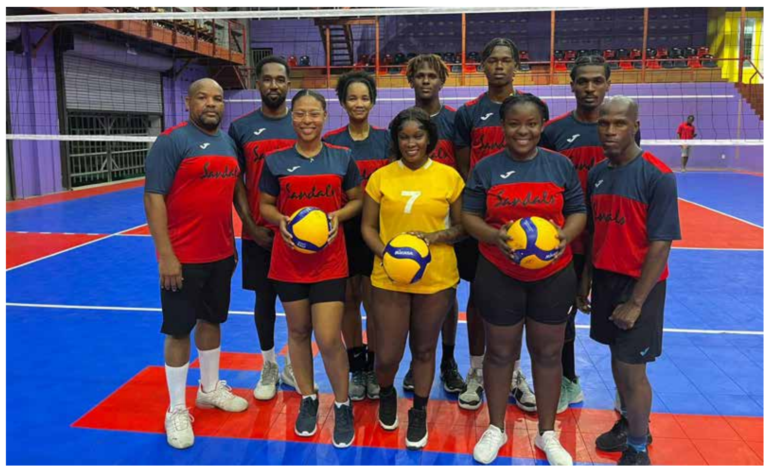
Players of the Sandals volleyball team. (ABAVA)