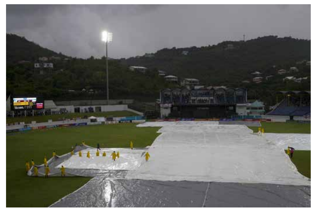
Ground staff move the covers as rain delays the fifth T20 cricket match between West Indies and England at Daren Sammy National Cricket Stadium in Gros Islet, St. Lucia, Sunday, Nov. 17, 2024.