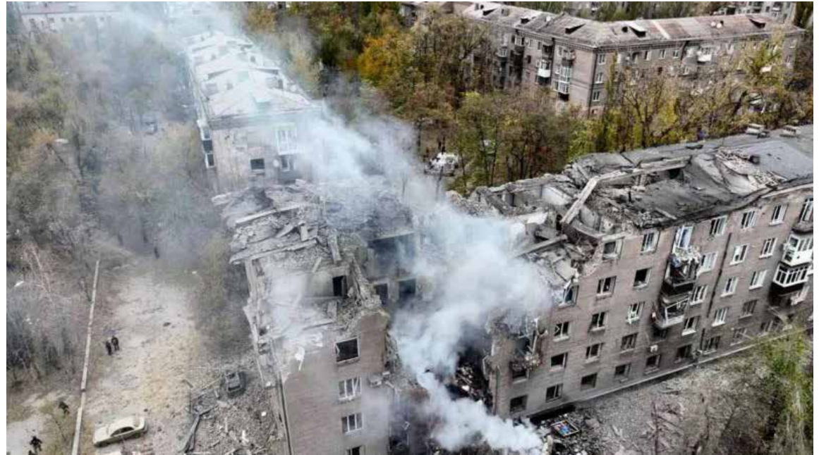
Injuries were reported after a Russian missile struck an apartment building in Kryvyi Rih on Monday.

Trump has promised to end the nearly three-year long war in Ukraine, but