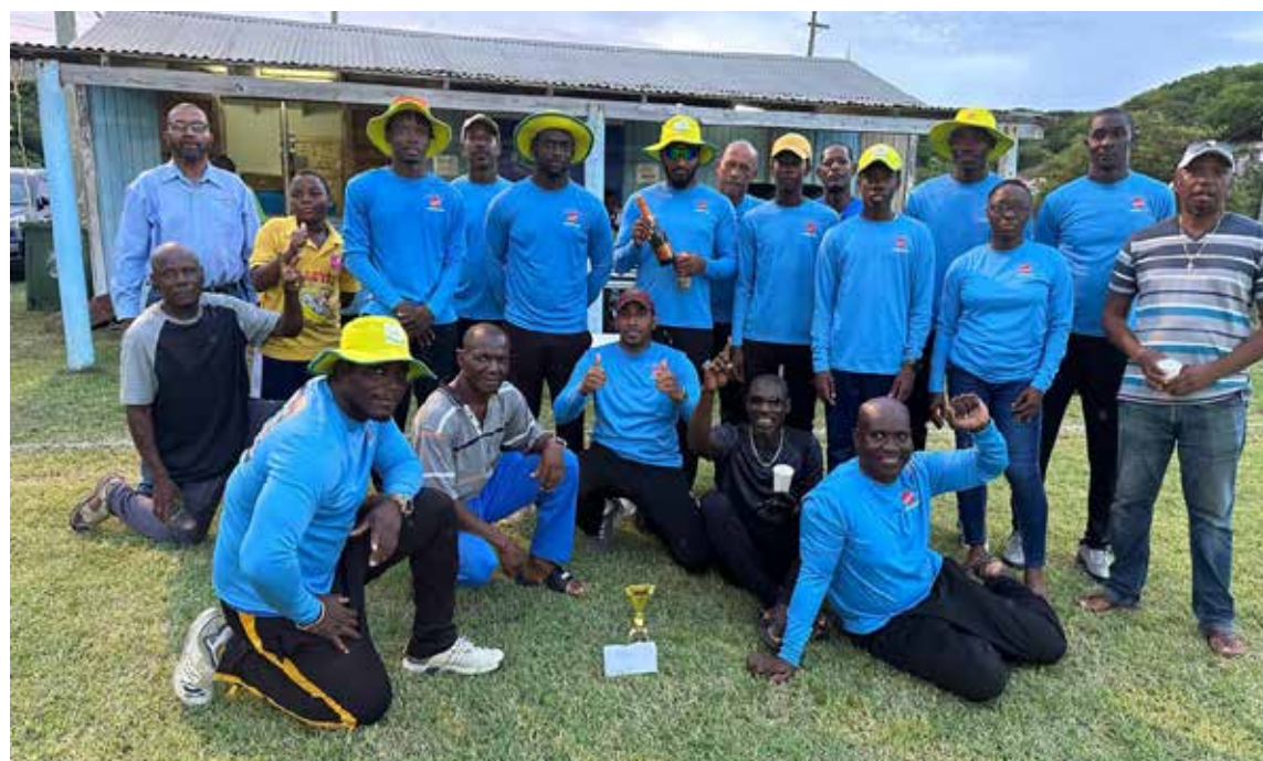
Dredgers celebrate after capturing the LL Supply Limited and Total Imports Island Boys Sports Club T20 Taped Ball Classic Championship at the Powells playing field on Sunday, November 10, 2024.

Javaughn James picked up two wickets for 19 runs,