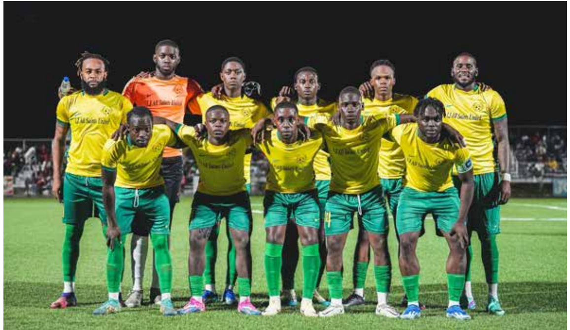
Players of the All Saints United football team. (File photo)

The result lifted All Saints United to 10 points,