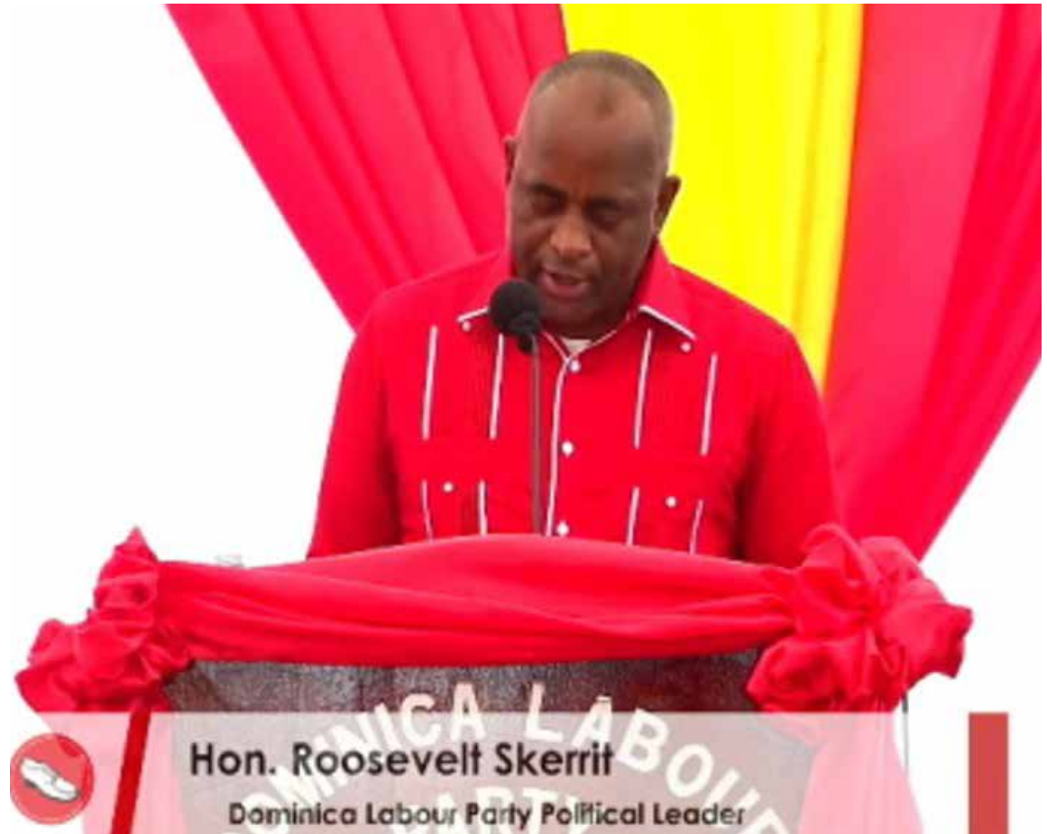
DLP leader and Prime Minister Roosevelt Skerrit addressing supporters at party's delegates convention on Sunday

All three countries have CBI programmes and Sker-