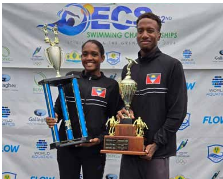
Co-captain of the Antigua and Barbuda team with their 2024 OECS Swimming Championship trophies.