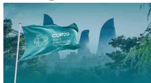
COP29 Flag waving in the distance in Azerbaijan