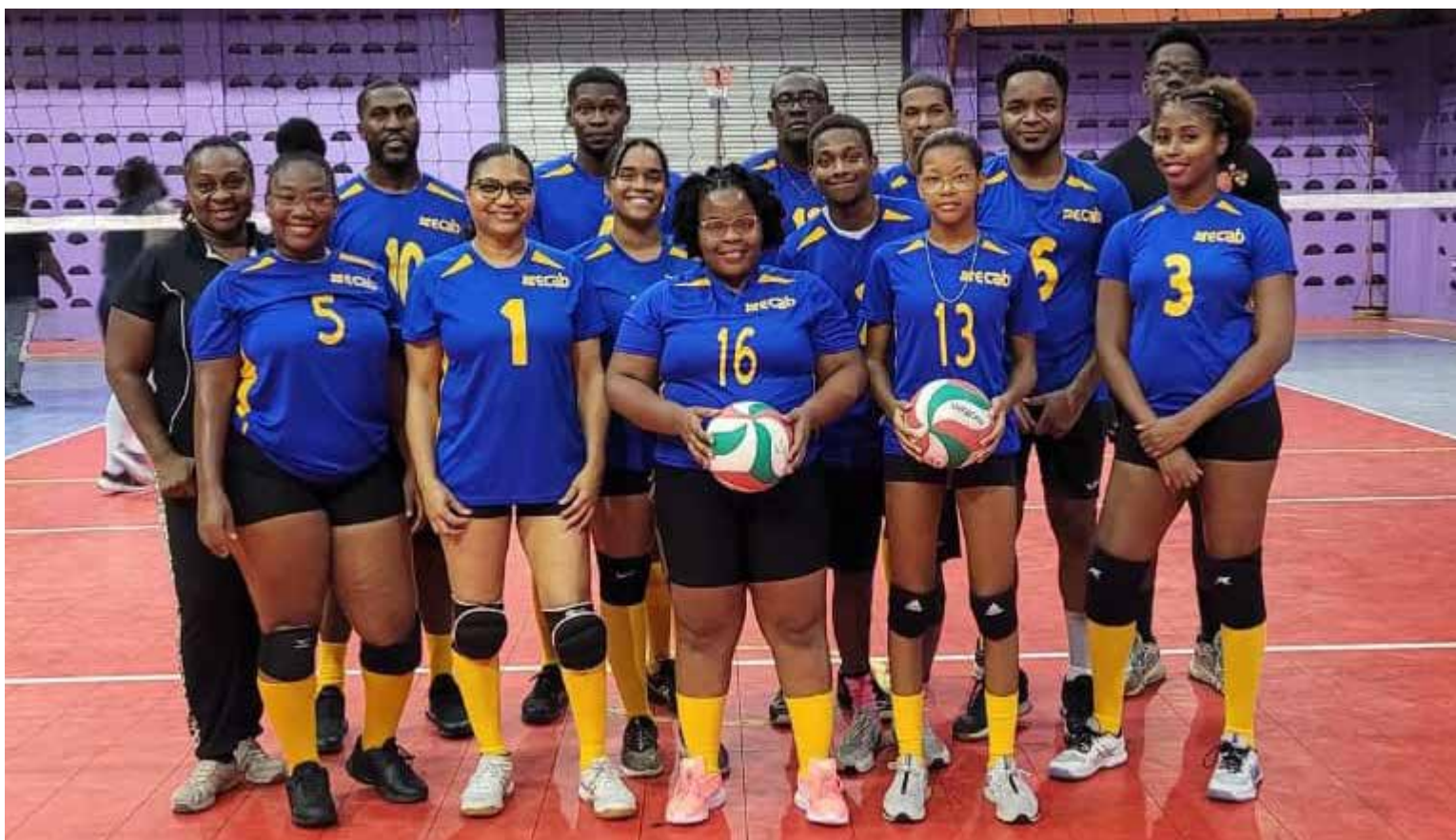
The ECAB volleyball team