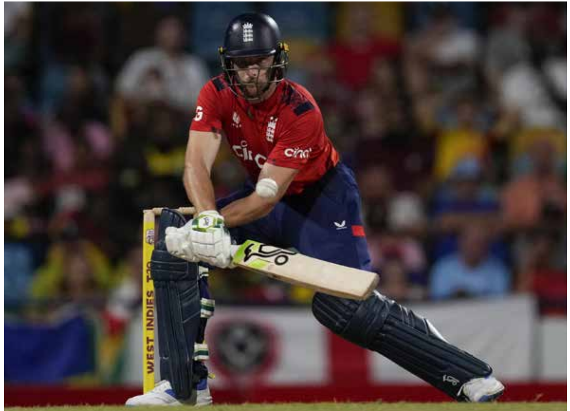
England's captain Jos Buttler plays a shot against West Indies during the second T20 cricket match at Kensington Oval in Bridgetown, Barbados, Sunday, Nov. 10, 2024.

Buttler helped to propel England past the home team's total of 158 for eight. He came to the crease with England one wicket for no run, and put on 129 for England's second wicket with Will Jacks, who made 38 from 29 balls.