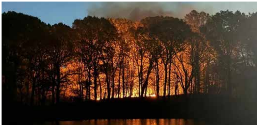
A wildfire briefly burned this week in Brooklyn's Prospect Park.

is burning in Ulster and Sullivan counties, west of Hartford, Connecticut, and is up to 400 acres in size, Hochul has said.