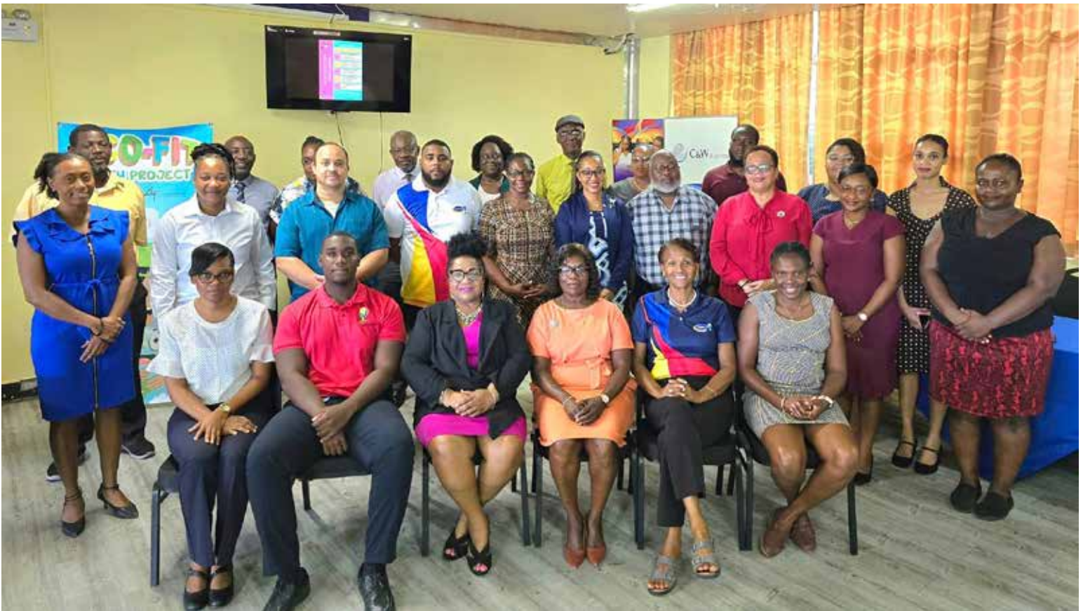
Group photo at the Eco-Fit youth project launch