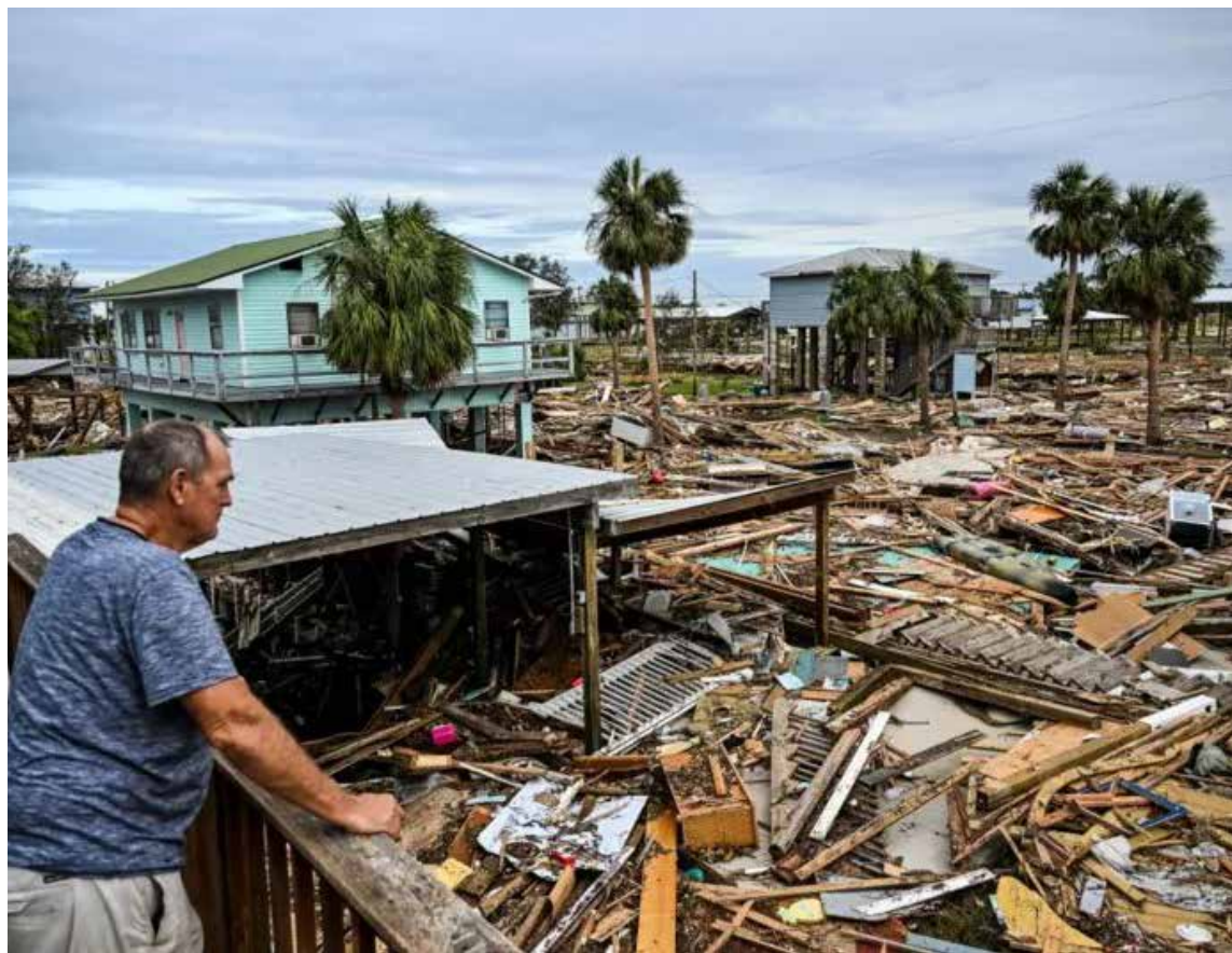
Hurricane Helene made landfall in Horseshoe Beach, Florida, on 26 September.

confidence that a powerful hurricane with life-threatening hazards will be affecting portions of the Florida west coast around the middle of this week,” the Hurricane Centre said.