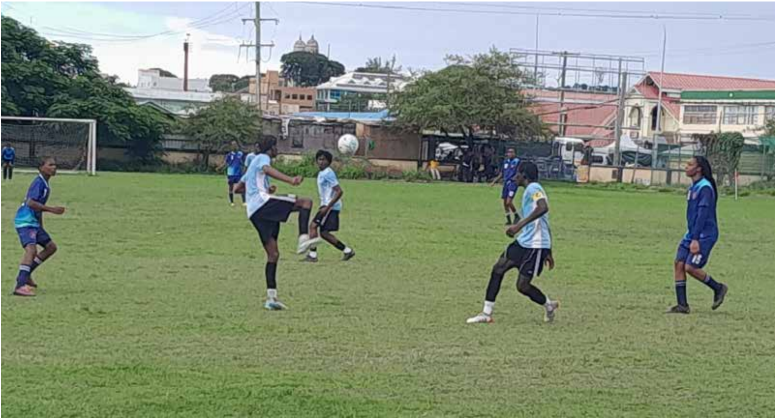
Players of Antigua State College (black Shorts) and Jennings Secondary compete during their opening match in the 2024 secondary schools' football league at the Keithley Sheppard Recreational Park in St. John's.