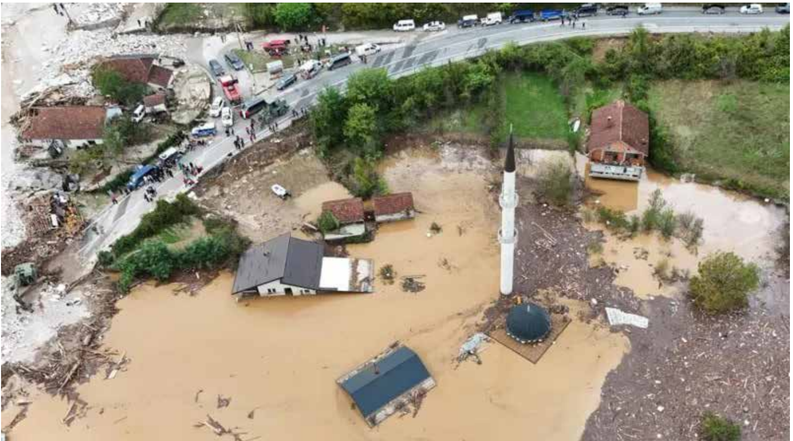
The area worst hit by flash floods and landslides was around Jablanica.