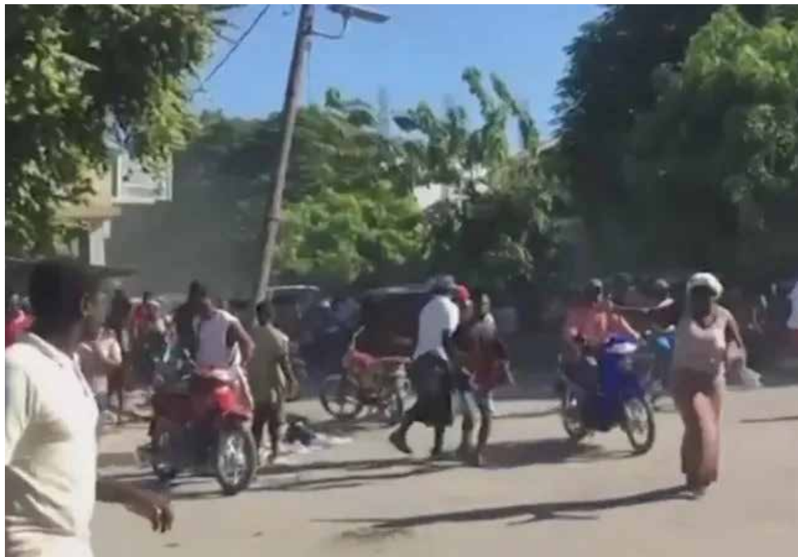
People could be seen fleeing the violence on motorbikes and on foot.

edly "set fire to at least 45 houses and 34 vehicles", the UN has said.