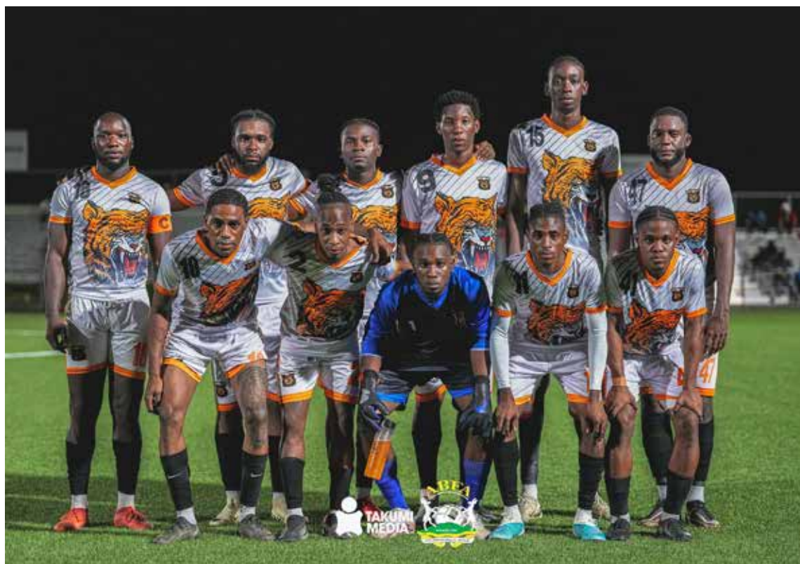
The starting XI for Potters Tigers against Attacking Saints FC in their match in the Antigua and Barbuda Football Association's Premier Division League at the ABFA Technical Center on Monday, October 28, 2024.