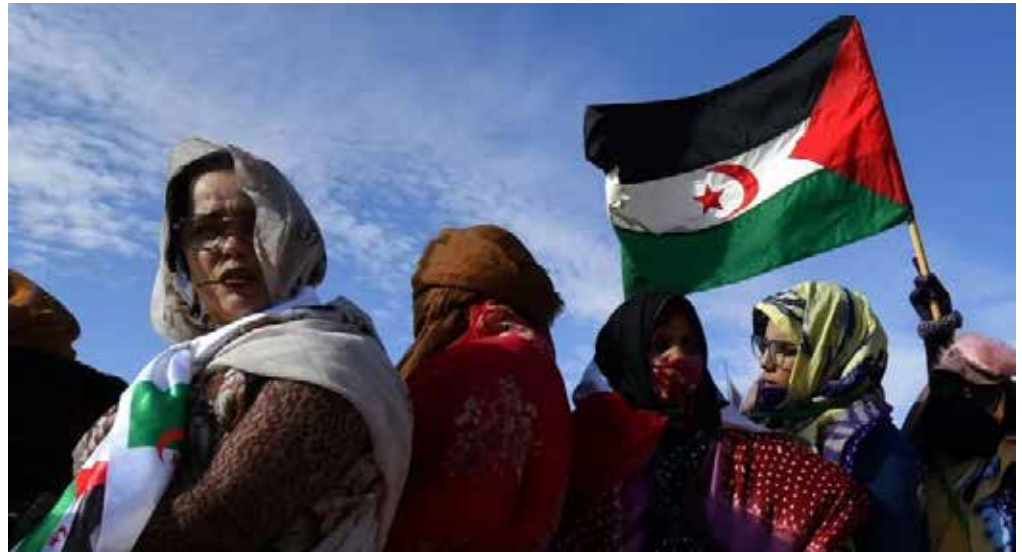
Thousands of Sahrawi people are living in refugee camps in Algeria.

Analysts say France's decision to back Morocco's claim is an attempt to repair relations between the two nations, which had soured after Rabat