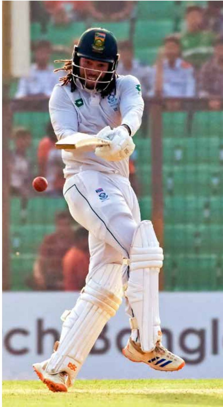
South Africa's opener Tony de Zorzi bats on the opening day of the second and final Test against Bangladesh at the Zahur Ahmed Chowdhury Stadium in Chattogram, Bangladesh, on Tuesday, October 29, 2024.

with the wicket of Markram, who chipped a tossed-up delivery straight to mid-on after scoring 33 off 52 with two fours.