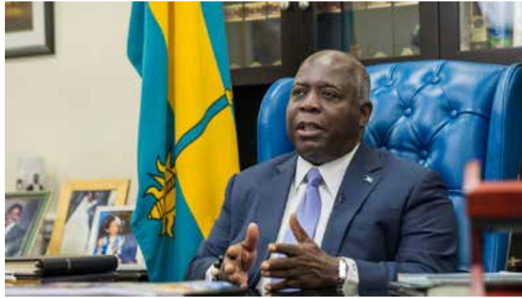
Prime Minister Phillip Davis.

He told the delegates that in a country like The Bahamas, with nearly 700