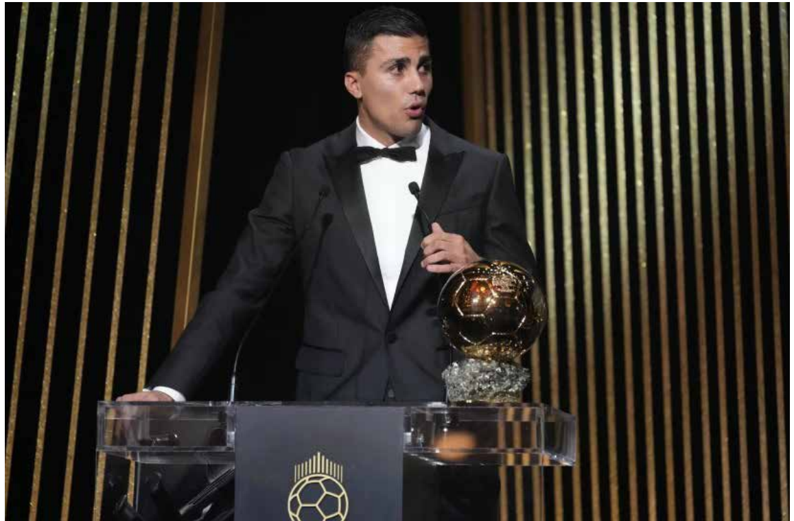
Manchester City's Spanish player Rodri delivers his speech as he receives the 2024 Men's Ballon d'Or award during the 68th Ballon d'Or (Golden Ball) award ceremony at Theatre du Chatelet in Paris, Monday, Oct. 28, 2024.

That legal filing between the European groups of player unions and domestic leagues claimed FIFA breaches EU competition law in the way the men's World Cup and Club World Cup were expanded without proper consultation.