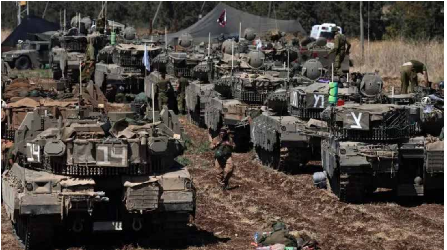
Israeli tanks had been assembling close to the border with Lebanon for several days in advance of the ground incursion.