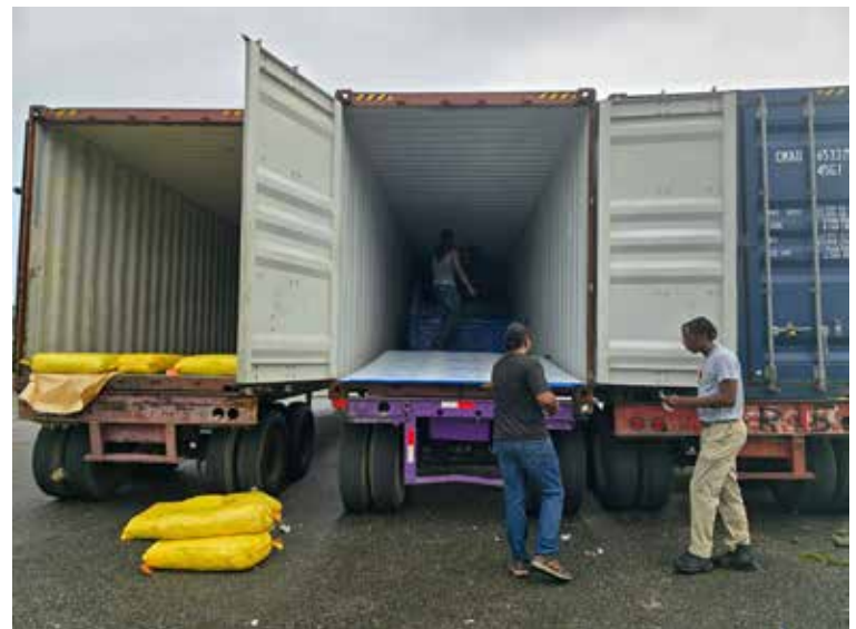
Workers offload hurricane shutters sheets