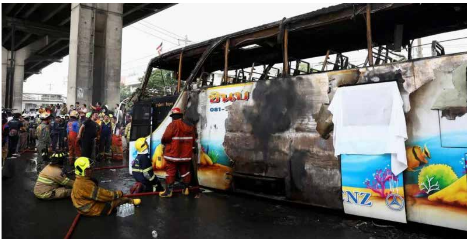
The bus, carrying dozens of primary school age children, was returning from a trip north of Bangkok.