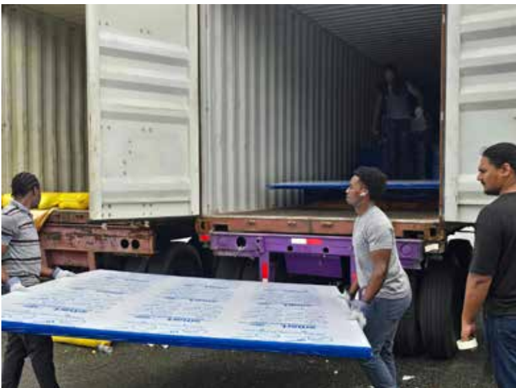
Hurricane shutters sheets being offloaded from container

The SIRF Fund remains dedicated to supporting the climate adaptation and resilience needs of Antigua and Barbuda, ensuring that our communities are equipped and prepared to face the challenges posed by a changing