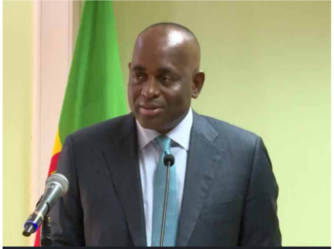
Prime Minister Roosevelt Skerrit addressing Monday's press conference.

Skerrit says CBI funds have mainly been used for infrastructural developments and government investments as his government took a decision early