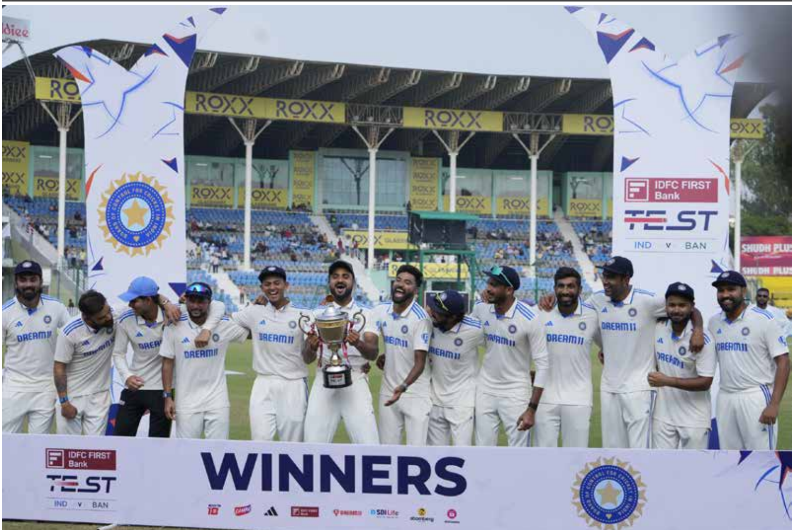
Indian players celebrate with the trophy after winning the two-match Test series against Bangladesh in Kanpur, India, Tuesday, October 1, 2024.