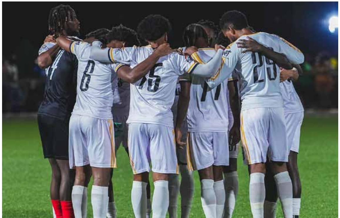
Players of the Jennings Grenades huddle before the start of their Premier League match against Parham at the ABFA Technical Center at Paynters on Sunday, October 27, 2024.

their second successive win with a 2-0 victory against the Willikies Warriors in Sunday's opening game.