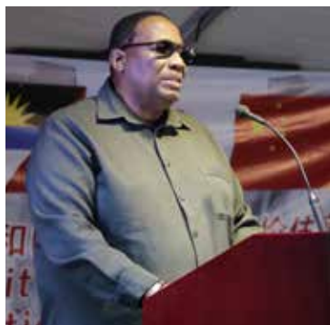
Ambassador Clarence Pilgrim

“Our aim has been to create a safe, modern, and inclusive environment—a place where every individual, fam-