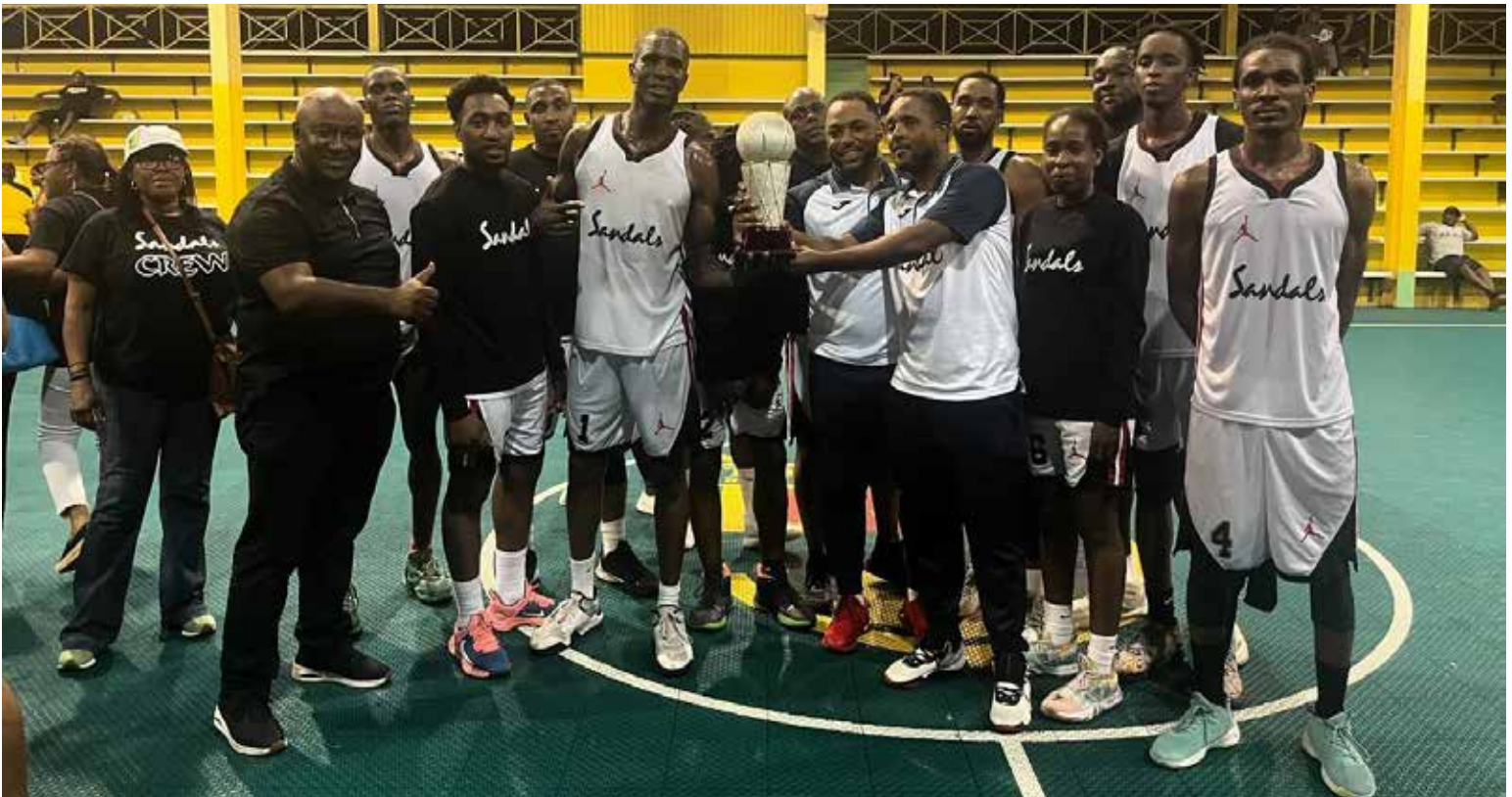
League champions Sandals remain on course to capture the double in the 2024 Business Basketball Championship. (File photo)