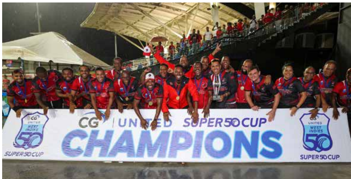
The CG United Super 50 2023 Champions - Trinidad and Tobago Red Force