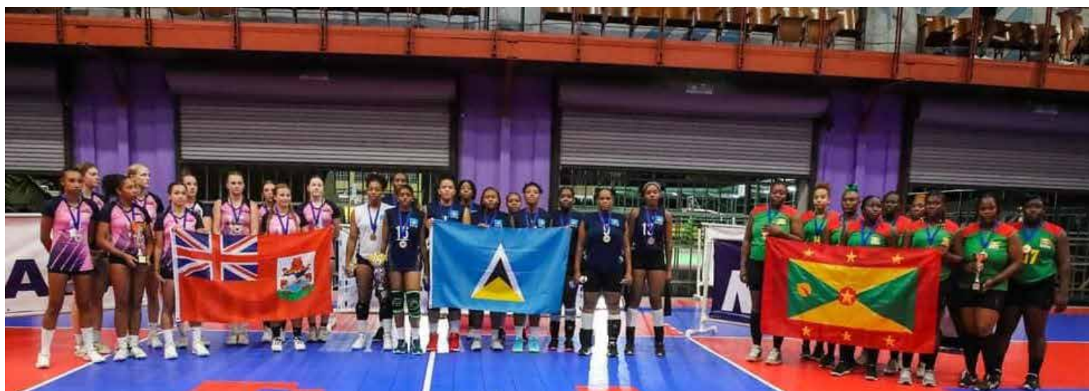
The top three finishers at the 2024 Eastern Caribbean Volleyball Association's Senior Women's Tournament, which ended at the indoor stadium at the YMCA Sports Complex on Tuesday. From left to right: Runners-up Bermuda, champions St. Lucia, and third place finishers Grenada.

Police will tackle the Ottos Rangers at St. Johnstone's Village Stadium, Lion Hill FC and Tryum FC will clash at the Golden Grove playing field, the Liberta Blackhawks will host Empire FC at Liberta, and SAP FC will take on Swetes at the Bolans playing field.