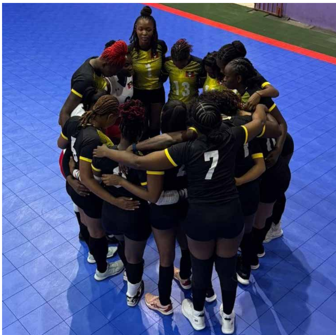
The Antigua and Barbuda Senior Women's Volleyball Team.

St. Lucia captured their title by coasting to an emphatic 3-0 victory against Bermuda in the final.