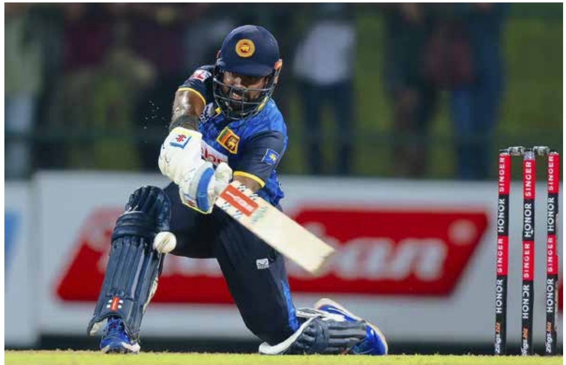
Charith Asalanka bats against the West Indies in the second one-day international at the Pallekele International Stadium in Sri Lanka on Wednesday, October 23, 2024.

Wanindu Hasaranga, who ended with four for