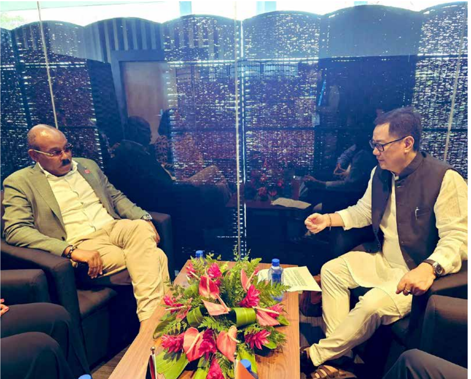
Prime Minister Gaston Browne met with India's Union Minister of Parliamentary Affairs, Kiren Rijju at the Commonwealth Heads of Government Meeting taking place in Samoa. Story on page 3