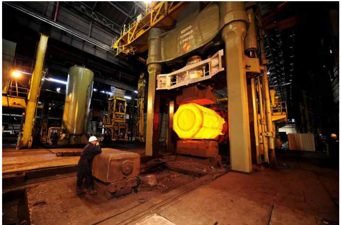
The Forge Shop at Sheffield Forgemasters, which will produce steel for a new factory in the UK that will produce barrels for artillery guns.

There is also a promise to bolster the defence of Nato's eastern flank; both the UK and Germany have already sent hundreds of troops to the Baltic states as