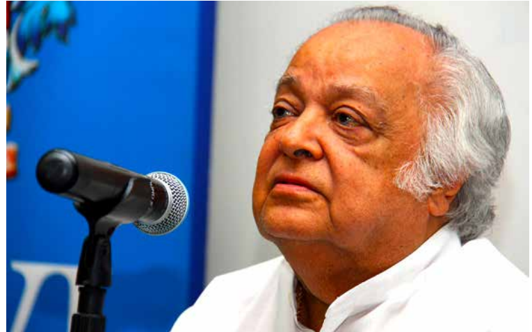
Sir Shridath “Sonny” Ramphal

Between 1989 and 2003, Sir Shridath served as Chancellor of The University of the West Indies. A tribute to his contribution to the University’s mission and vision is the Shridath Ramphal Centre for International Trade Law, Policy, and Services. It