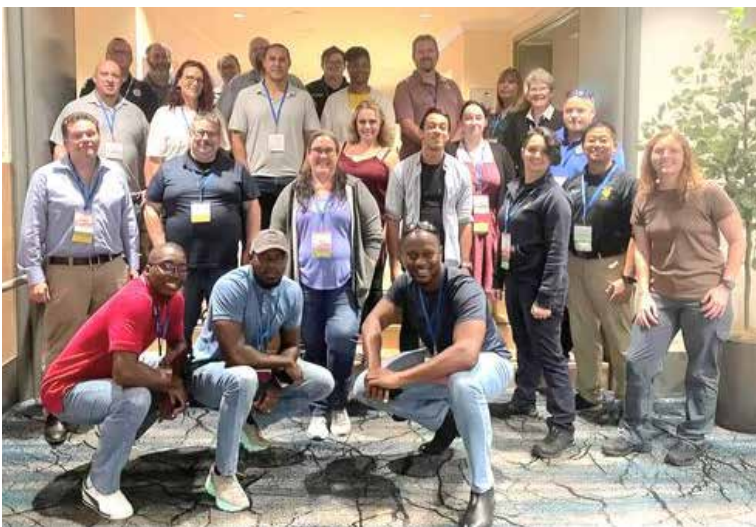
Group photo with the three Antigua technicians in front (stooping)