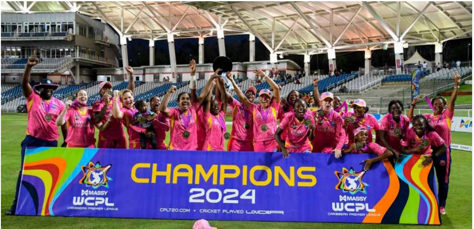
The Barbados Royals celebrate after winning the 2024 M Massy Women's Caribbean Premier League title at the Brian Lara Cricket Academy in Tarouba, Trinidad, on Thursday, August 29, 2024.