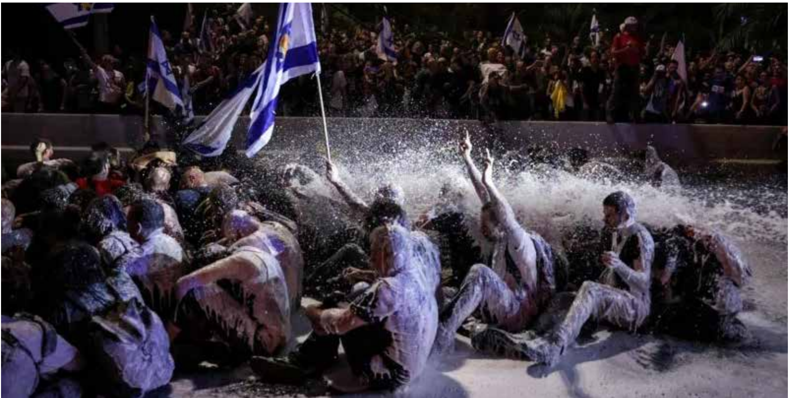
Police used water cannon to try to disperse the crowds in Tel Aviv.