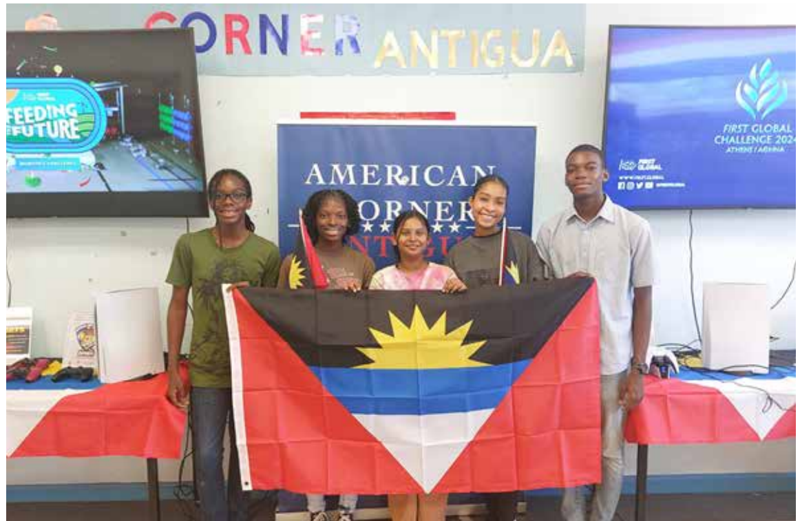
Team Antigua and Barbuda (DadliBots) - FGC 2024 Athens, Greece