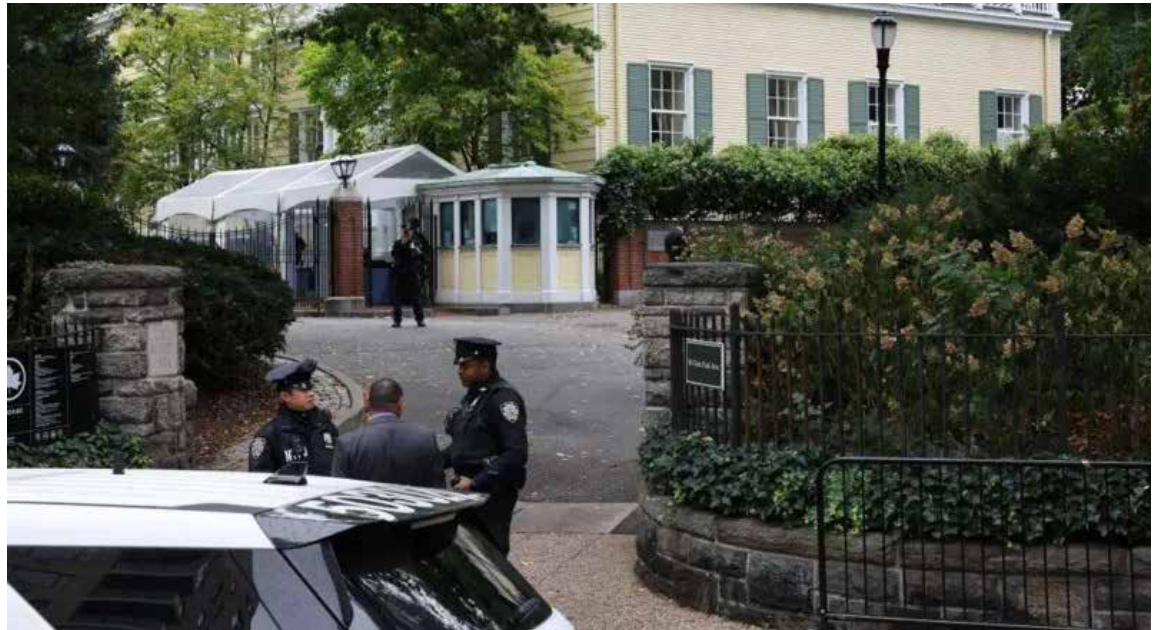
Officers outside Mayor Adams residence on Thursday morning.

The news conference was regularly interrupted