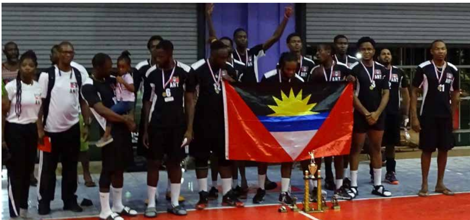
Antigua and Barbuda with their championship trophy after winning their first ever Eastern Caribbean Volleyball Association's Senior Men's title at the indoor facility at the YMCA Sports Complex on Sunday, 10 July, 2022. (File photo)