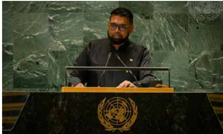
President Dr Mohamed Irfaan Ali.

“As a country, we are dedicated to the preservation of this vital global asset. I