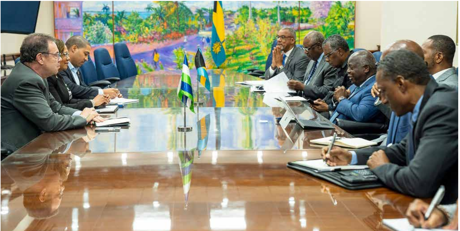
Bahamas PM Phillip Davis leads high-level team in discussions with CAF delegation.