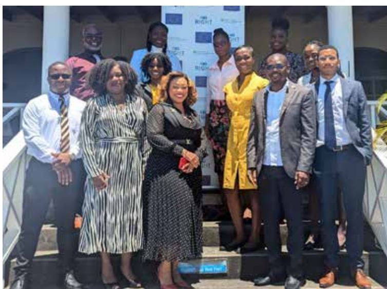
ODS Workshop attendees in St. Vincent and the Grenadines