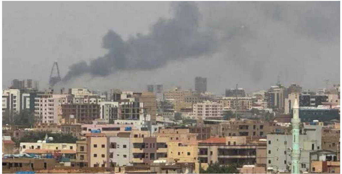
Smoke was seen rising over Khartoum on Thursday during the fighting.

have repelled the attempts, but sounds of clashes and plumes of smoke were reported coming from locations in central Khartoum.