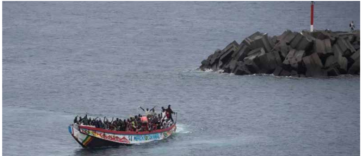
Migrants use wooden boats like this to try and reach the Canary Islands across the Atlantic Ocean.

He told the BBC that swordfish fishermen, who go more than 60km off the coast, often come across