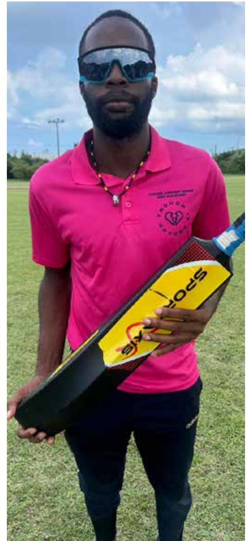
Deran Benta match affected by rain at Powells.

Dredgers beat PMS by eight wickets on a faster scoring rate in a