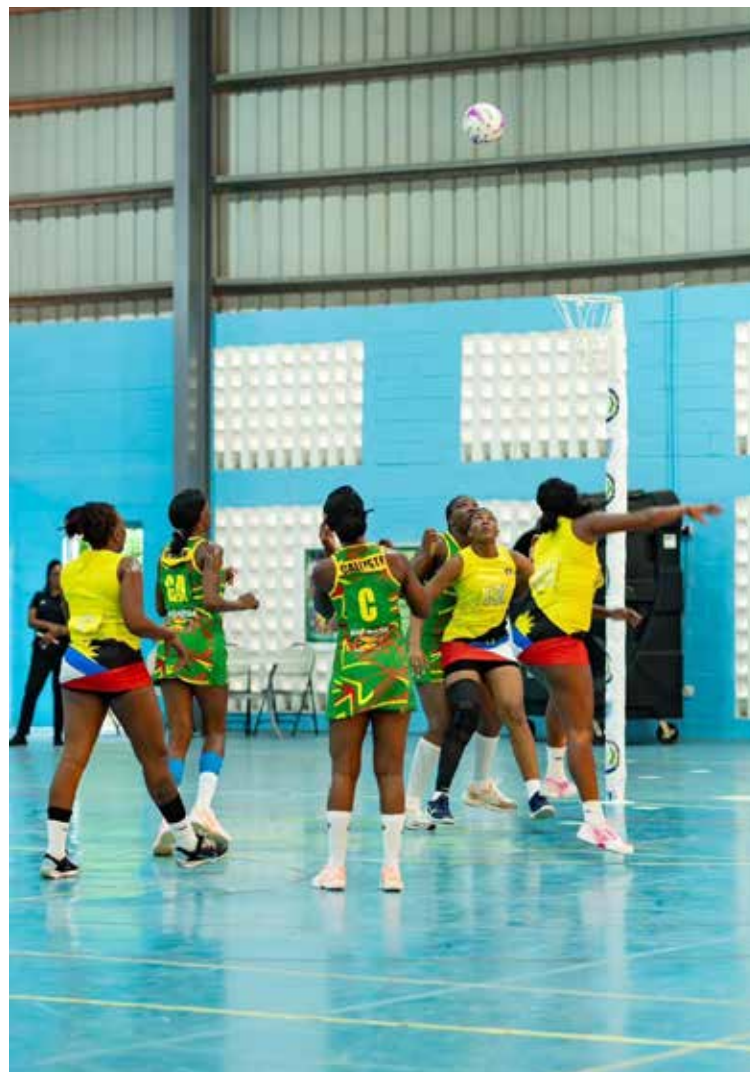
Players of Antigua and Barbuda (yellow top) compete against Grenada during their opening match of the ECCB International Netball Series at the Beausejour Indoor Facility in Gros Islet, St. Lucia, on Sunday, September 22, 2024.

The Commonwealth of Dominica also recovered from an opening round loss