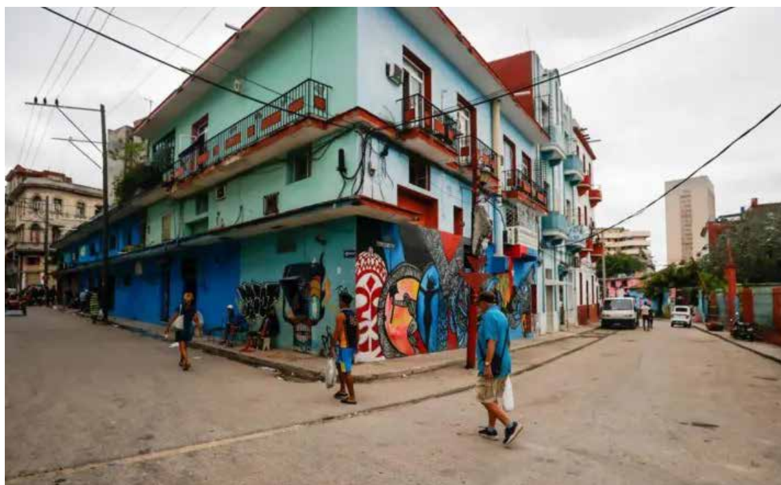
Even Cuban authorities have admitted that drugs have become a problem.

However, critics question the transparency of the government's statistics and say there's no independent oversight of the bodies which produce them or the methodologies they use.