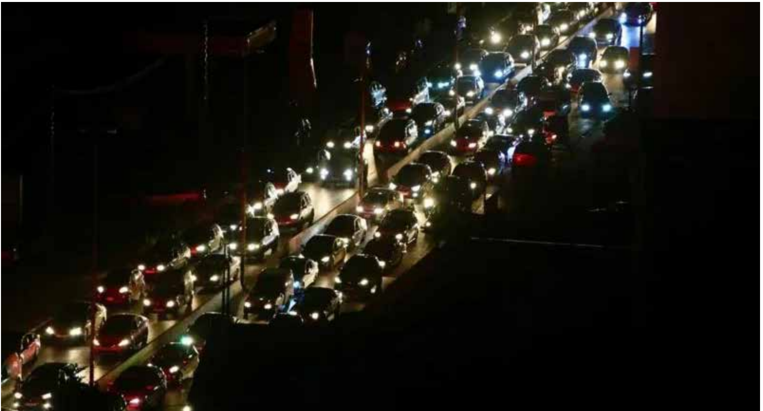
Roads in southern Lebanon are gridlocked as people seek safety further north.