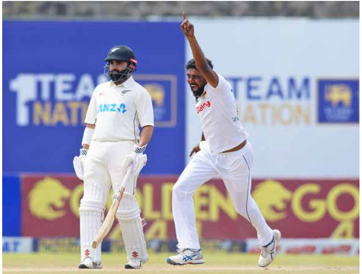
Sri Lanka's Prabath Jayasuriya, right, celebrates the wicket of New Zealand's Rachin Ravindra on the fifth and final day of the first cricket test match between New Zealand and Sri Lanka in Galle, Sri Lanka, Monday, Sept. 23, 2024.

New Zealand began the final day needing 68 runs for a memorable win with two wickets in hand, but Sri Lanka took only four overs to wrap up victory.