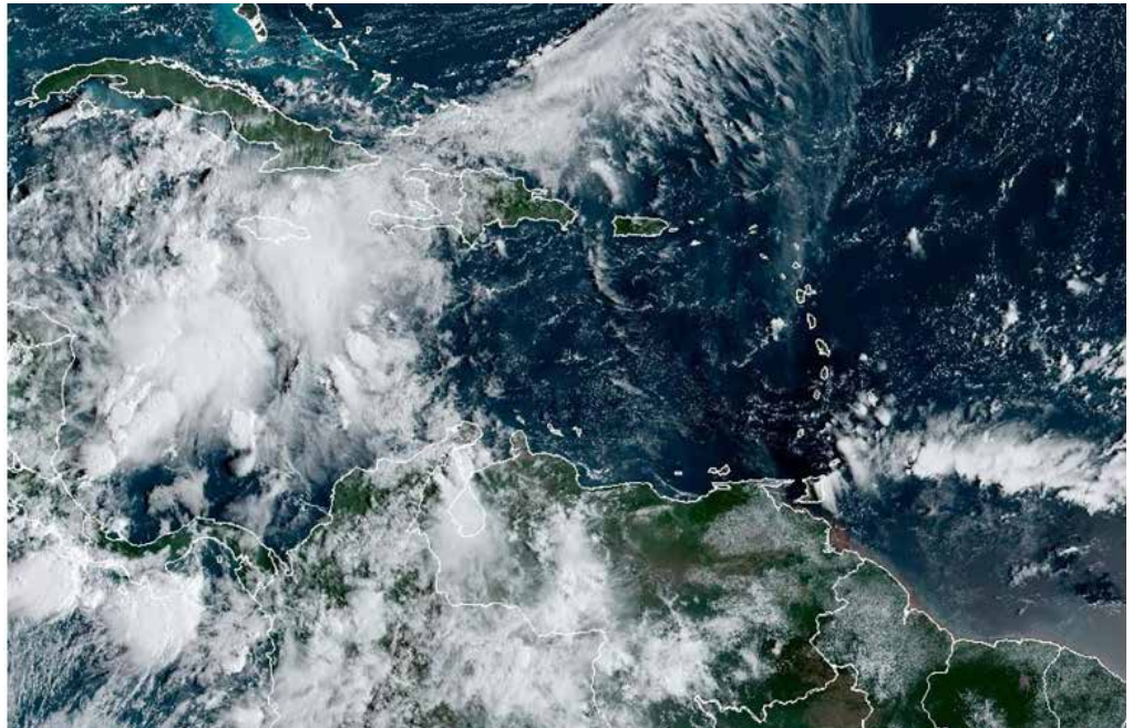
This image provided by the National Oceanic and Atmospheric Administration shows a cluster of storms located south of the Cayman Islands which are expected to strengthen in upcoming days, Monday, September 23, 2024.

Very warm sea temperatures are forecast to fuel formation of a tropical storm, which is forecast to quickly strengthen into a hurricane thanks to favourable conditions that include a moist atmosphere, which supports thunderstorm developments, and light