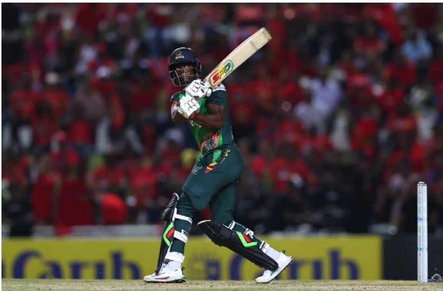
Captain of the St. Kitts and Nevis Patriots Andre Fletcher bats against the Trinbago Knight Riders in their CPL match at the Brian Lara Cricket Academy in Tarouba, Trinidad, on Sunday, September 23, 2024.