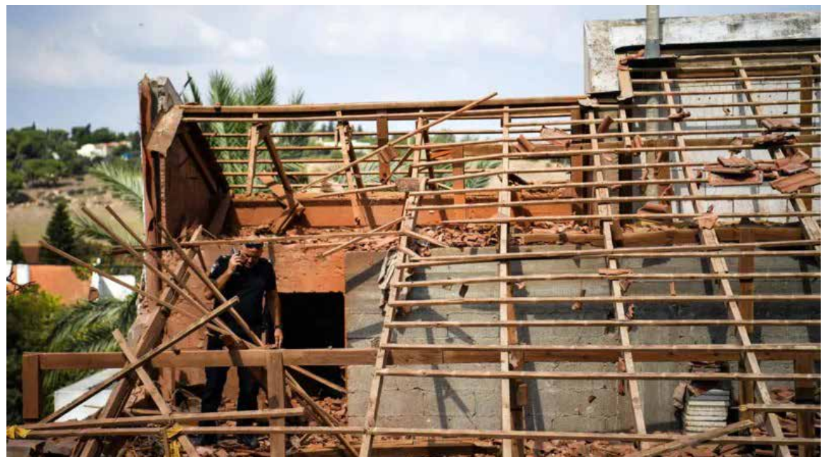
The roof of a house in northern Israel was destroyed by a rocket fired from Lebanon.

A family of four riding on a motorbike spoke to the BBC in Beirut during a brief stop on their way to the northern city of Tripoli.