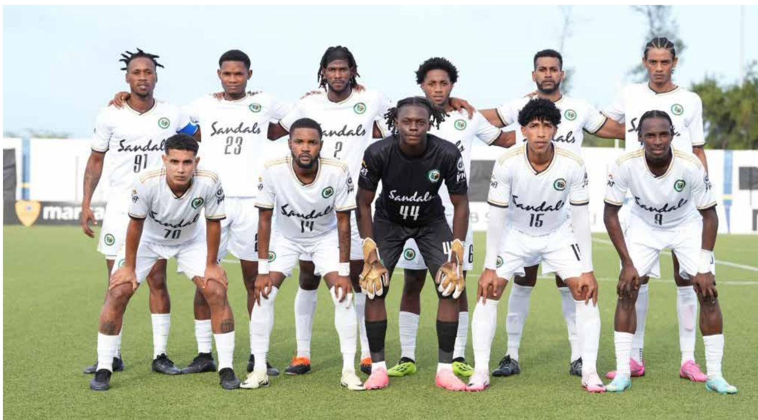
Players of the Jennings Grenades football team