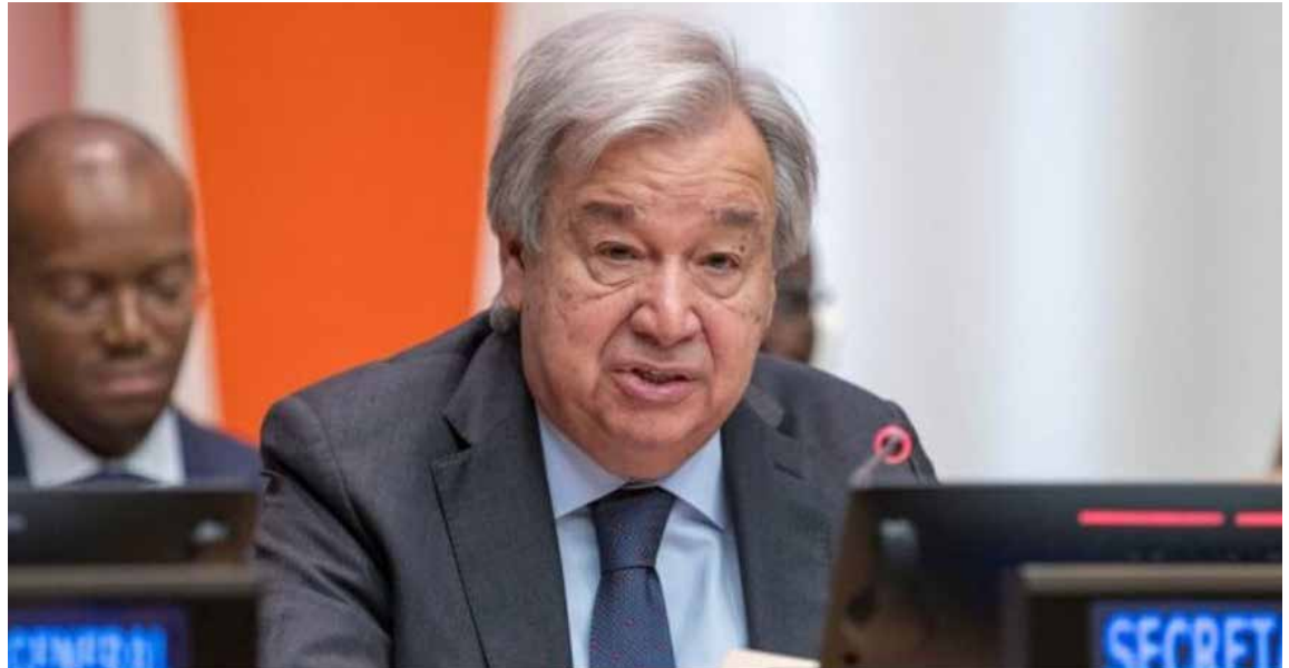
UN Secretary-General, António Guterres.

"The 'Pact for the Future', the 'Global Digital Compact', and the 'Declaration on Future Generations' open the door to new opportunities and untapped possibilities," said Secretary-General, Antonio Gu-