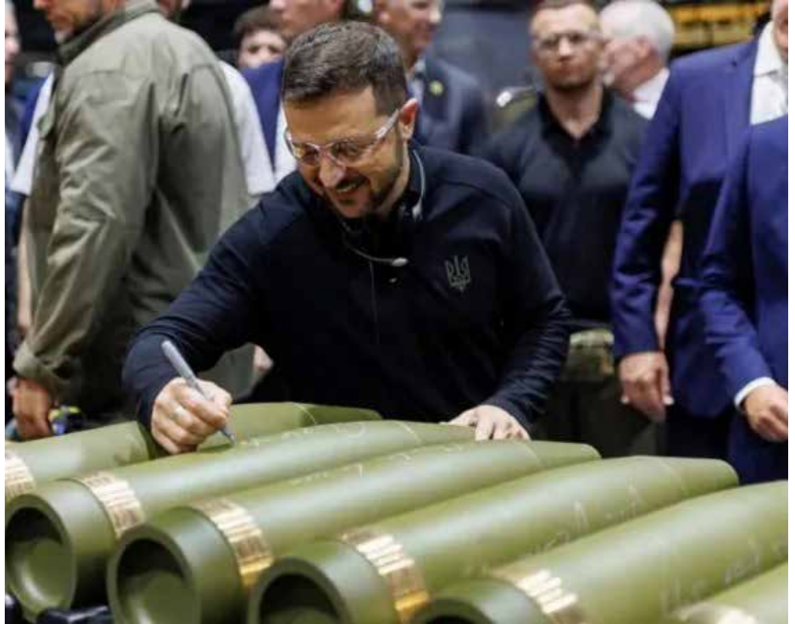
Before meeting Biden, the Ukrainian president visited a munitions factory in Pennsylvania.

Ukraine has been pleading for months for the US, UK and other Western allies to ease restrictions on the use of long-range