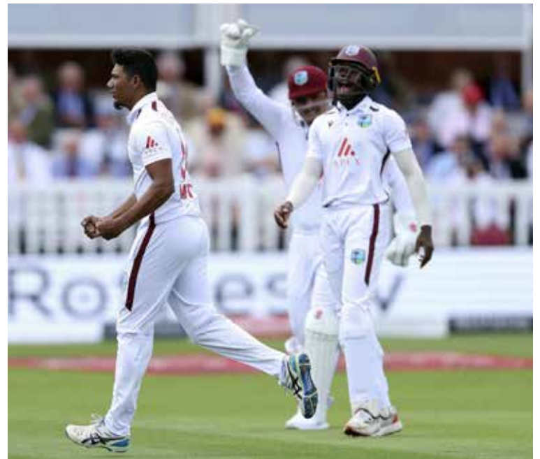
West Indies' Gudakesh Motie, left, celebrates taking the wicket of England's Ben Stokes on day two of the first Test match between England and West Indies at Lord's Cricket Ground, London, Thursday July 11, 2024.

After conceding 397 runs in the first innings, the tourists declared at 408 for nine. The home side were 46