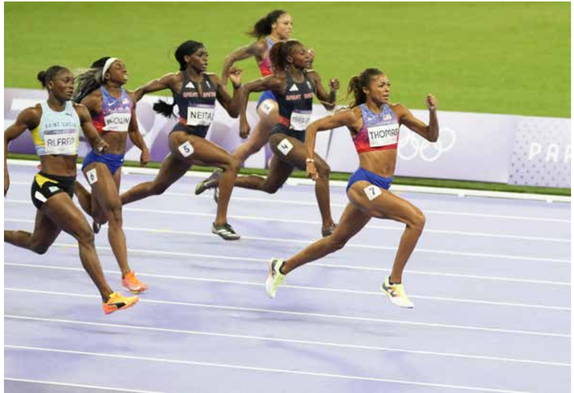
The United States of America sprinter Gabrielle Thomas, right, completes in the women's 200-meter final at the 2024 Summer Olympics in Saint-Denis, France, Tuesday, Aug. 6, 2024.