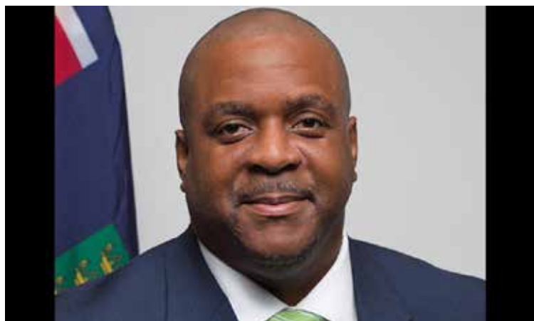
Former British Virgin Islands Premier Andrew Fahie.