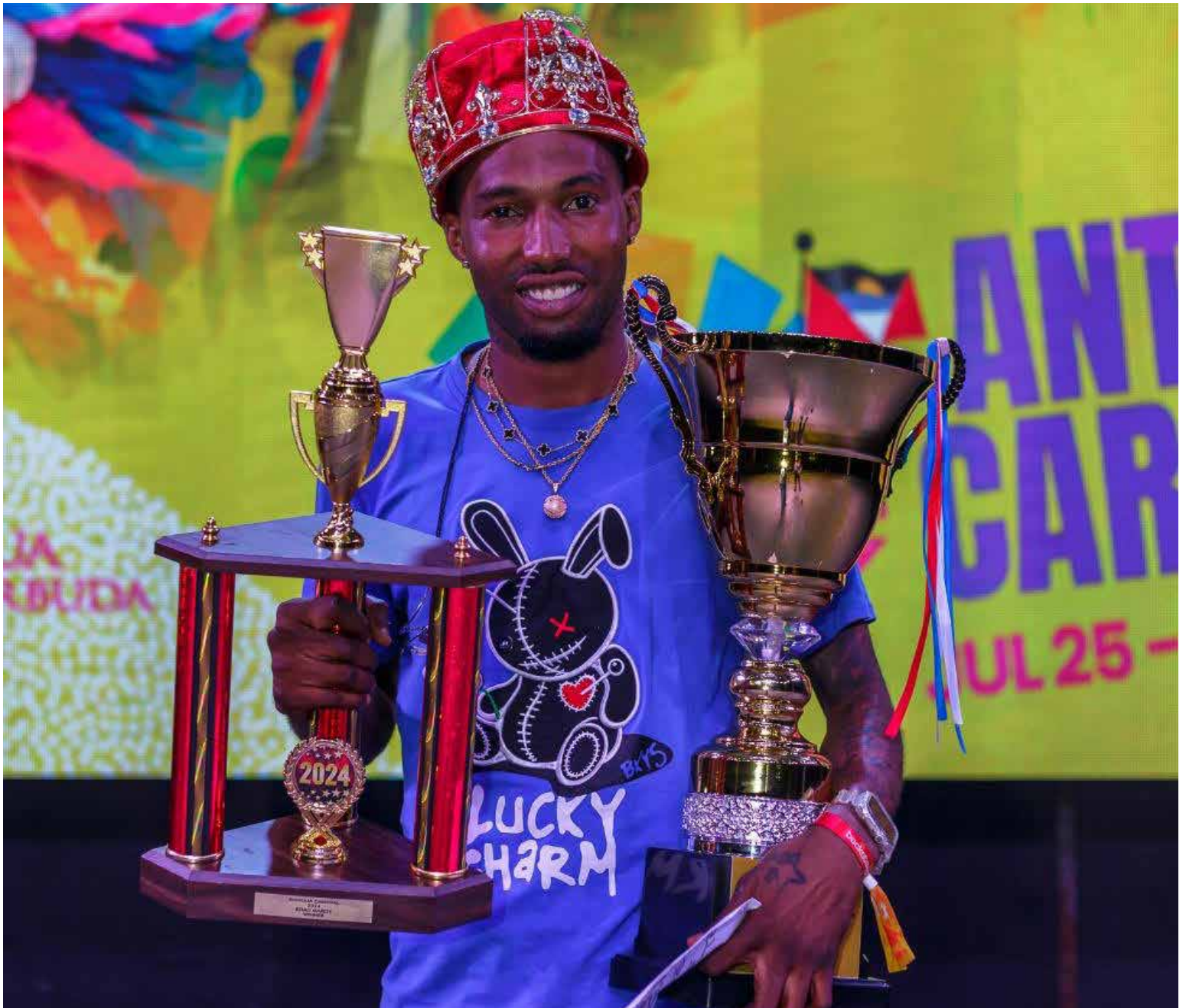
Lead singer of New Gen Band, Young Vice, collected two trophies on behalf of the band, as they captured the Road March title for Carnival 2024 along with winning the Party Monarch competition on Sunday night. Story on page 5.