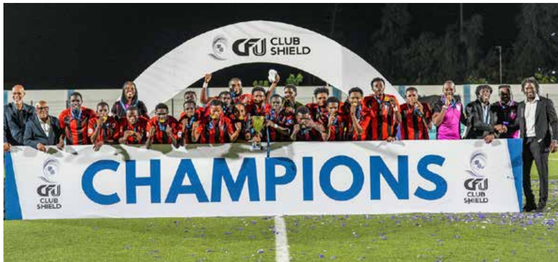
Jamaica's Arnett Gardens celebrate after winning the 2024 Caribbean Football Union Club Shield Championship in Willemstad, Curacao, Sunday, August 4.