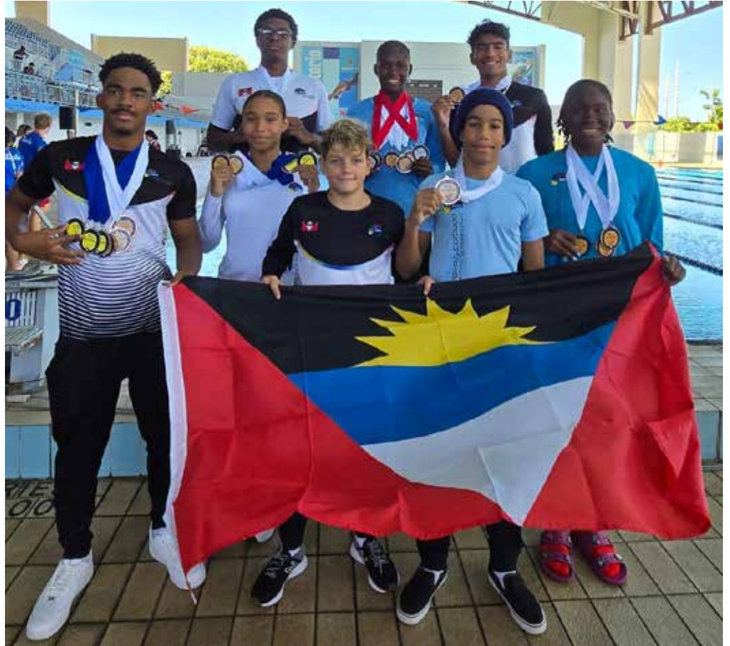
Members of the Antigua and Barbuda team celebrate with their medals at the PanAm Aquatics Age Group Swimming Championships in San Juan, Puerto Rico, from August 22-25.

200-meter breaststroke in the girls 15 to 18 division.