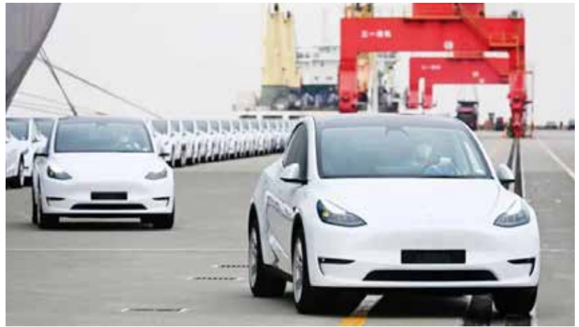
The US and European Union have announced similar duties on Chinese imports.

Chinese car brands are still not a common sight in Canada but some, like BYD, have taken steps to enter the country’s market.