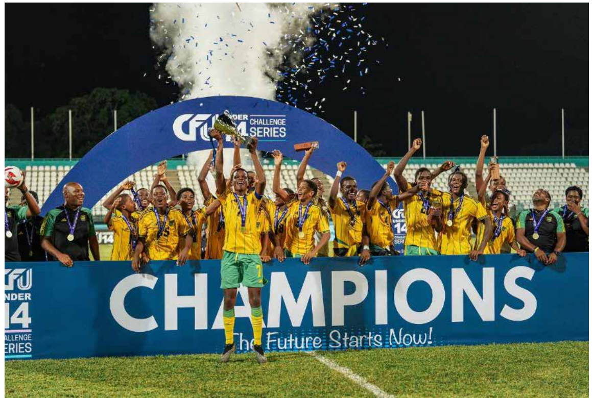
Jamaica celebrates victory in the Caribbean Football Union Under-14 Challenge Series in Tobago on Sunday, August 25, 2024.