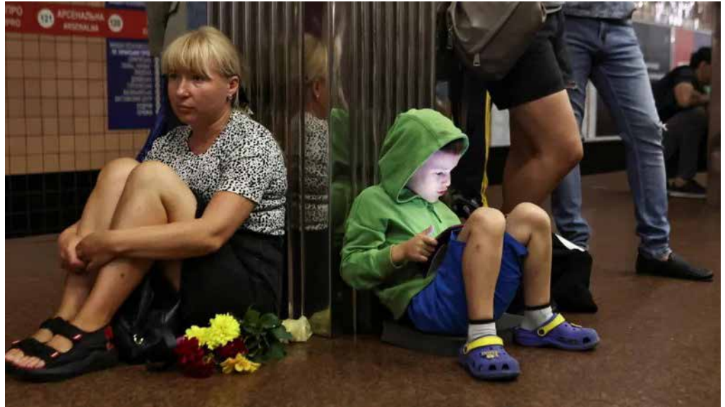
People sheltered in a metro station in Kyiv during the barrage.