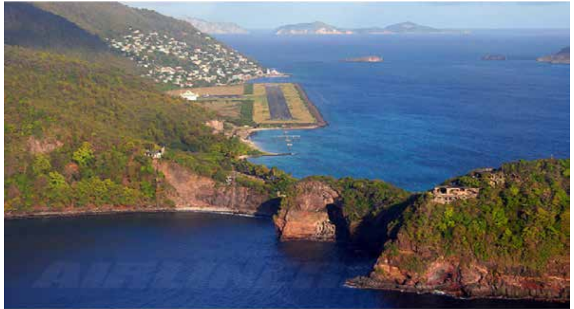
JF Mitchell Airport in Bequia