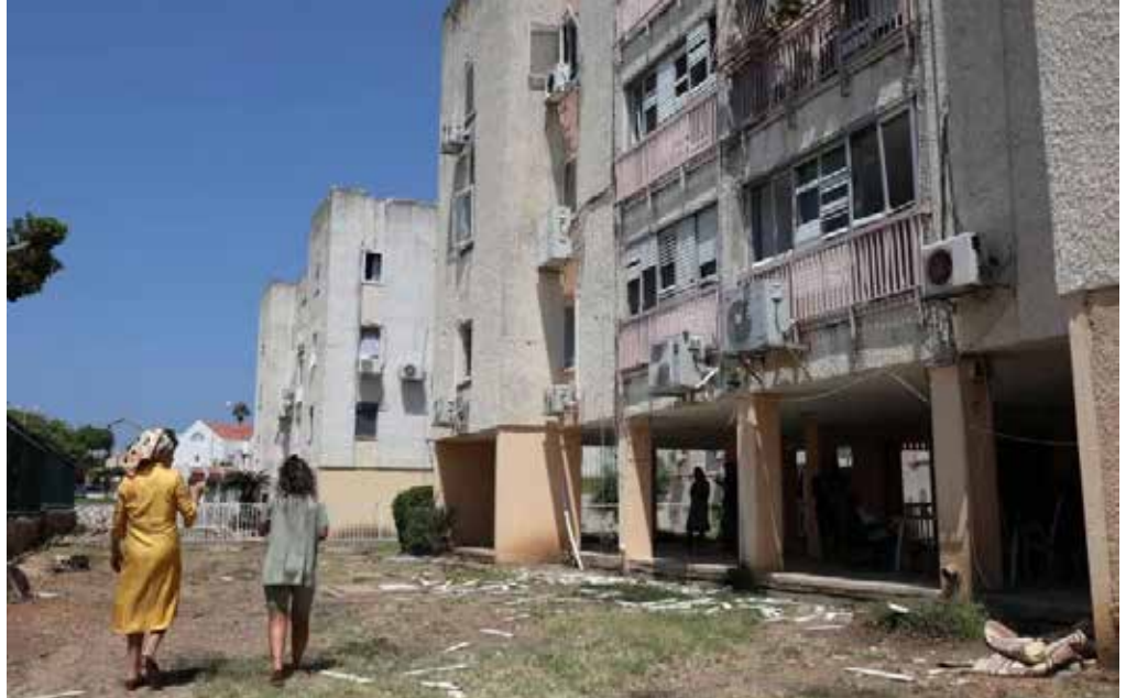
Hezbollah rocket fire damaged several homes in the Israeli coastal town of Acre.

It was the biggest flare-up here since the Gaza war began last October,