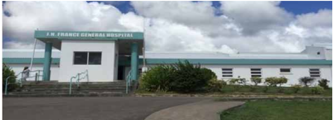
Joseph Nathaniel France (JNF) General Hospital.

They suggested that the footage could be “years old and is now being used maliciously to undermine public confidence in our