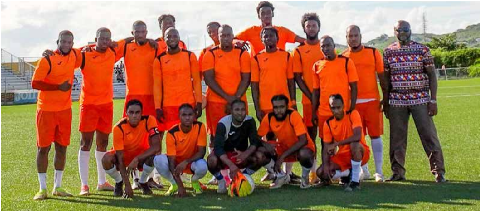
The Potters Tigers football team. (File photo)