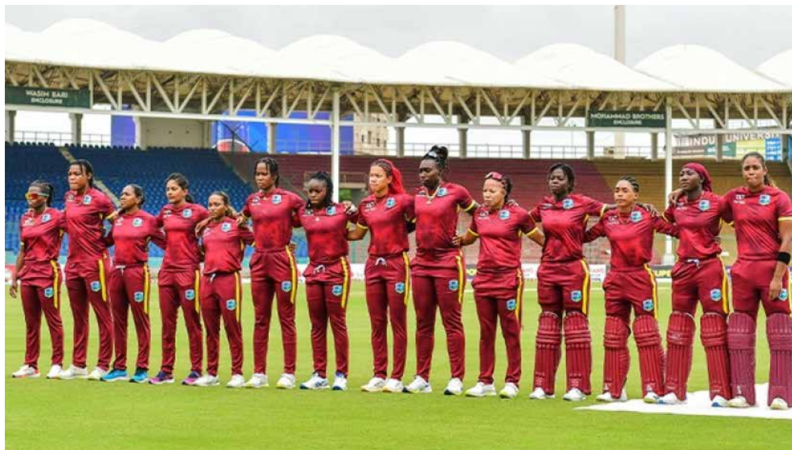
Players of the West Indies women's cricket team. (File photo)

As a result, Australia, India, New Zealand and the United Kingdom (England and Scotland) had issued travel advisories to their citizens to not travel to Bangla-