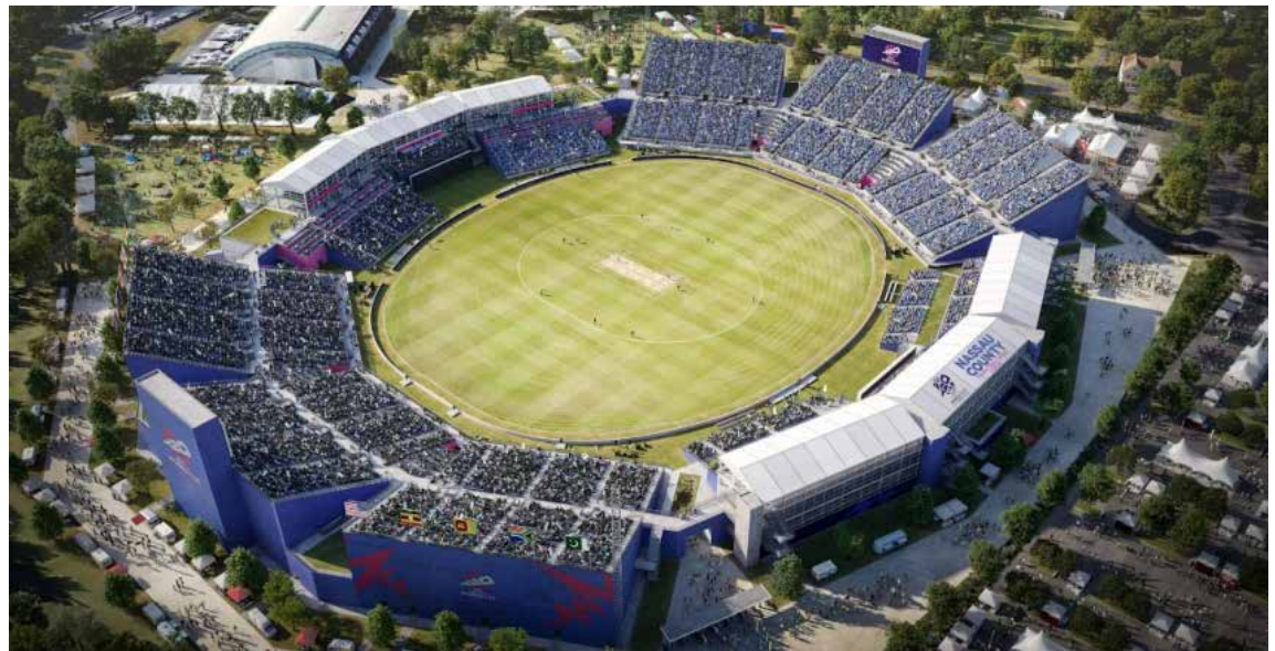
Nassau County International Stadium in New York

At the time, Andy Flower had said the pitch in New