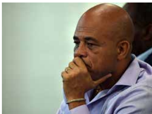
Michel Martelly.