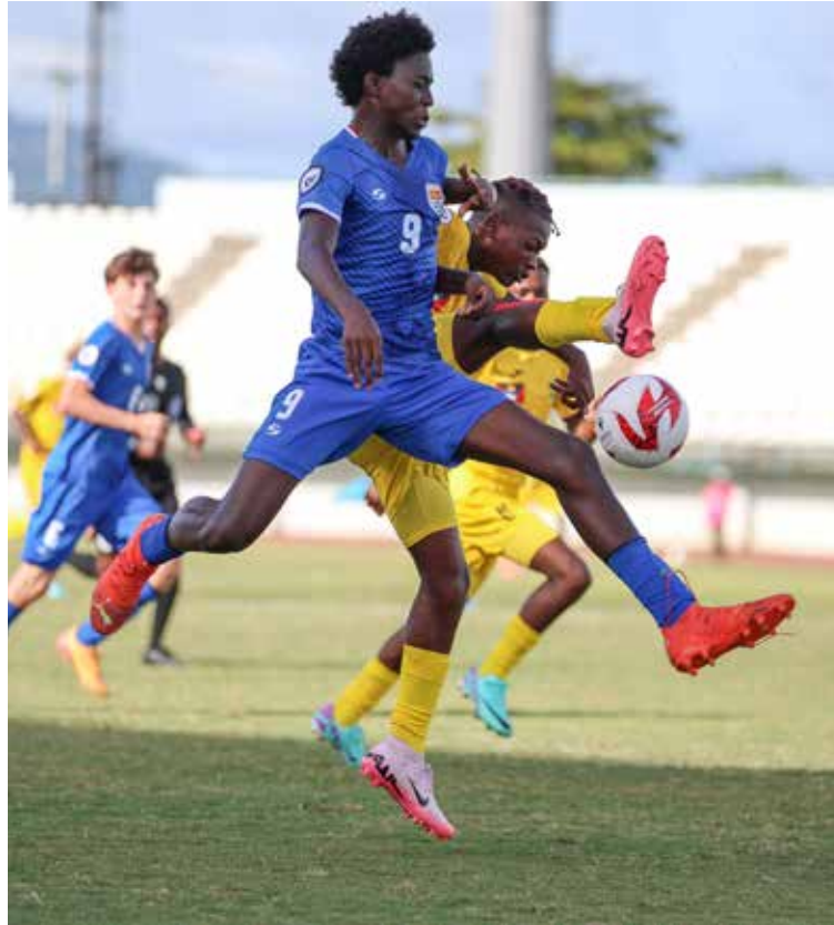
Players of the Cayman Islands (blue uniform) and Antigua and Barbuda compete during their Tier II, Group A match in the Caribbean Football Union Under-14 Boys Challenge Series at the Larry Gomes Stadium in Trinidad on Monday.