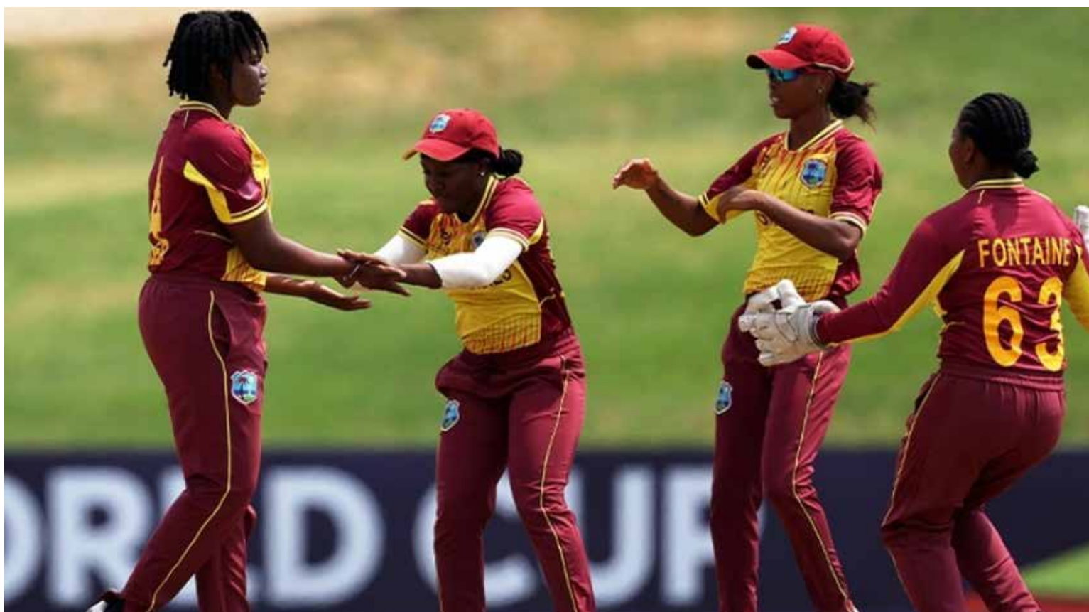
Players of the West Indies Under-19 women's team