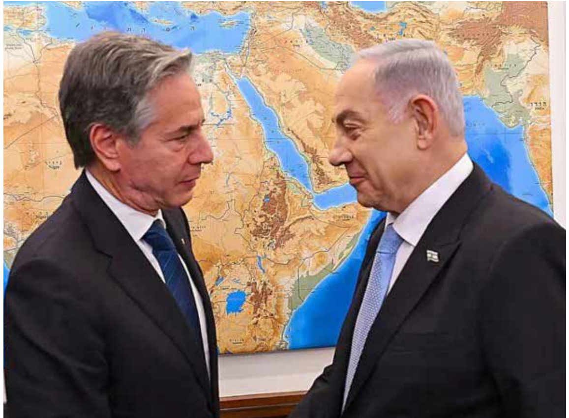
US Secretary of State, Anthony Blinken met with Israeli PM Benjamin Netanyahu on Monday.

Each accuses the other of obstinate cynicism, and blocking a deal.