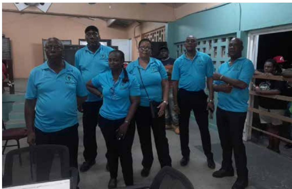
Players of the Cyclone International Domino Club of Antigua and Barbuda.

"I really think the line-up that we have can do the job. Obviously being mentally tough is most important in playing Test matches. We've been asking for more Test matches to play," he said.