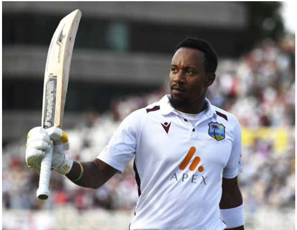
West Indies Kavem Hodge walks off after being dismissed by England's Chris Woakes during day two of the second Test between England and West Indies at Trent Bridge cricket ground, Nottingham, England, Friday, July 19, 2024.

Root reclaimed the number one Test batting position after scoring 87 in the first innings of the third and final match against West Indies in Birmingham, which his side won by 10 wickets.