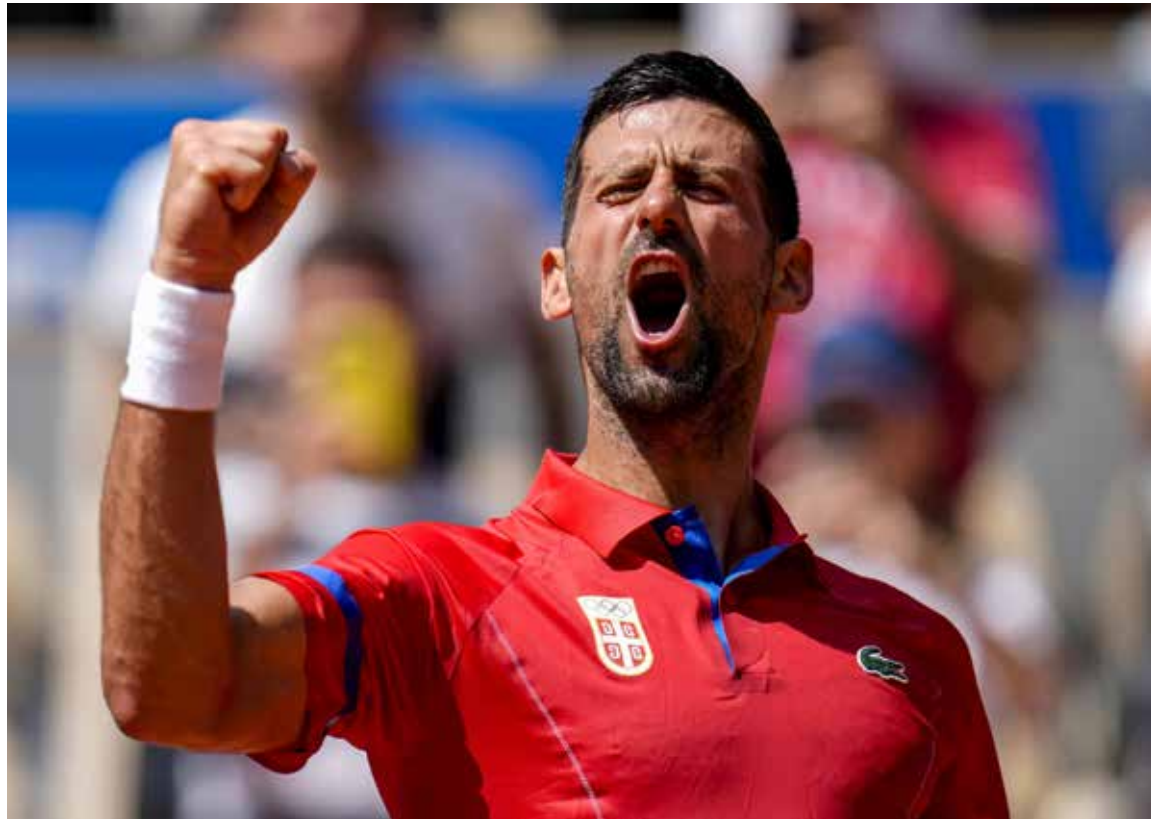
Serbia's Novak Djokovic celebrates his victory over Germany's Dominik Koepfer during the men's single tennis competition at the Roland Garros stadium, at the 2024 Summer Olympics in Paris, France, Wednesday, July 31, 2024.

Tokyo Olympics singles champion Alexander Zverev stayed on course for a repeat as the third seed beat Australia's Alexei Popyrin 7-5, 6-3 to set up a quarter-final with Lo-