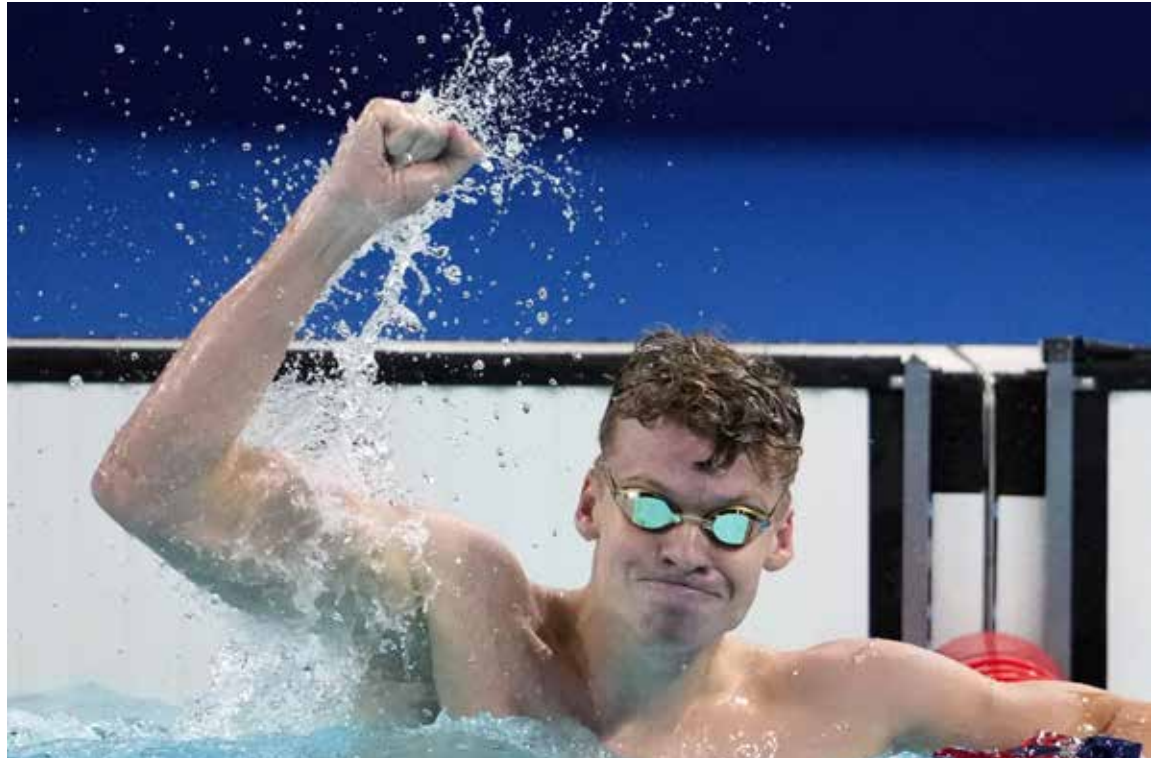
Leon Marchand, of France, celebrates after winning the men's 200-meter breaststroke final at the 2024 Summer Olympics in Nanterre, France, Wednesday, July 31, 2024.

The winner of Sunday's Individual Medley started with an incredible comeback in the butterfly after Hungarian world record holder and reigning champion Kristof Milak led the