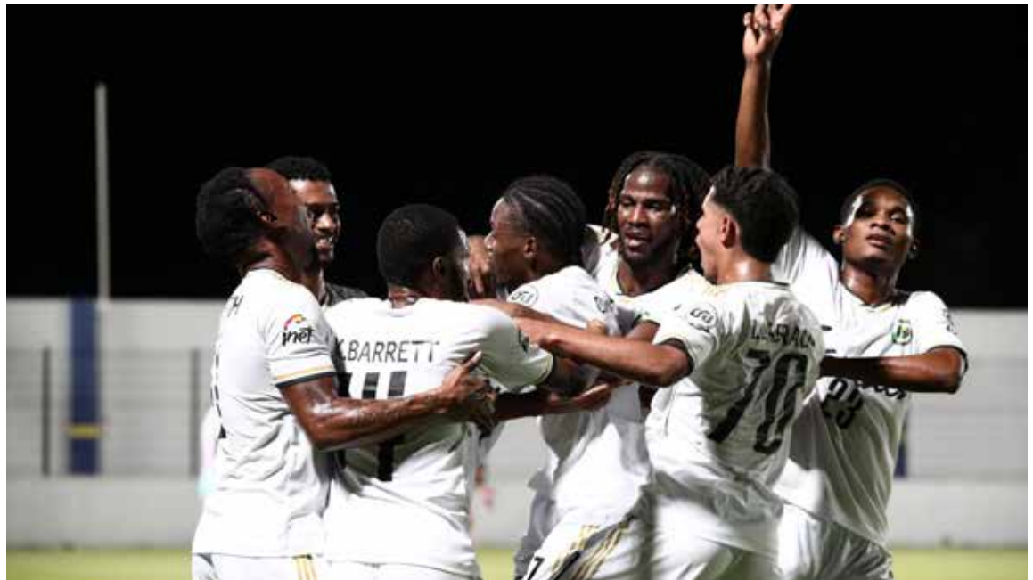
Players of the Jennings Grenades celebrates after scoring against SV Robinhood of Suriname in the quarter-finals of the 2024 Caribbean Football Union Club Shield Championship at the Stadion Rignaal Jean Francisca in Willemstad, Curaçao, on Tuesday, July 30.

Robinhood wasted little time pressing on offense toward the Grenades' back line with several combi-