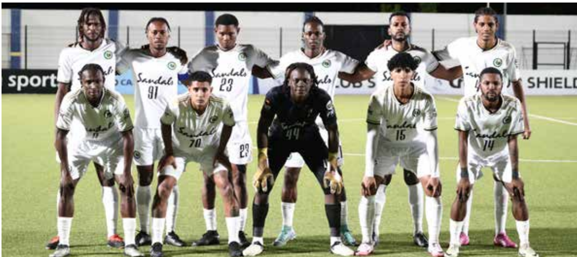
The Sandals and Inet Jennings Grenades FC starting XI against SV Robinhood of Suriname in the quarter-finals of the 2024 Caribbean Football Union Club Shield Championship at the Stadion Rignaal Jean Francisca in Willemstad, Curaçao, on Tuesday, July 30.