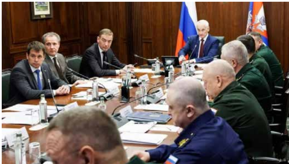
Russian Defence Minister Andrei Belousov chaired a meeting in Moscow to discuss security in regions bordering Ukraine.

The measures involve improving the "management of troops" in the Belgorod region, which neighbours Kursk, according to a video published on the Russian defence ministry's Telegram