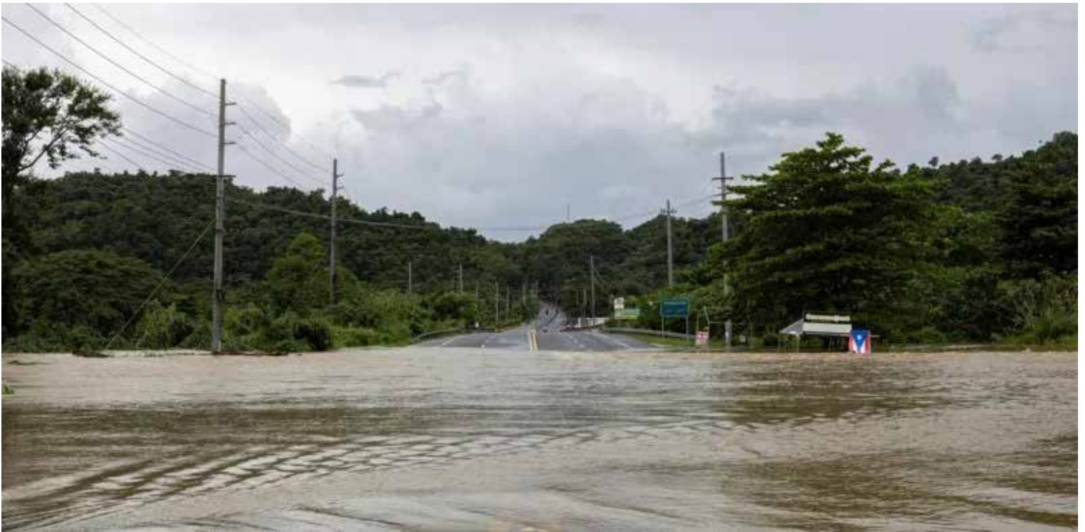
A flooded area in Toa Baja, Puerto Rico.