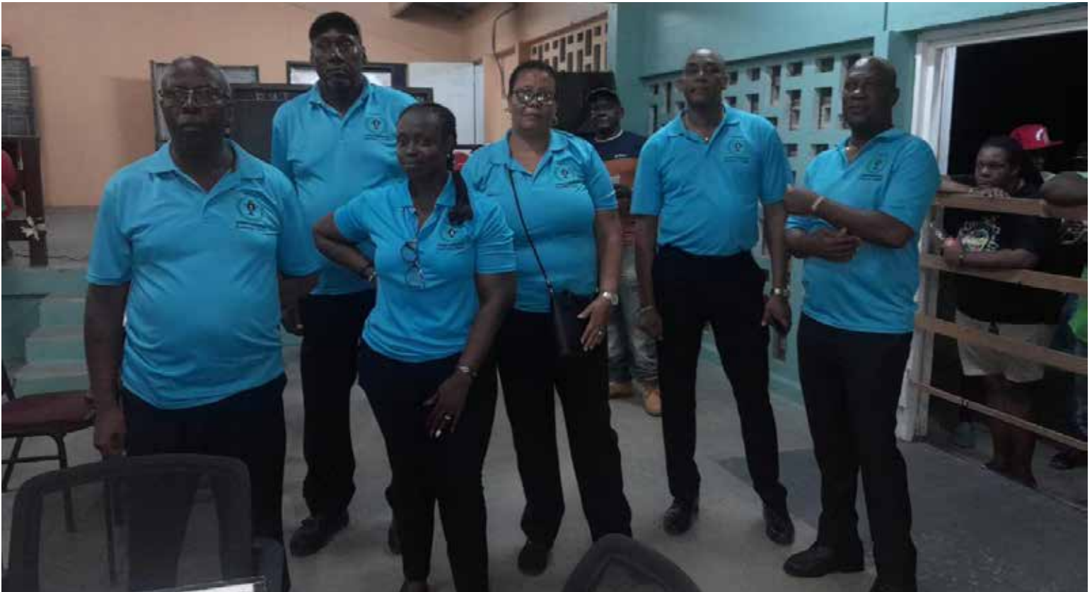
Players of the Cyclone International Domino Club of Antigua and Barbuda. (ABNDA)