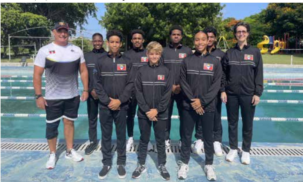
The national team to represent Antigua and Barbuda at the PanAm Aquatics Age Group Swimming Championships in San Juan, Puerto Rico, from August 22-25.