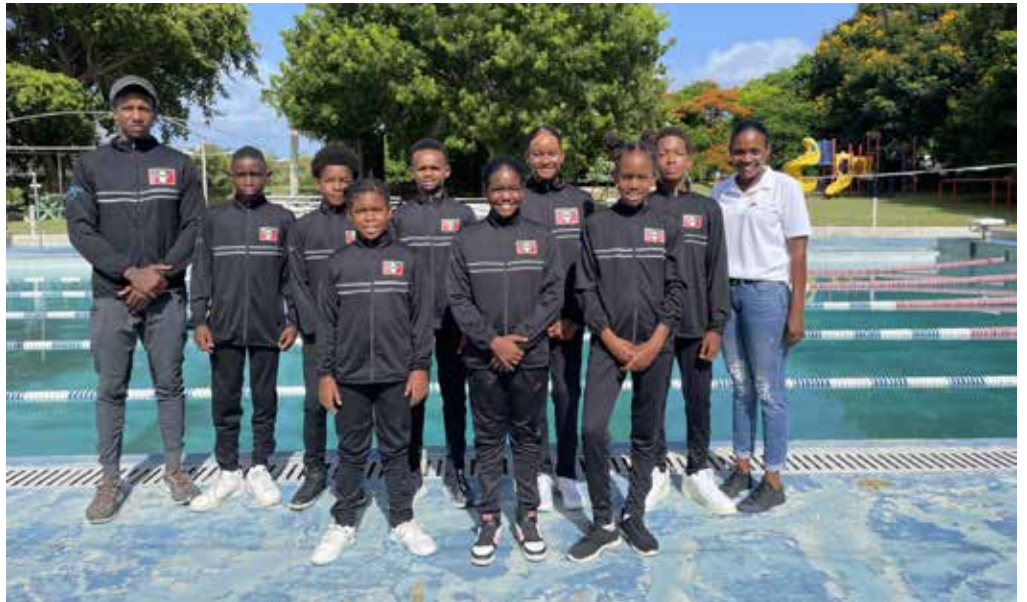
The national team to represent Antigua and Barbuda at the Goodwill Games Swim Meet at the Rodney Heights Aquatic Center in Gros Islet, St. Lucia, this weekend.

ipating at this weekend's meet in St. Lucia. They are Trinidad and Tobago,