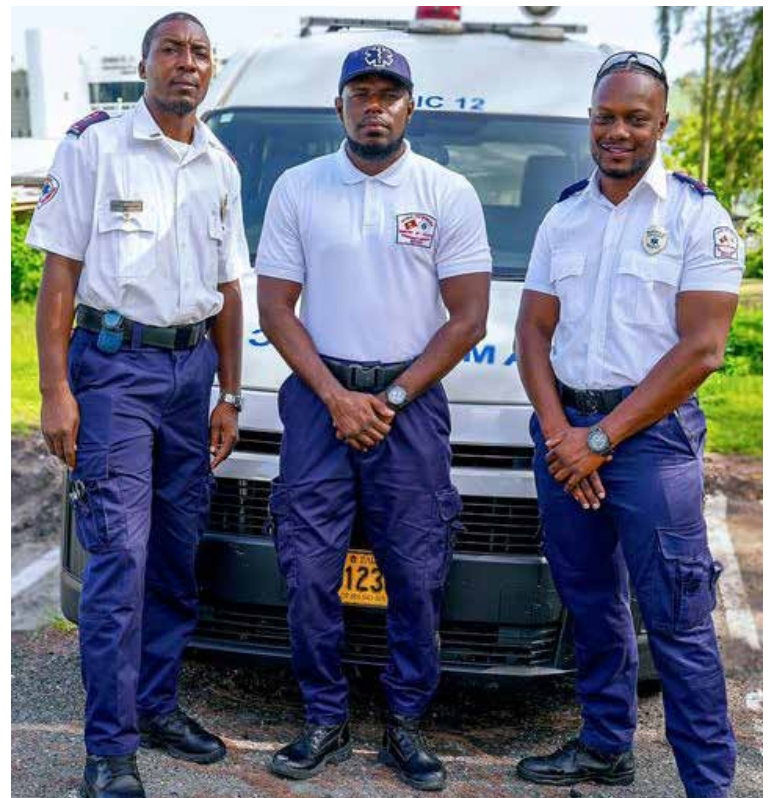
ABEMS supervisors to participate in training in the USA

The Ministry anticipates significant benefits for the citizens and residents of Antigua and Barbuda as a result of this professional de-