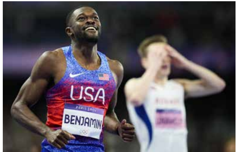
Rai Benjamin of the United States celebrates after winning the men's 400-meter hurdles final at the 2024 Summer Olympics in Saint-Denis, France, Friday, Aug. 9, 2024.

Rai, 27, who finished second behind Warholm in Tokyo, matched his season's best time of 46.46 seconds in the Paris race. During those intense 46 seconds, Benjamin experienced a whirlwind of emotions while his son competed