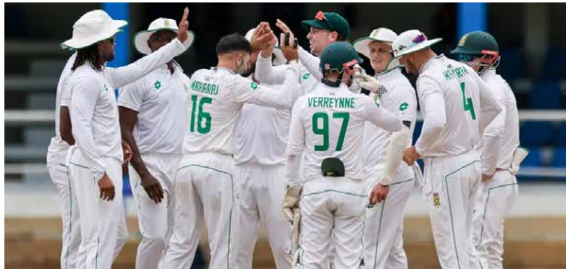
South Africa's left-arm spinner Keshav Maharaj (#16) celebrates with teammates after claiming one of his four wickets on the fifth and final day of the first Test against the West Indies at the Queen's Park Oval in Trinidad on Sunday, August 11, 2024.

A brilliant 68 from just 50 balls from Tristan Stubbs and quick runs from openers Tony de Zorzi and Aiden