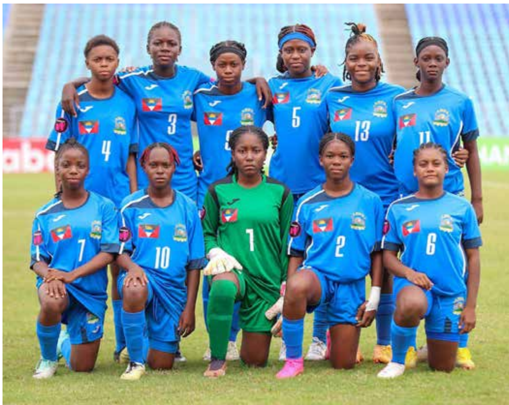
The Antigua and Barbuda Benna Girls starting XI against Curacao in their seventh place playoff at the CONCACAF Under-15 Girls Championship at the Hasely Crawford Stadium in Trinidad and Tobago on Friday, August 9, 2024.

The Benna Girls were ranked 7th overall in League B after beating Curacao in the playoff.