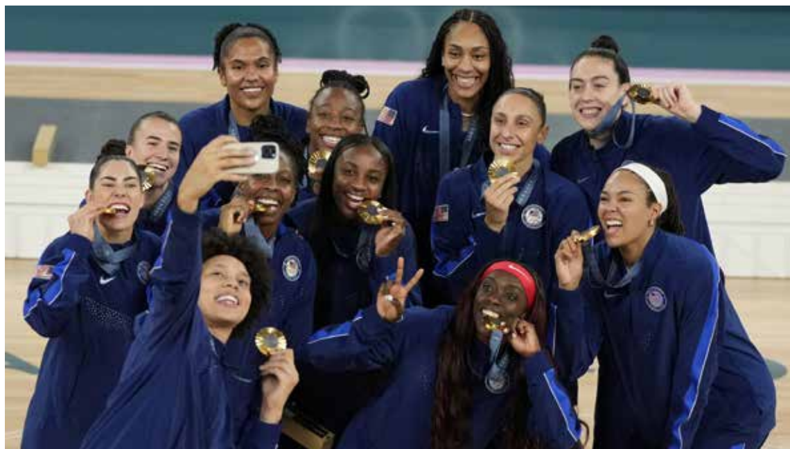
The United States team poses for a picture with their gold medals at Bercy Arena at the 2024 Summer Olympics in Paris, France, Sunday, Aug. 11, 2024.

China came in second in the total medal race with 91. China won 40 gold, 27 silver and 24 bronze. Japan was a distant third with 20 gold medals, 45 overall. Great Britain won 65 medals,