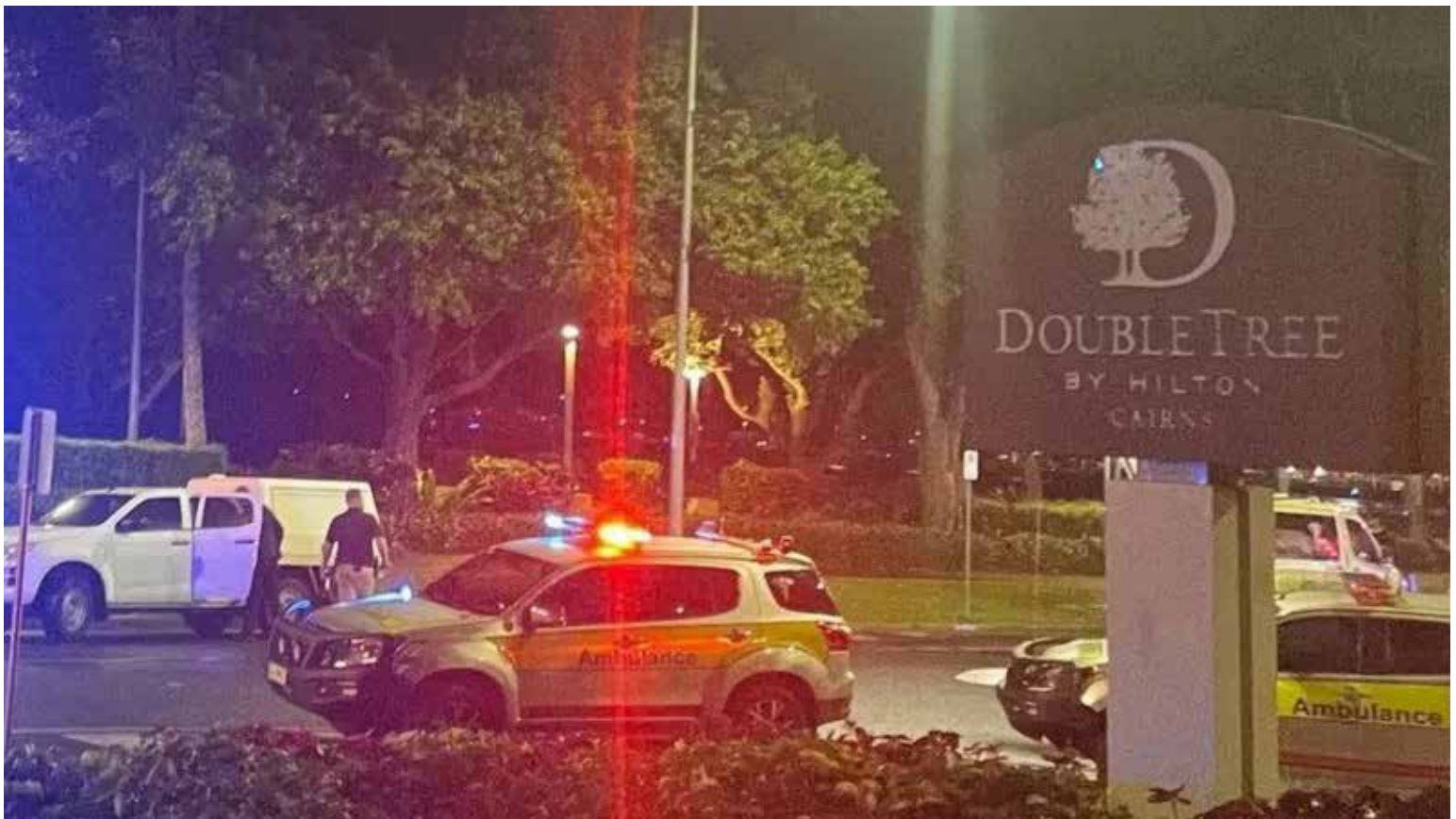
Emergency services rushed to evacuate the hotel in Cairns.