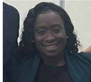
Senator Shenella Govia

Sen. Govia also spoke of the role of the sponsors in ensuring that Carnival 2024 was the overwhelming