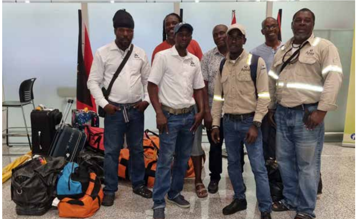
APUA workers return from Canouan on Sunday afternoon