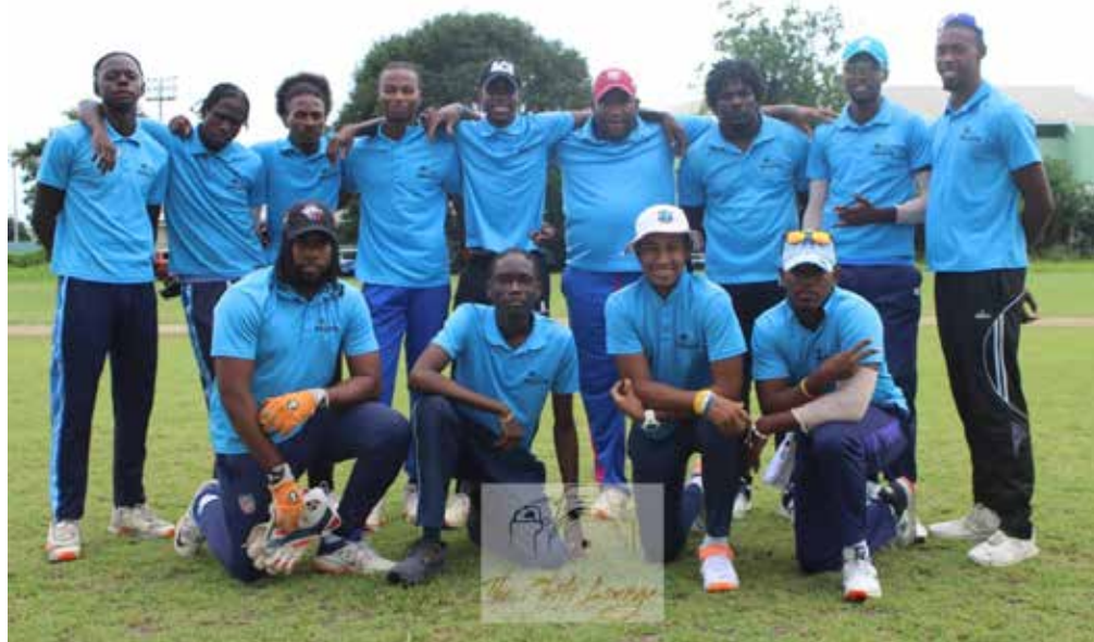
Bryson's Shipping and Insurance Bullets softball cricket team