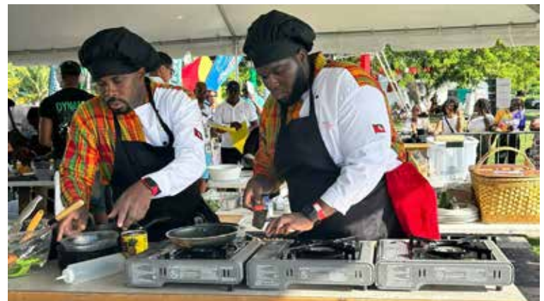
Team Antigua Barbuda competes in Appetizer Round at Nevis Mango Festival