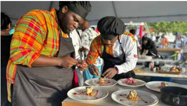
Team Antigua Barbuda competes in Mystery Basket Round at Nevis Mango Festival