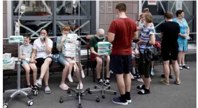
Patients had to be taken to safety with their intravenous drips still attached.

He called for a stronger Western response "to the