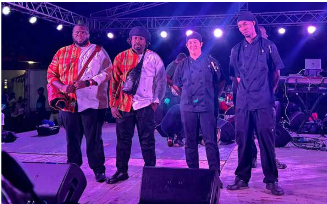
Team Antigua Barbuda announced first runner-up at Nevis Mango Festival

The final round presented a Mystery Basket challenge.