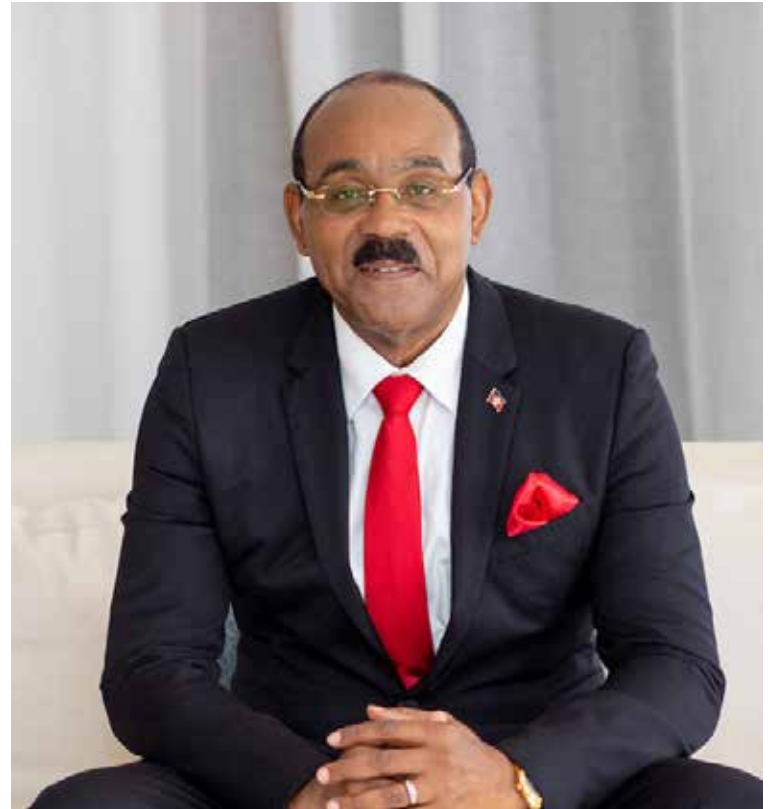
Prime Minister Gaston Browne