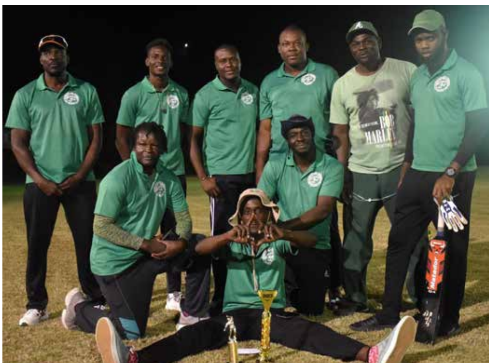
Marco Inc./Grill Box Buckley's 3J's softball cricket team