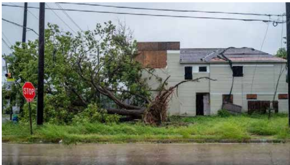
A tree in Houston, Texas was toppled by Hurricane Beryl's fierce winds. inches of rain fell in just a few hours.

Torrential rainfall and flash flooding have also occurred in areas where