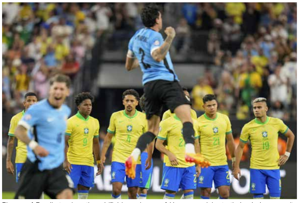
Players of Brazil stand on the midfield as players of Uruguay celebrate their win in a penalty shootout during a Copa America quarterfinal soccer match in Las Vegas, Saturday, July 6, 2024.

"I (prefer) offensive football, but in this match, we created more oppor-