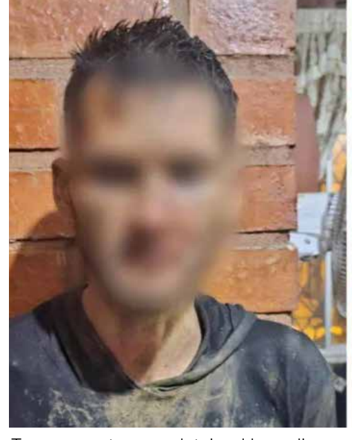
Two suspects were detained by police.

Los Lobos is one of the most powerful gangs in Ecuador with an estimated 8,000 members.