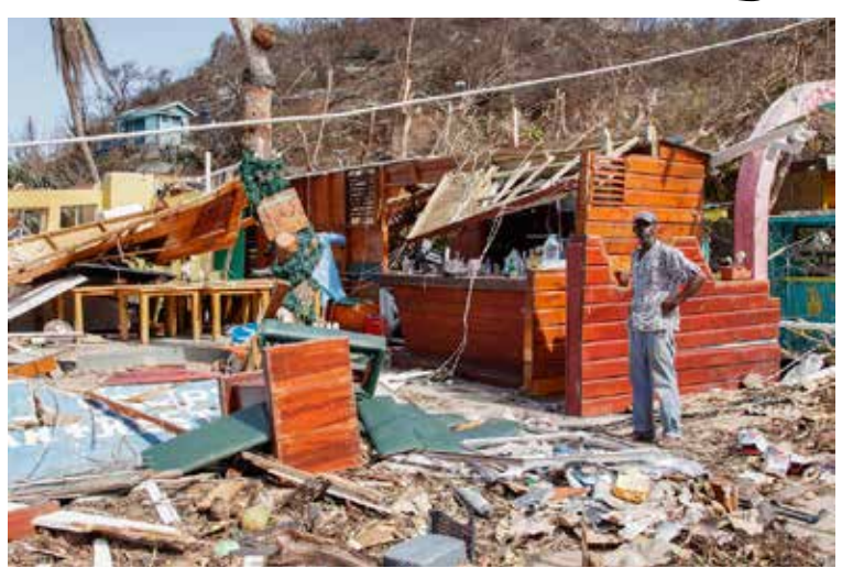
A man stands next to a business destroyed by Hurricane Beryl in Clifton, Union Island, St Vincent and the Grenadines, Thursday, July 4, 2024.

Since Beryl's passage, alot of people have been evacuated from Union Is-