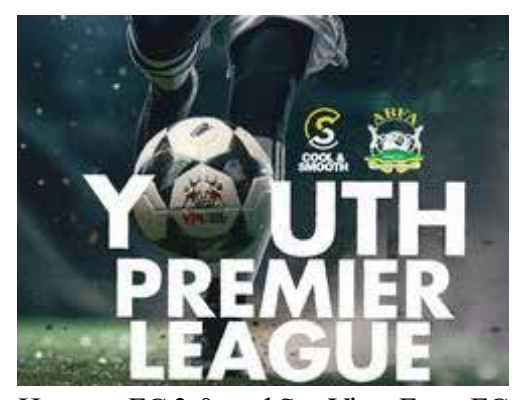
Hoppers FC 3-0, and Sea View Farm FC also recorded a 3-0 win against the CPT-SA Wings FC.

Green City hammered Urlings FC 4-0. Soccer Academy beat Greenbay