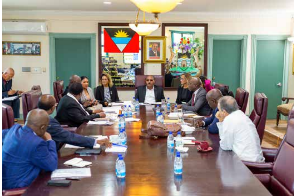
Justice reform participants at Cabinet meeting

“This session has come at an opportune time, as we reflect on the six years of incorporation and implementation of the Child Justice Reform principles into our legislative framework. We can be proud of the work that we have accomplished so far while rec-