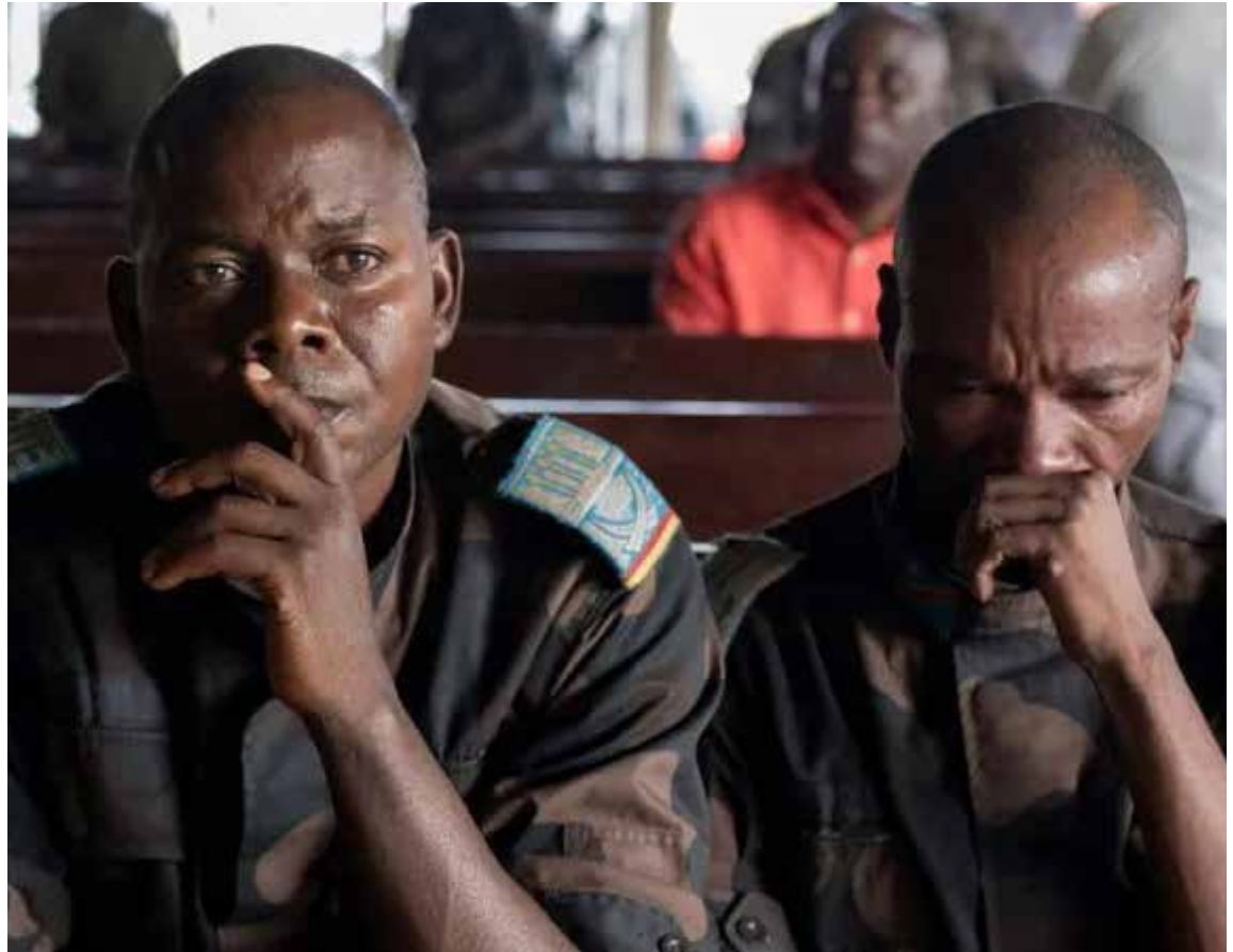
A lawyer for the soldiers says he will appeal against the sentence.

In May a military court in the city of Goma sentenced eight soldiers to death for "desertion" and