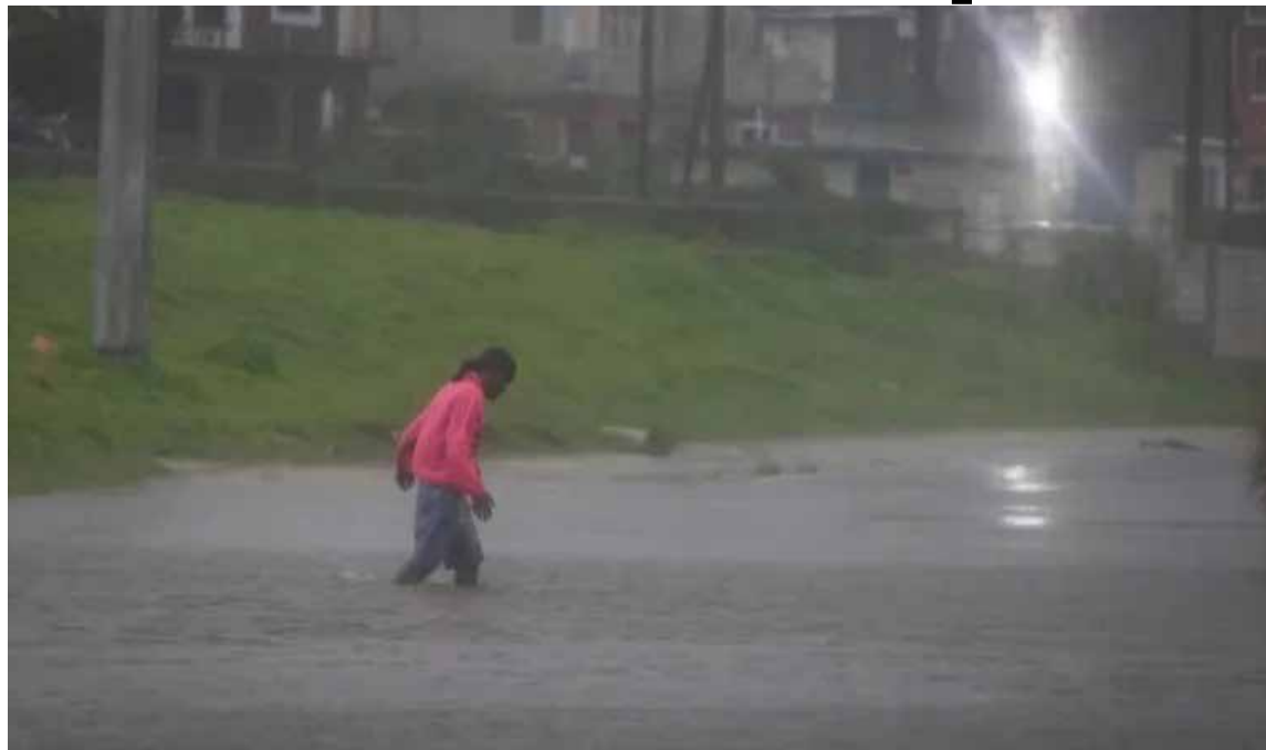
Rain lashed Jamaica for 12 hours.

The hurricane is expected to bring 10cm (4in) to 15cm (6in) of rain into Friday across the peninsula, with some places getting up