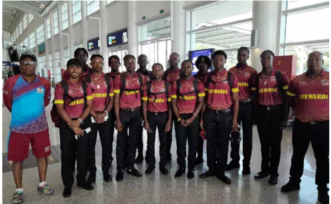
The Leeward Islands Under-19 team at the V.C. Bird International Airport on Sunday, June 30, 2024. (File photo)

participating teams are still awaiting words from Cricket West Indies about the status of the regional youth tournament.