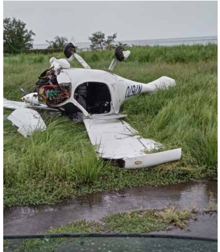
The aftermath of today’s plane crash at the Canefield Airport in Dominica.

Dominica is currently building an international airport on the island’s northeast coast.