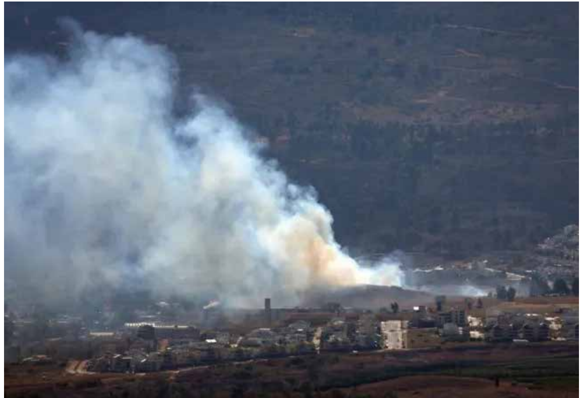
Rockets fired by Hezbollah in response to the strike sparked fires in northern Israel.

Since then, there has been a flurry of diplomatic