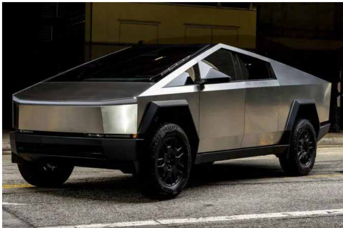
The cyber truck has been selling well, although it is a tiny part of Tesla's business.

At the start of the year, Tesla blamed its poor performance in part on supply shortages due to shipping disruption in the Red Sea and an alleged arson attack