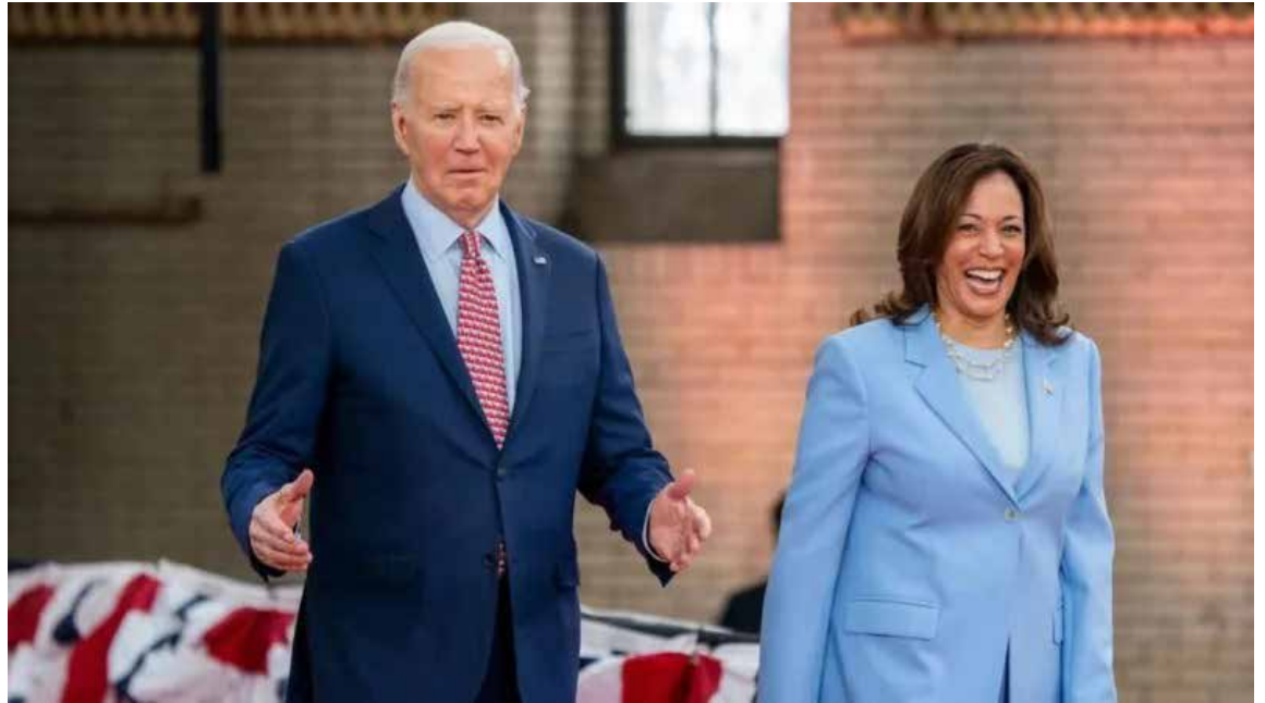
President Biden and Vice-President Harris presented a united front to Democrats on Wednesday (file image)

Questions have been swirling around whether the 81-year-old will continue with his campaign following the debate with Trump, which was marked by verbal blanks, a weak voice and some difficulty to follow an-