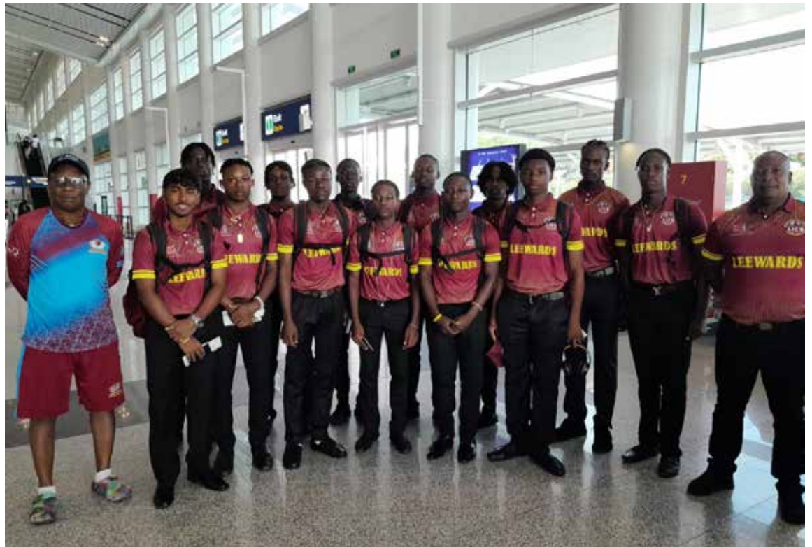
The Leeward Islands Under-19 team at the V.C. Bird International Airport on Sunday, June 30, 2024.

Trinidad and Tobago's Under-19 men's team were set to depart their shores for St. Vincent on Sunday. How-