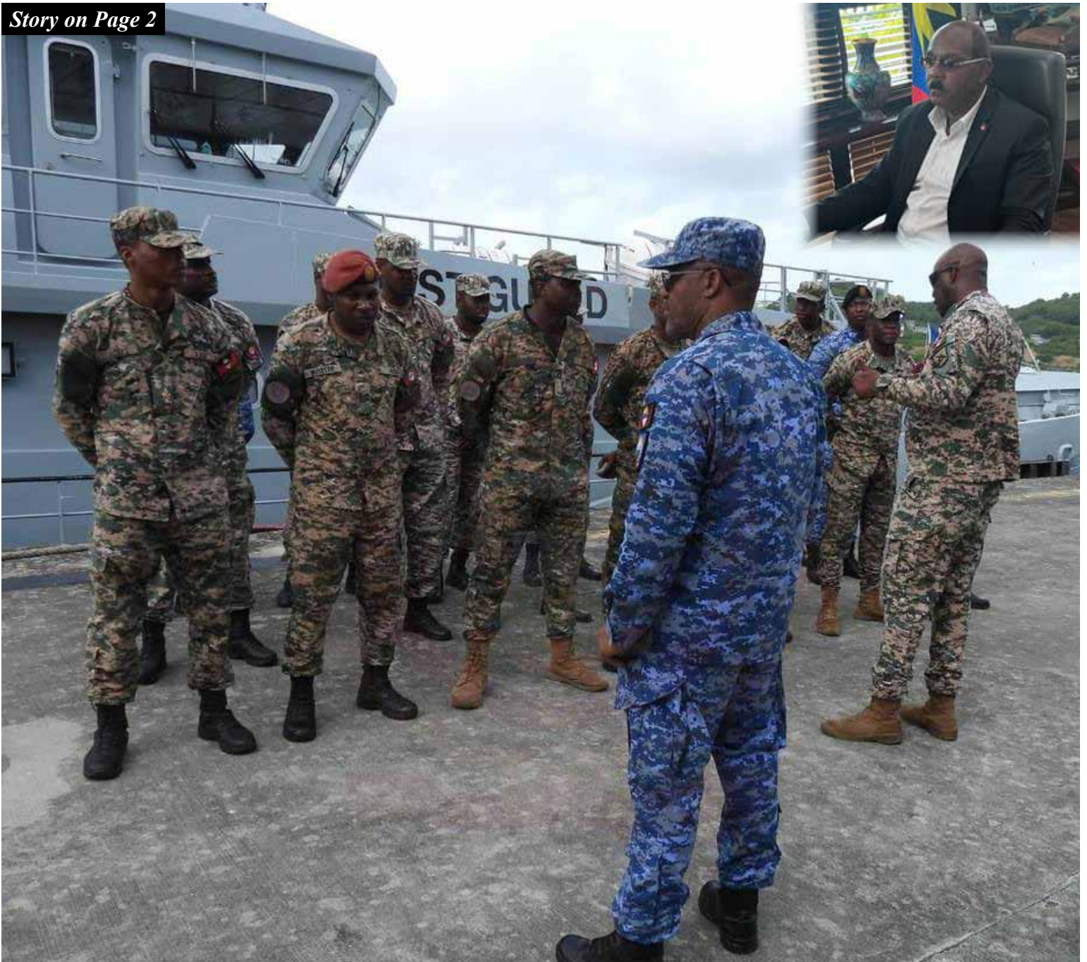
ABDF personnel moments before departure for St. Vincent and the Grenadines and Grenada. (Inset top right) Prime Minister Gaston Browne helping to coordinate relief efforts for the hurricane-stricken countries.