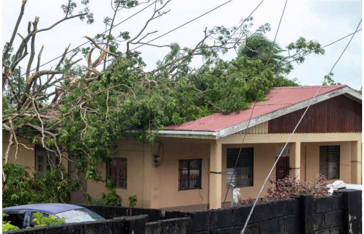
A tree lies on the roof of a house in Kingstown, St. Vincent and the Grenadines, after Hurricane Beryl on Monday, July 1, 2024.

Mohamed Irfaan Ali, who is the outgoing chairman of CARICOM, has plans to send an aircraft full of relief supplies to both nations.