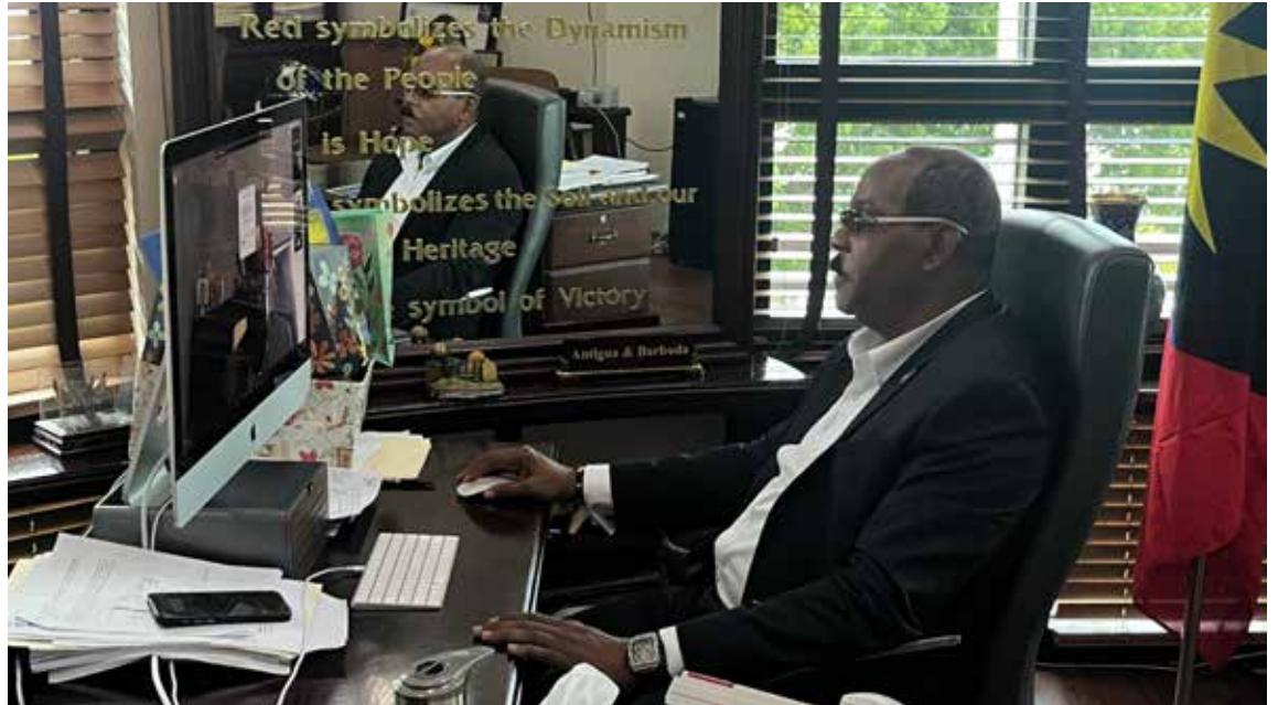
Prime Minister Gaston Browne during a ZOOM meeting of CARICOM leaders.

The prime minister added that he was very