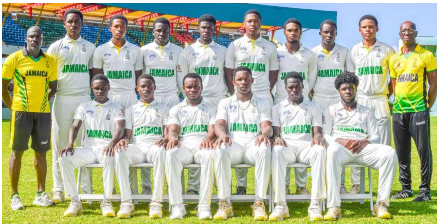
The Jamaica team that won the 2023 CWI Men's Under-19 Rising Stars championship. (File photo)

All Saints United are currently in the cellar of the six-team Group A standings with one point from three matches.