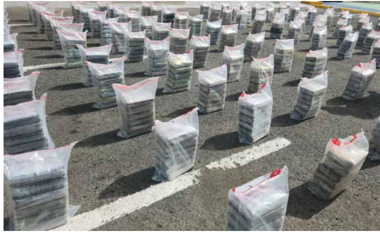
1032 packages of cocaine discovered in the Dominican Republic.

“After more than 15 hours of intense chase,” the authorities stated, “the acting