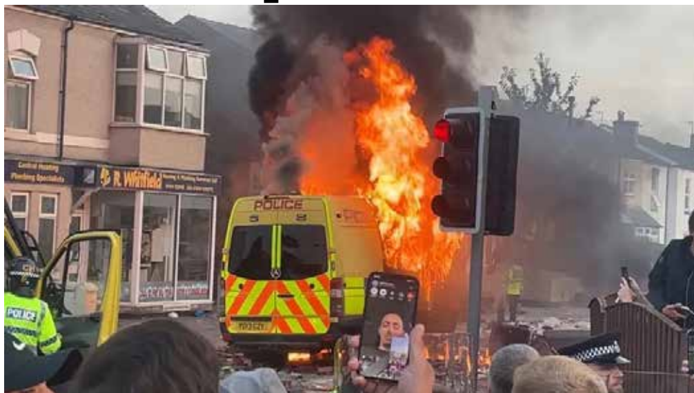
Merseyside Police said bottles and wheelie bins were thrown at officers.

lance resources will remain at the scene on St Luke's Road and will continue to support the police.