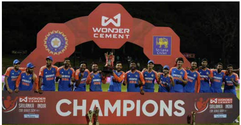
Members of the Indian team pose with winners' trophy after defeating Sri Lanka in a three-match Twenty20 series in Pallekele, Sri Lanka, Tuesday, July 30, 2024.

the toss, a much-changed India lost half their side for 48 runs inside nine overs as Maheesh Theekshana claimed two wickets to spark the collapse but Shubman Gill steadied the ship with a patient 39.