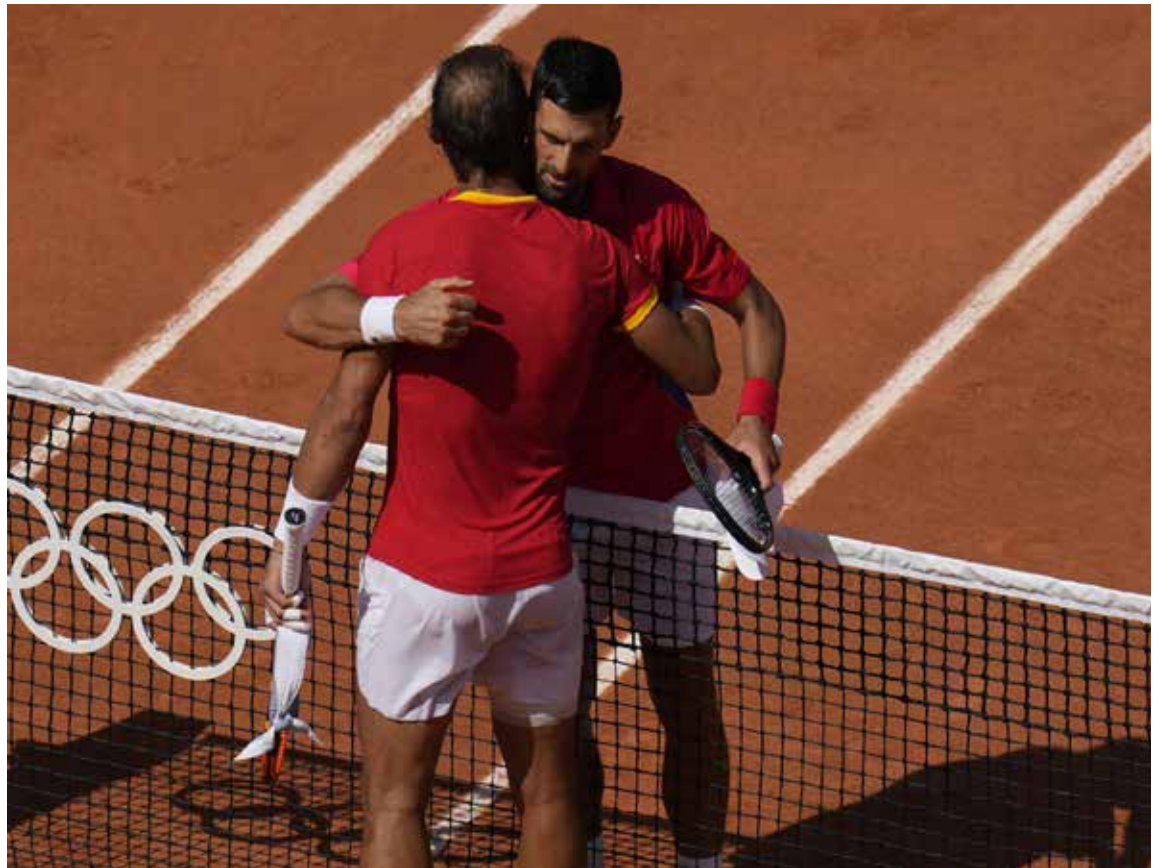
Serbia's Novak Djokovic, right, hugs Spain's Rafael Nadal after their men's singles second round match at the Roland Garros stadium at the 2024 Summer Olympics in Paris, France, Monday, July 29, 2024.

Men moving into the third round included Carlos Alcaraz, who is scheduled to team with Nadal in doubles for Spain on Tuesday and defeated Tallon Griekspoor of the Netherlands