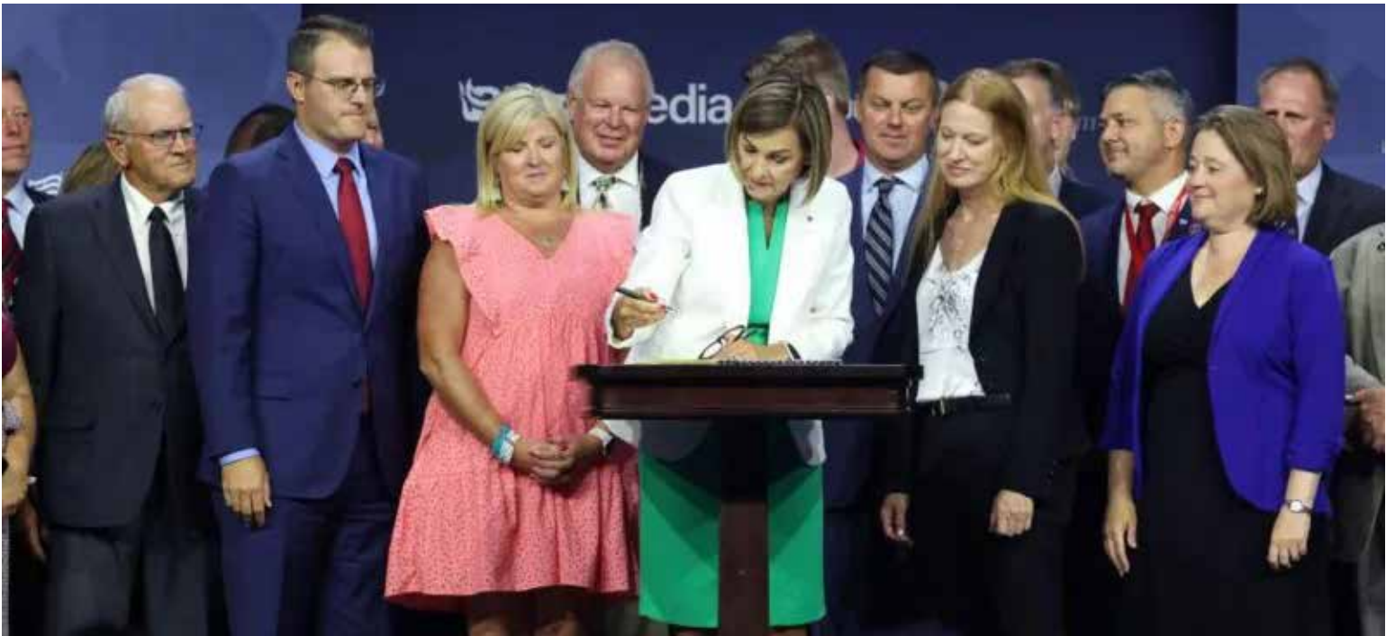
The state's Republican-controlled legislature approved the ban last year.