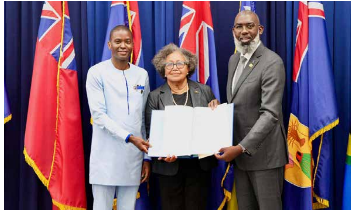
Welcome Curaçao: (L-R) Prime Minister of Grenada, CARICOM Chairman Dickon Mitchell; CARICOM Secretary-General Carla Barnett and Prime Minister of Curaçao, Gilmar Pisas at the 47th Regular Meeting of the Conference of Heads of Government of the Caribbean Community in Grenada.

"By joining CARICOM, we affirm our commitment to work together in the interest of the collective values and aspiration that binds all of us as small island develop-