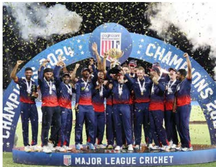
Washington Freedom players pose after their maiden Major League Cricket title win at the Grand Prairie Stadium in Dallas, Texas, July 29, 2024.