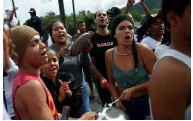
Many people have been banging pots and pans.

Opinion polls ahead of the election suggested a clear victory for the challenger.