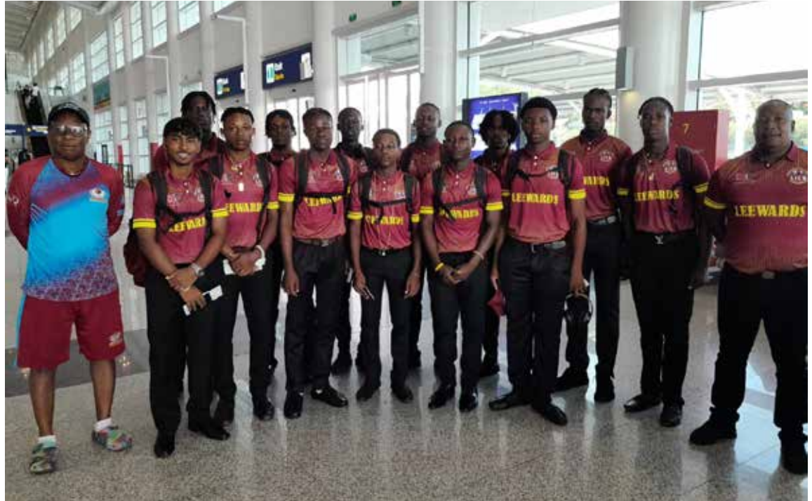
The Leeward Islands Under-19 team. (File photo)

Palmer hit a top score of 74 off 67 balls, with eight