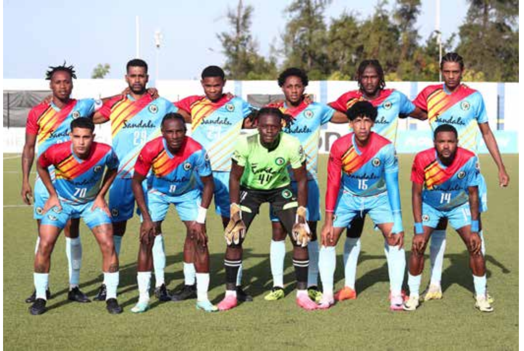
The Sandals and Inet Jennings Grenades FC starting XI against SV Real Rincon of Bonaire in the 2024 Caribbean Football Union Club Shield Championship at the Stadion Rignaal Jean Francisca in Willemstad, Curaçao, on Sunday, July 28.