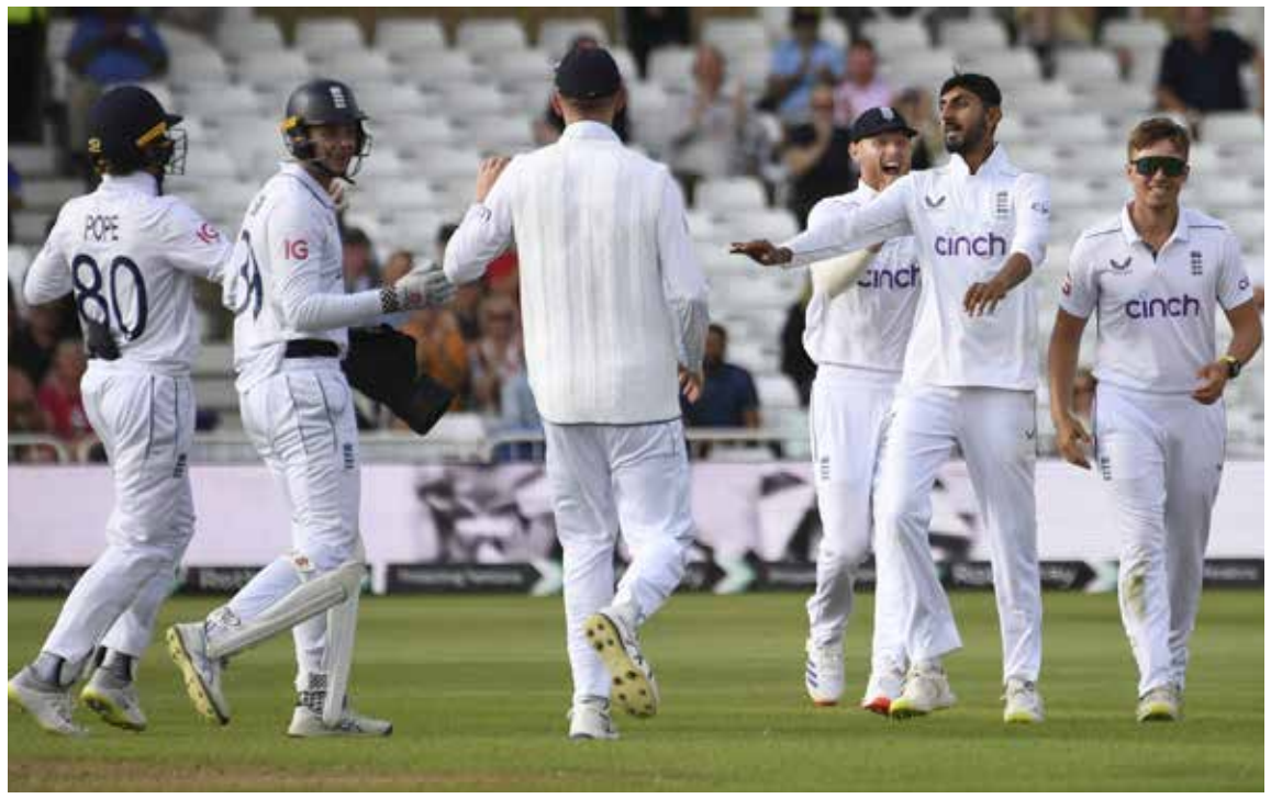
England's Shoaib Bashir, second right, celebrates with teammates after dismissing after West Indies' Jason Holder during day four of the second Test between England and the West Indies at Trent Bridge cricket ground, Nottingham, England, Sunday, July 21, 2024.

Wood's return to the team at Trent Bridge saw him send down a barrage of 90mph-plus deliveries, including bowling the fastest over recorded in England since records began being