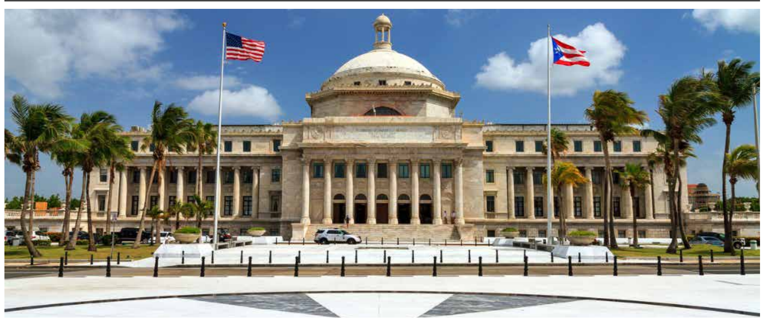
The Capitol of Puerto Rico in San Juan.