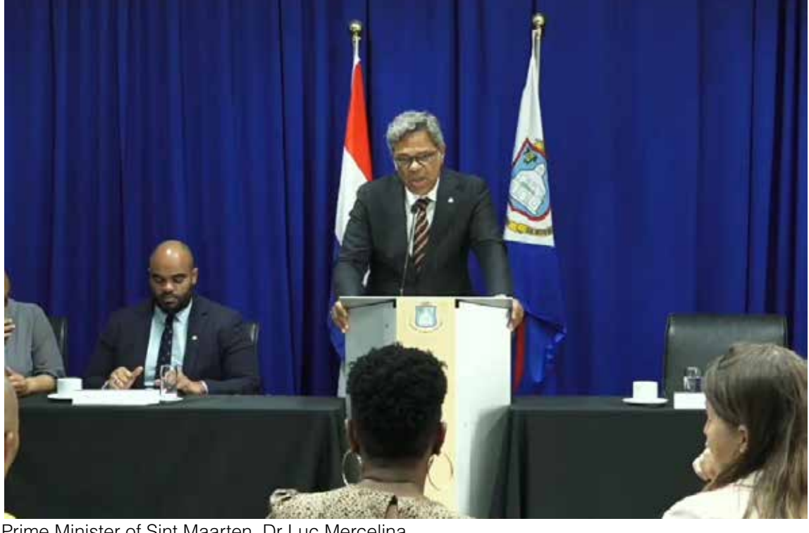
Prime Minister of Sint Maarten, Dr Luc Mercelina.

The security enhancements come after recent gun crimes, the most shocking, the July 17 shooting that left Oualichi Movement for