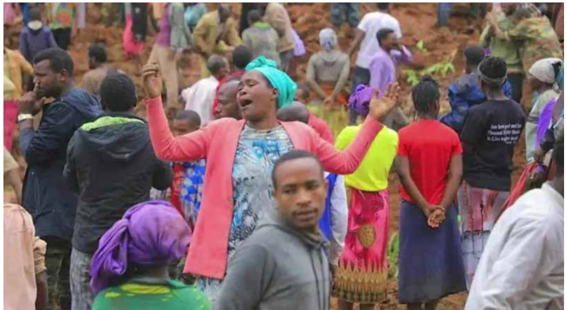
Footage showed hundreds of people gathered at the scene. In the background, a hillside can be seen partially collapsed and a large patch of red earth has been exposed.

Footage showed hundreds of people gathered at the scene and others digging in the dirt in search of people