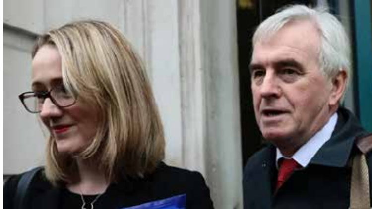
Former shadow ministers Rebecca Long-Bailey and John McDonnell, who served on Jeremy Corbyn's front bench, were among the seven voting against the government.

"disappointed" by the decision to suspend him, explaining that "many struggling families" in his Leeds East constituency had raised the cap with him.