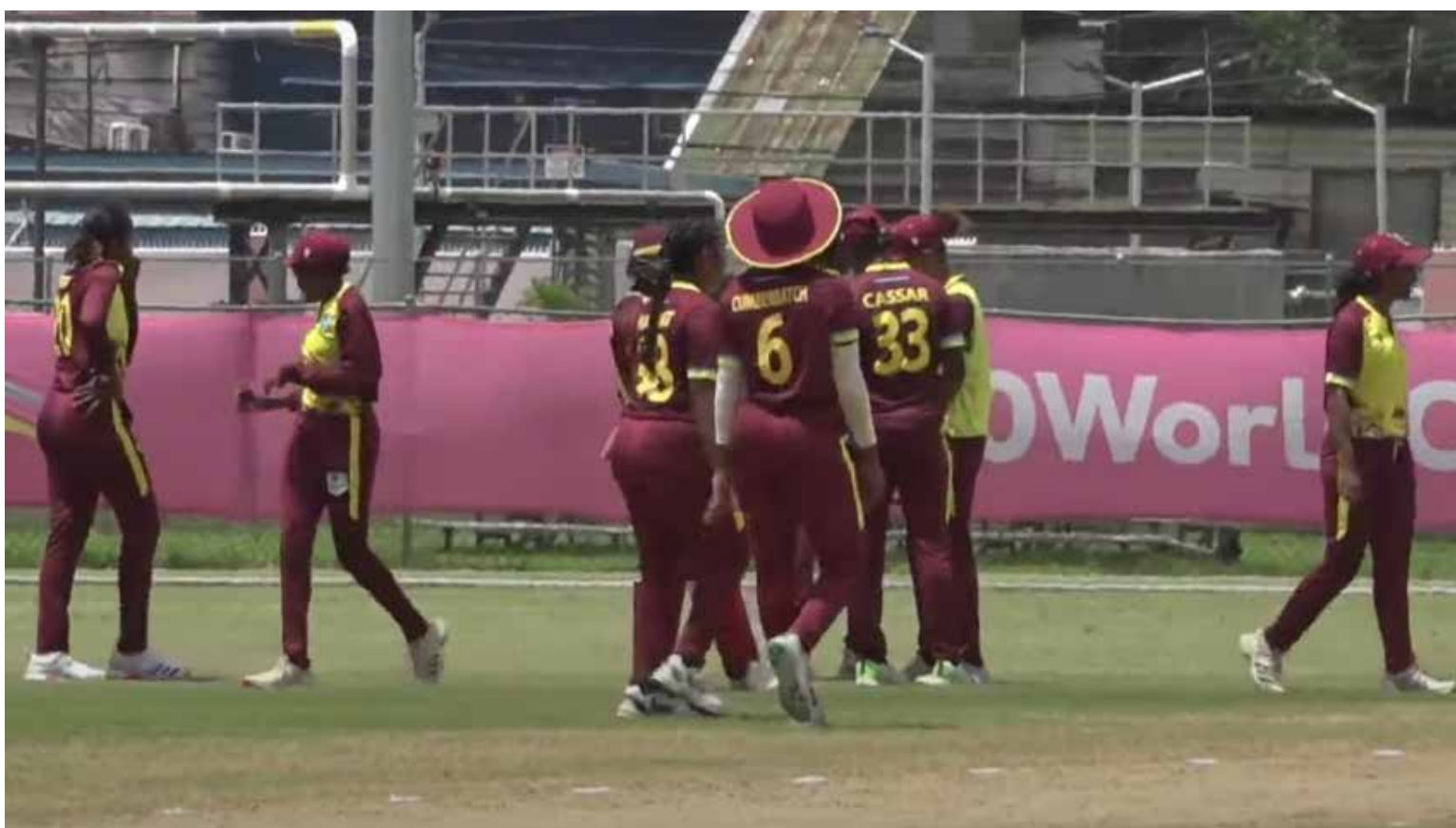
Players of the West Indies Under-19 women's team in Trinidad and Tobago.