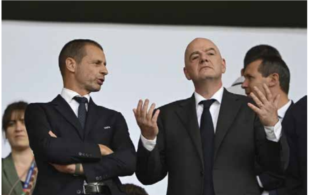
UEFA President Aleksander Ceferin, left, talks to FIFA President Gianni Infantino, right, before a round of sixteen match between Switzerland and Italy at the Euro 2024 soccer tournament in Berlin, Germany, Saturday, June 29, 2024.

“FIFA’s decisions over the last years have repeatedly favored its own competitions and commercial interests, neglected its responsibilities as a governing body, and harmed the economic interests of national leagues and the welfare of players,” European Leagues and FIFPRO Eu-