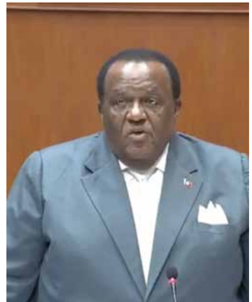
Attorney General, Sir Steadroy Benjamin "To investigate any complaint relating to any decision or recommendation made or any act done or omitted by any officer of Government or Statutory Body in any case in which a member of the Public claims to be aggrieved, or appears to the Ombudsman to have sustained injustice as a result of the exercise of administrative function of that officer or body".

The Office of the Ombudsman, established in June, 1995, is enshrined in the Constitution of Antigua and Barbuda, 1981 and Ombudsman Act, 1994 No. 5 of 1994. Its functions are