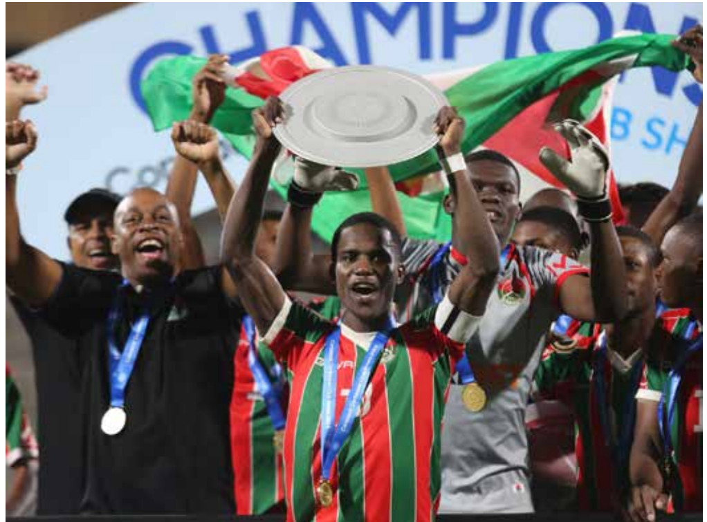
SV Robinhood celebrate with the Club Shield after winning the competition in 2023.

In addition to the defending champs SV Robinhood, the contenders are: America FC (Haiti); Arnett Gardens FC (Jamaica); AS Étoile De Matoury (French Guiana); AS Junior Stars (Sint Martin); B.A.Y.S FC (St. Lucia); CCCUL Dublanc FC (Dominica); Club Atlético Pantoja (Dominican Republic); CRKSV Jong Holland (Curaçao); Defence Force FC (Trinidad and Tobago); Jennings Grenades FC (Antigua and Barbuda); Guyana Defence Force FC (Guyana); Metropolitan FC (Puerto Rico); Paradise FC International (Grenada); RAMS Village Superstars FC (St. Kitts and Nevis); Scholars International SC (Cayman Islands); SCSA Eagles (St. Maarten); SV Racing Club Aruba (Aruba); SV Real Rincon (Bonaire); and SWA Sharks FC (Turks and Caicos Islands).