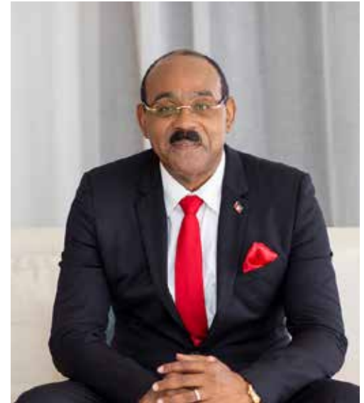
Prime Minister Gaston Browne various areas earmarked for commercial developments such as a restaurant, a supermarket, a laundry as well as various types of accommodation, from short-term to medium to long-term.

The development will involve a beach park, resuscitating the beach,