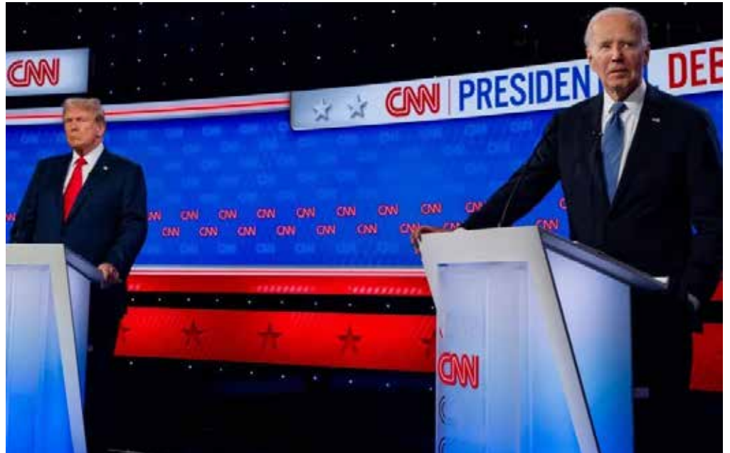
Biden and Trump at the 27 June debate.

Sources told the BBC that even senior White House staff and cam-