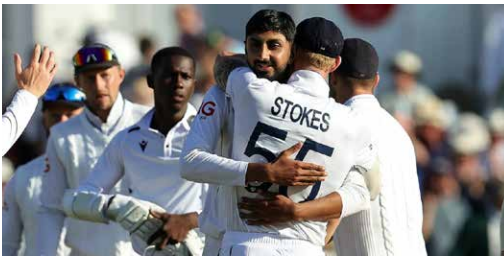
England's captain Ben Stokes embraces Shoaib Bashir after beating the West Indies on the fourth day of the Second Cricket Test at Trent Bridge in Nottingham, England, Sunday, Jul 21, 2024.

Woakes fell for 12 and Root's innings ended when he drove Holder