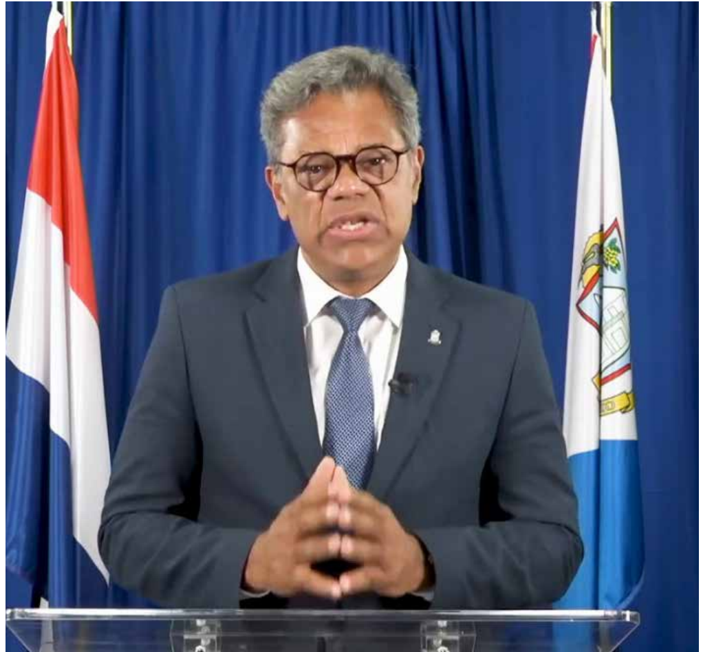
Prime Minister of Sint Maarten, Dr Luc Mercelina.