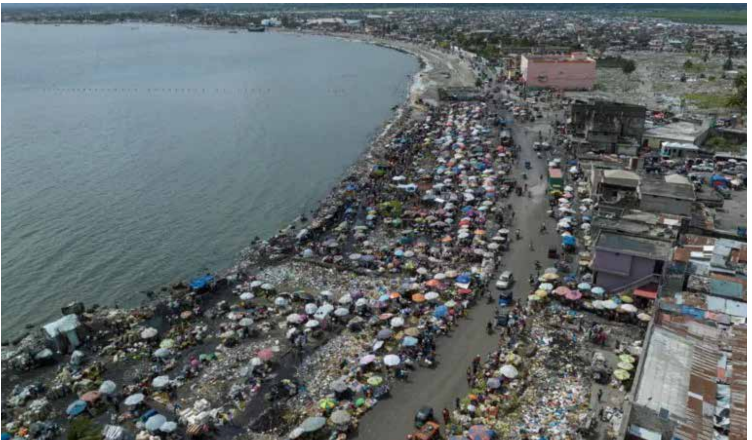
The vessel was travelling from Cap-Haitien.