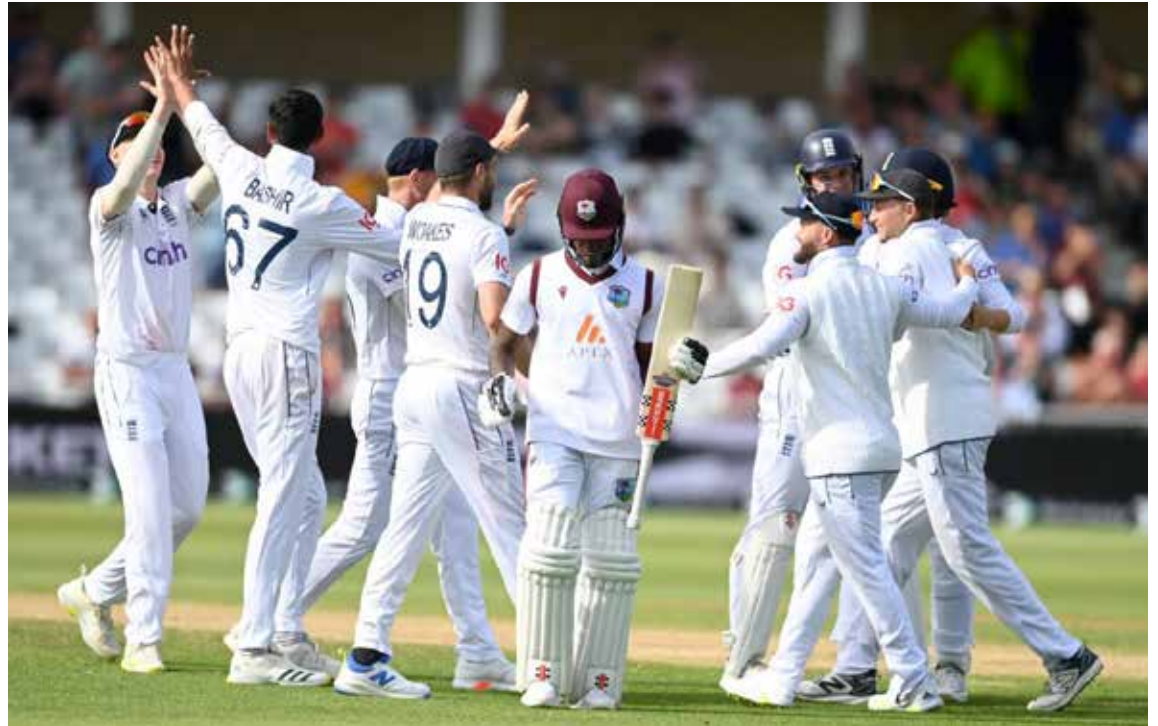
The Players of the England team celebrate after Shoaib Bashir dismissed West Indies batsman Alick Athanaze, center, on the fourth day of the Second Cricket Test at Trent Bridge in Nottingham, England, Sunday, Jul 21, 2024.

last long, skying a catch off his wrist to Zak Crawley in the slips off Mark Wood, and Gus Atkinson trapped Joshua Da Silva lbw for 14.