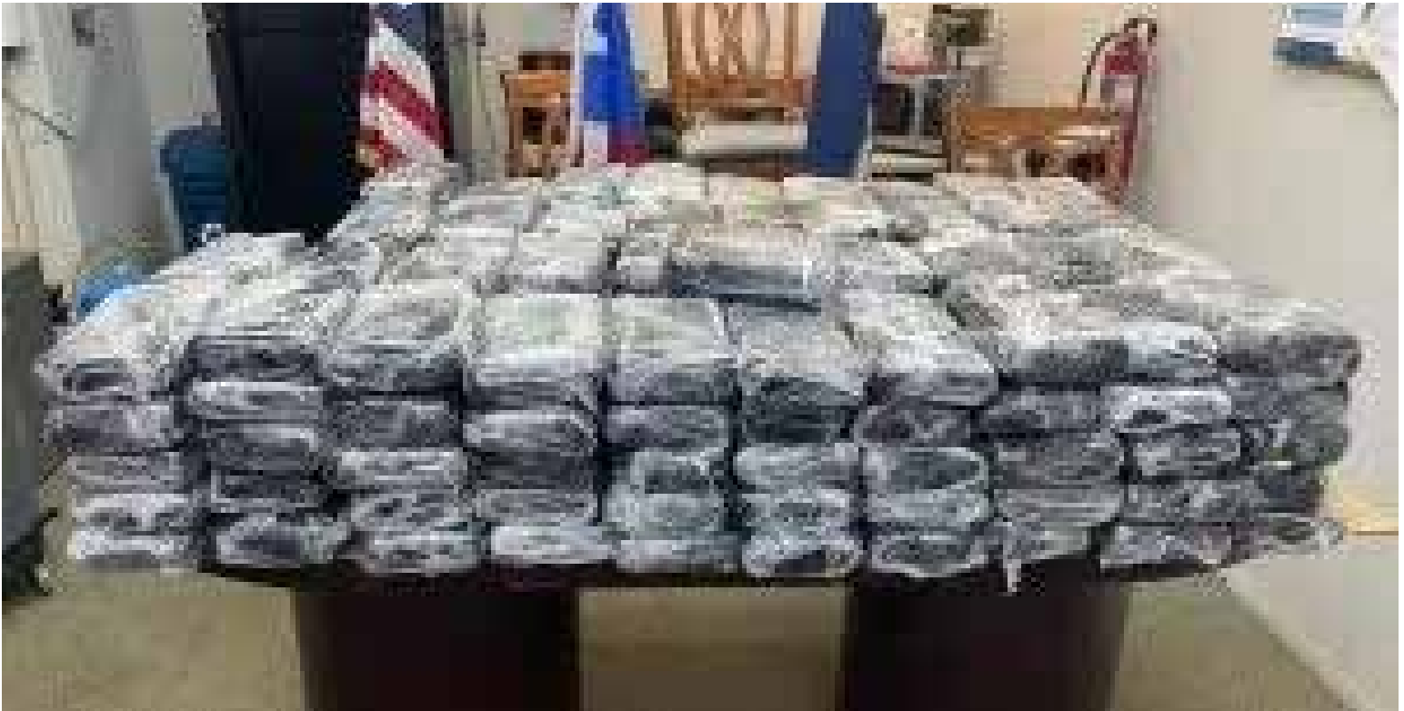
511 pounds of cocaine seized in Caribbean sea.