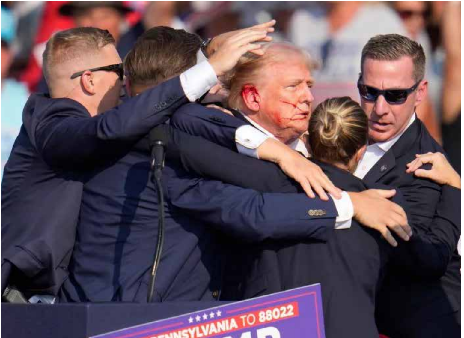
Antigua and Barbuda Prime Minister, Gaston Browne, has condemned the attack on former US President Donald Trump by a person who was subsequently killed by the US Secret Service. Story on page 3