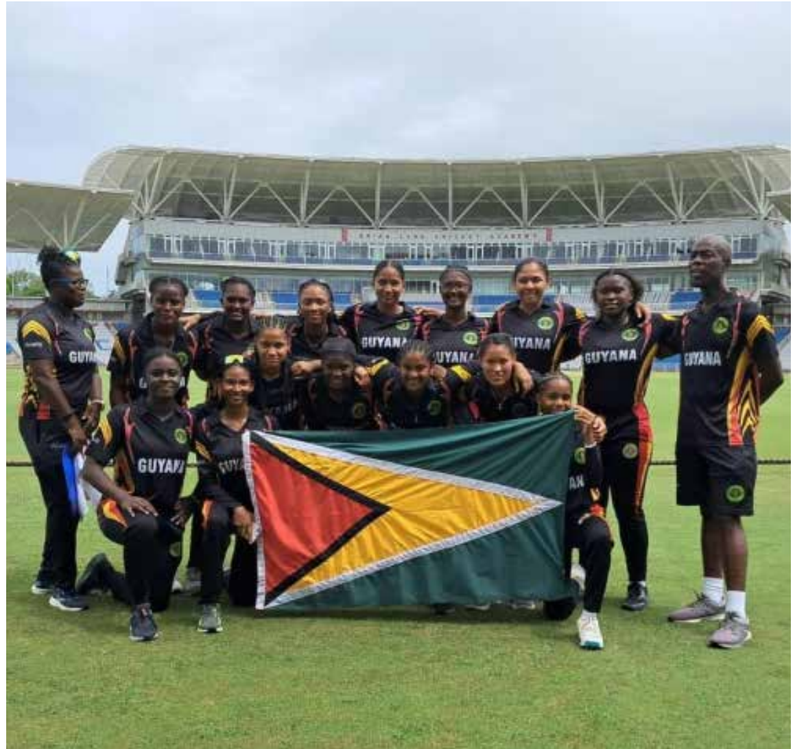
The Guyana Under-19 women's team that won the Cricket West Indies (CWI) Rising Stars Under-19 Women's T20 Championship in Trinidad and Tobago on Saturday.

The Leewards advanced to the final after