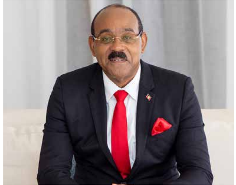
Prime Minister Gaston Browne sent a personal message of good will to Donald Trump, wishing him a speedy recovery,” the Prime Minister said.