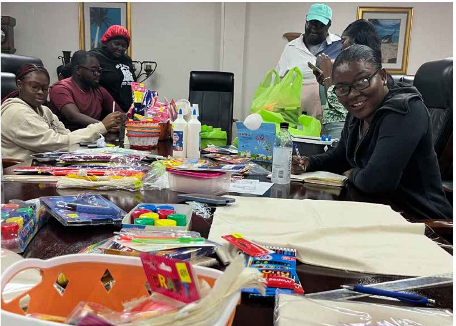
Volunteers for the City West Summer camp preparing the supplies for the camp attendees,