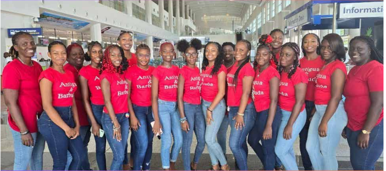
The Antigua and Barbuda national Under-21 netball team that participated in the Americas Region Qualifiers in Guadeloupe from July 7-15, 2024.