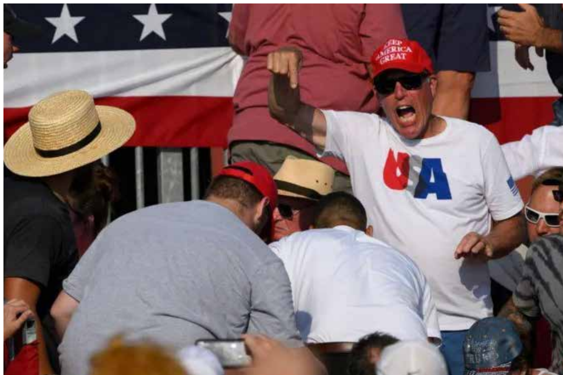
The crowd reacts after shots rang out at a Donald Trump rally Saturday.