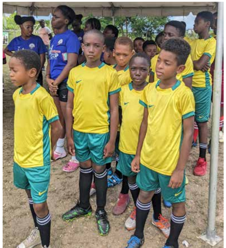
Lion Hill Cubs won the Under-10 Division