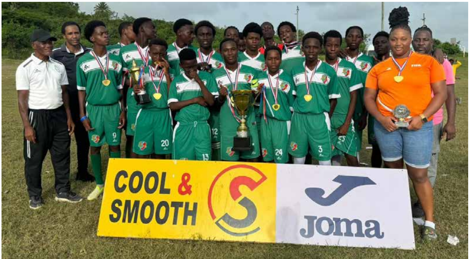
Hot Springs Bath United of Nevis