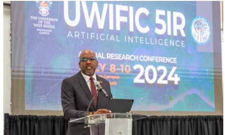
Minister of Education, Daryll Matthew

our people with the skills and knowledge they need to navigate the complexities of the digital age. It is about ensuring that the benefits of AI and the 5th Industrial Revolution are accessible to all, and that no one is left behind. This conference is an important step in that direction, and we are committed to supporting and advancing these efforts," he observed.