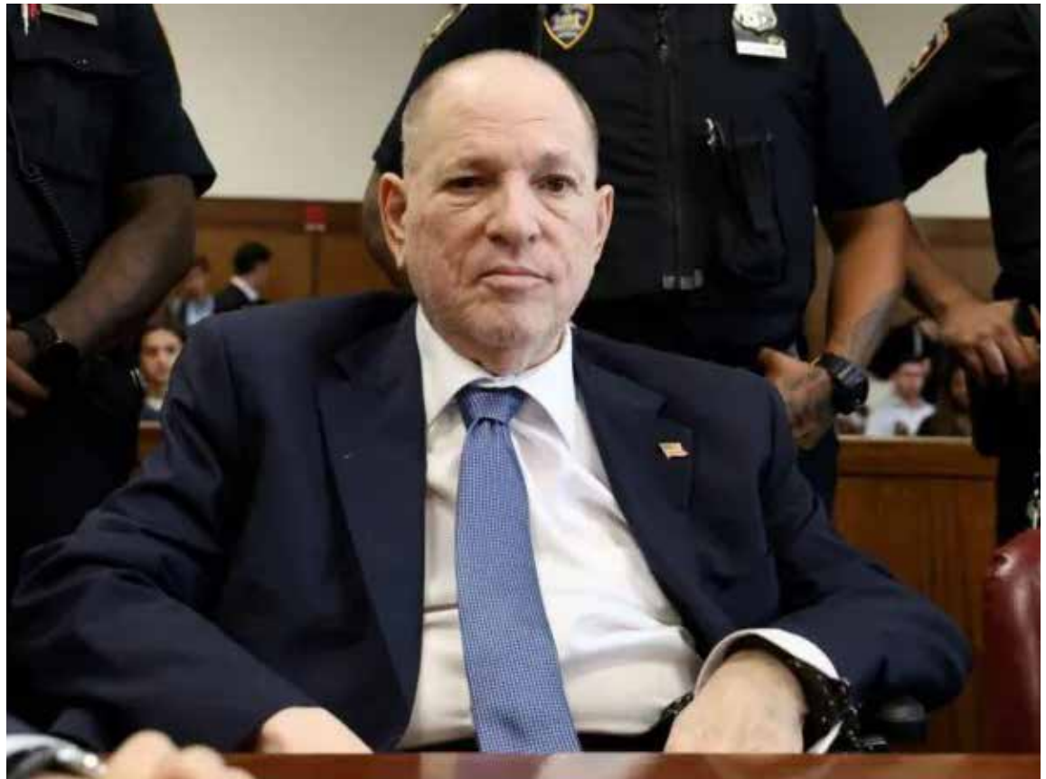
Harvey Weinstein in court on Tuesday.