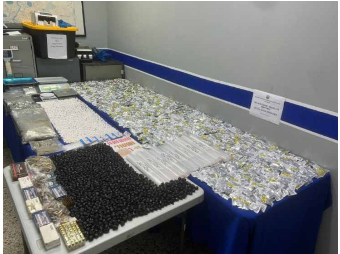
46,000 grams of various narcotics seized in the Dominican Republic.

Two suspects were arrested during the operation: