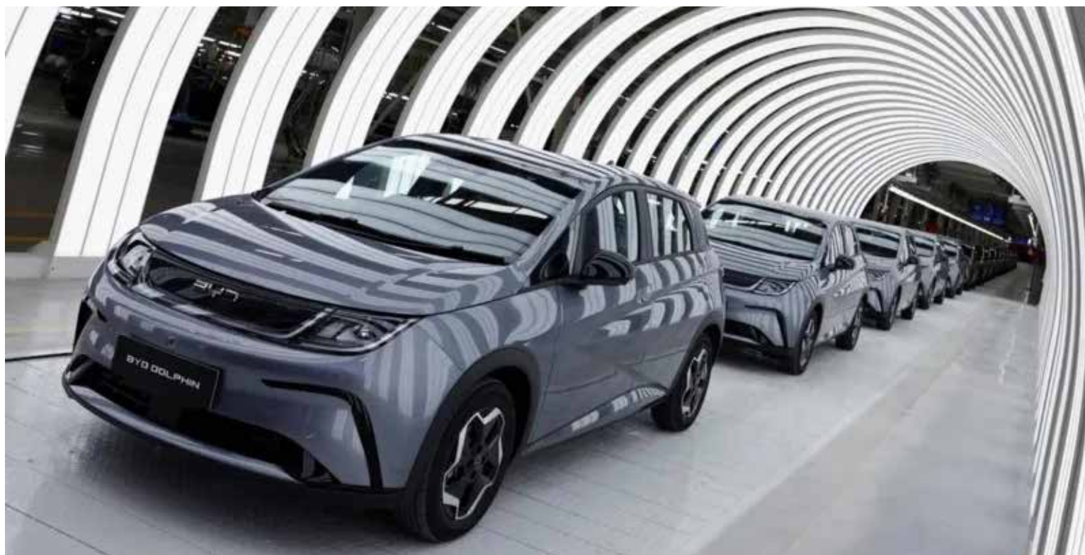
BYD's plant in Thailand is part of its expansion outside China.