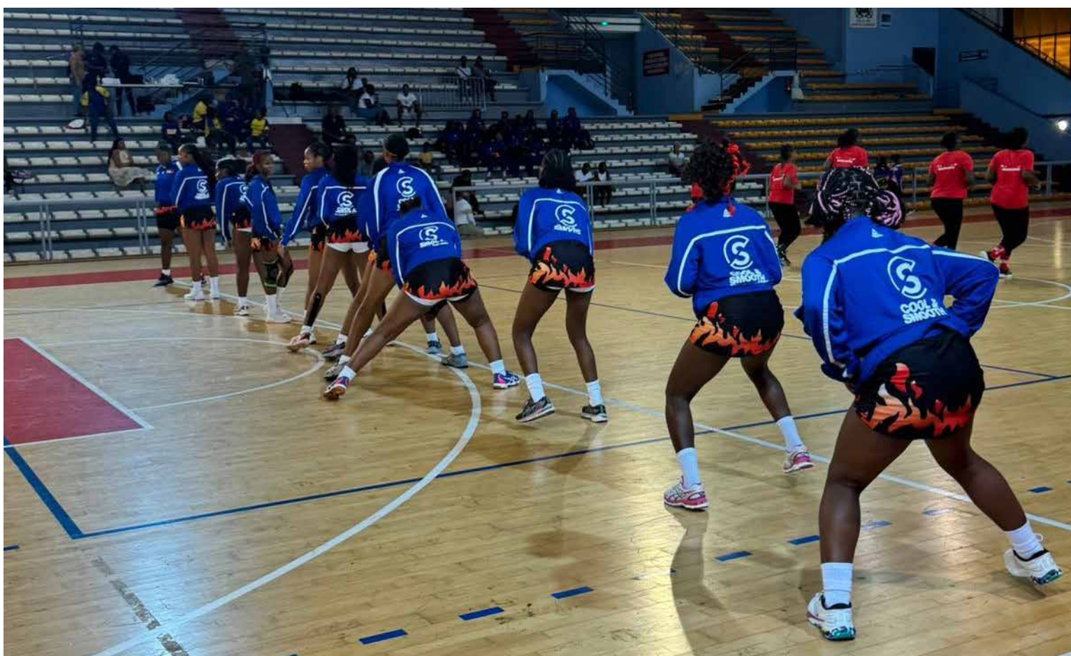
The Antigua and Barbuda national Under-21 netball team participate in warm-up exercises ahead of their opening game in the Americas Region Qualifiers in Guadeloupe on Monday, July 8, 2024.