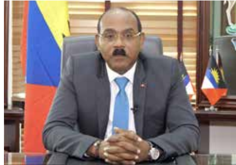
Prime Minister Gaston Browne and Barbuda and wished him the best as he takes up his new post in Montserrat on 1st September.