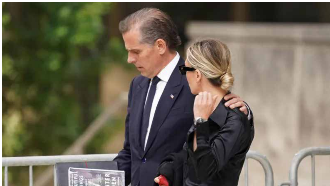
Hunter Biden (seen with his wife Melissa Cohen Biden) could face up to 25 years in prison if found guilty on all counts.