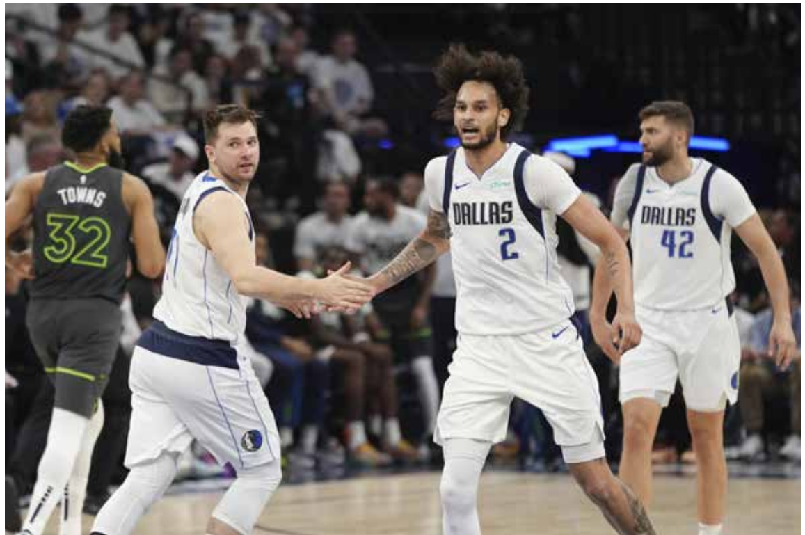
Dallas Mavericks center Dereck Lively II (2) slaps hands with Mavericks guard Luka Doncic, second from left, after Doncic's score against the Minnesota Timberwolves during the first half of Game 5 of the Western Conference finals in the NBA basketball playoffs in Minneapolis, Thursday, May 30, 2024.

Anything less will be seen as a bitter disappointment. "They were the best