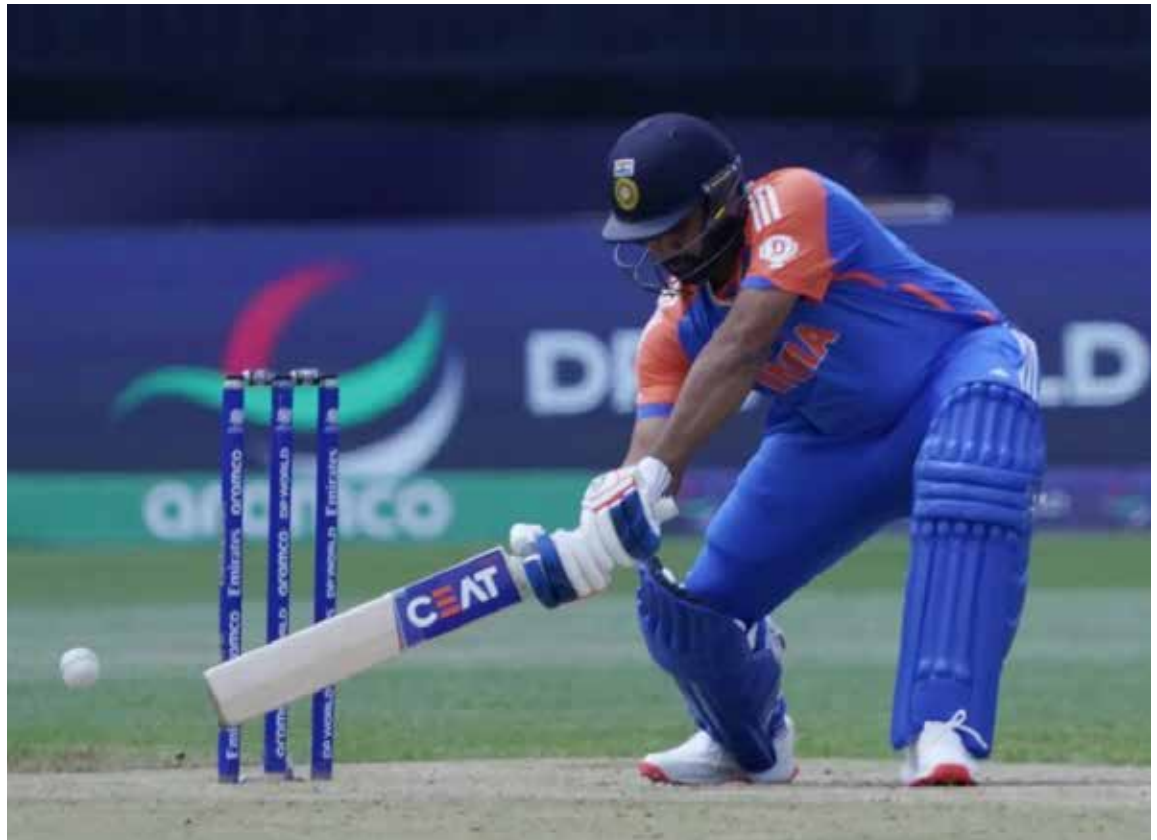
India's captain Rohit Sharma plays a shot against Ireland during an ICC Men's T20 World Cup cricket match at the Nassau County International Cricket Stadium in Westbury, New York, Wednesday, June 5, 2024.

Pandya came in at first change and struck immedi-