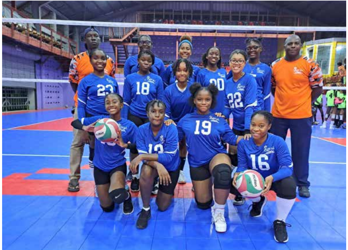
The Royal Cruisers 2 female volleyball team. (ABAVA)

and 40 minutes to beat Print Xpress Renegades 3-1, winning 25-19, 18-25, 27-25, and 25-13. The Renegades lost for the fifth time in 13 games.