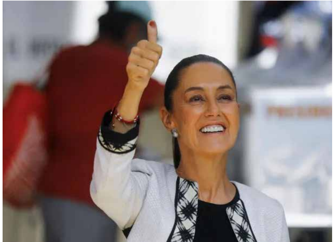
Claudia Sheinbaum will be Mexico's first female president.

She said it was an achievement not just for