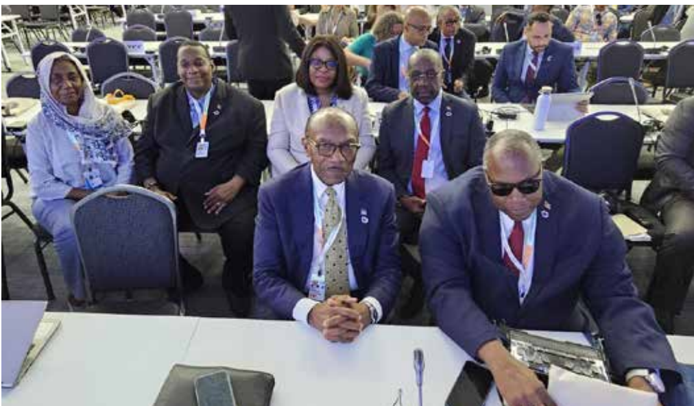
Members of the Antigua and Barbuda delegation in Plenary Hall at SIDS4