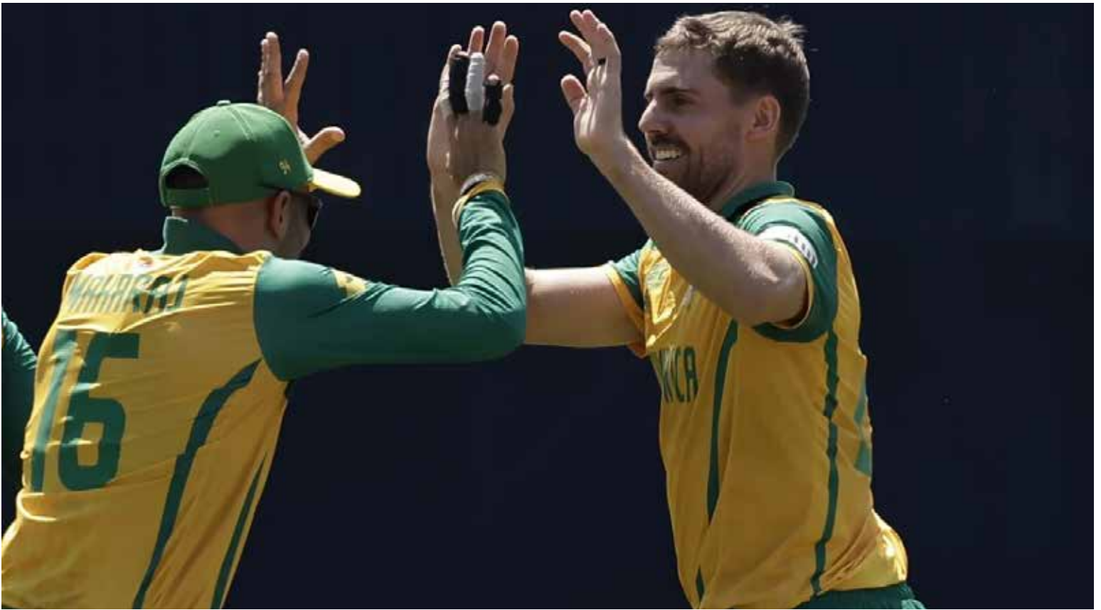
South Africa's Anrich Nortje, right, celebrates with teammate Keshav Maharaj after the dismissal of Sri Lanka's Charith Asalanka during the ICC Men's T20 World Cup cricket match between South Africa and Sri Lanka at the Nassau County International Cricket Stadium in Westbury, New York, Monday, June 3, 2024.