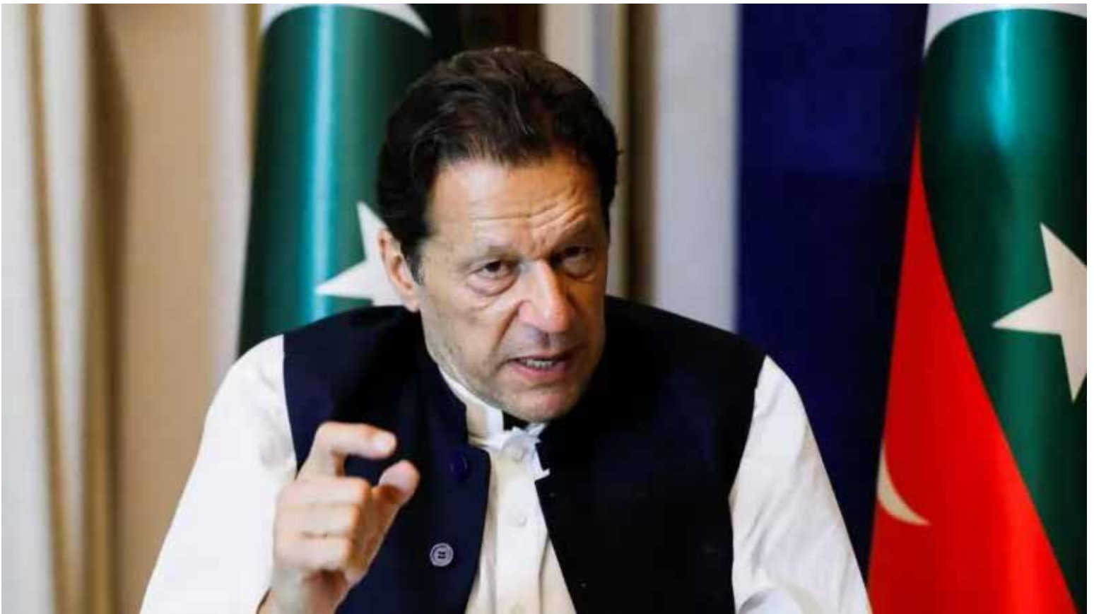
Imran Khan was prime minister between 2018 and 2022.