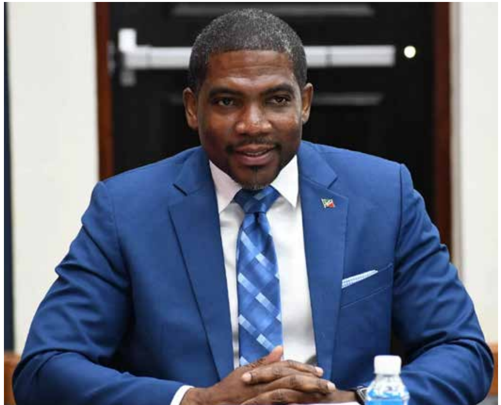
St Kitts and Nevis Prime Minister Dr Terrance Drew

The region can expect to see between 17 and 25 named storms, with winds of 39 mph or higher, develop. Of those storms, between four and seven are expected to become major hurricanes.