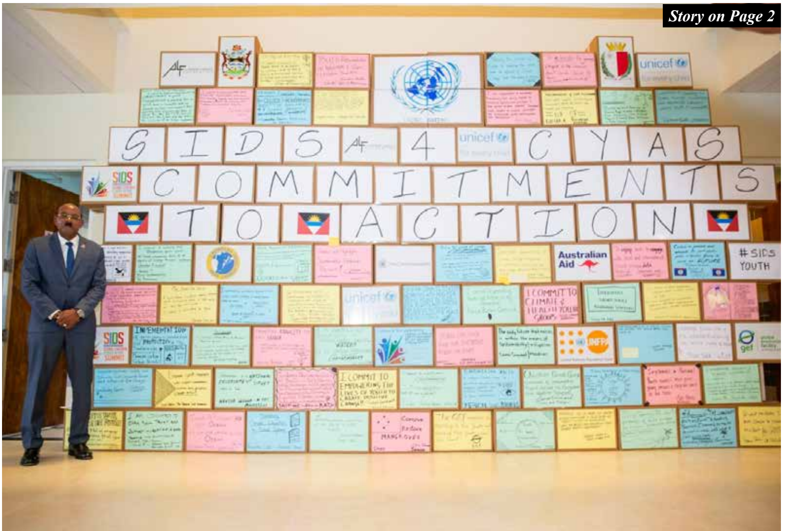
Story on Page 2