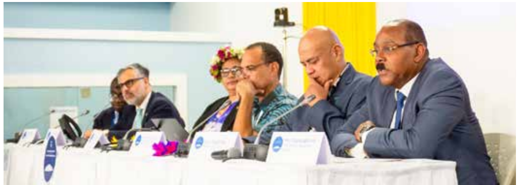
PM Gaston Browne at one of the many SIDS4 engagements

airport staff, protocol officers, police force, public servants, medical officers, hotel staff, and every citizen played a pivotal role.