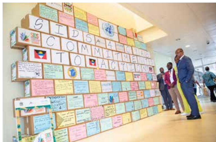
PM Gaston Browne joined youth leaders at Activity Wall during SIDS4

Therefore, with a heart filled with immense gratitude and boundless pride, I thank