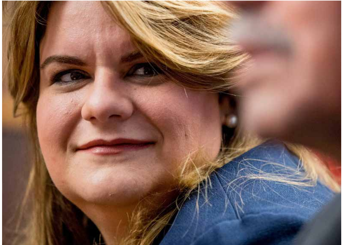
Resident Commissioner Jenniffer Gonzalez-Colon, who represents Puerto Rico as a nonvoting member of Congress, smiles at a news conference about Puerto Rico statehood on Capitol Hill in Washington, October 29, 2019.

González obtained 56 per cent of the vote compared with Pierluisi's 44