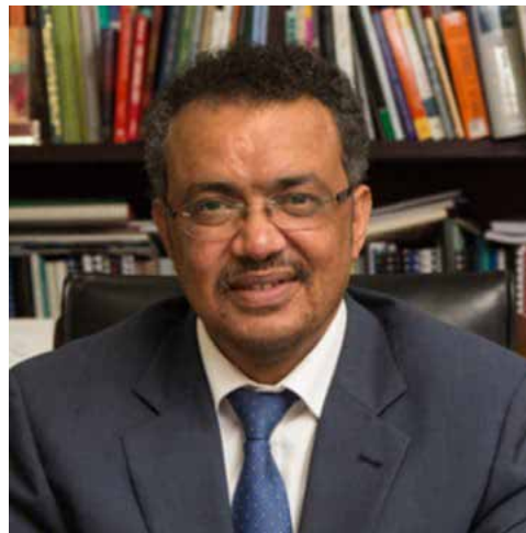
Director General of the World Health Organization, Tedros Adhanom Ghebreyesus

The landmark Bridgetown Declaration on NCDs and Mental Health, adopted by SIDS in June 2023, showcased the feasibility of SIDS-specific actions, evidence-based commitments and accountability mechanisms to overcome the multifaceted challenges