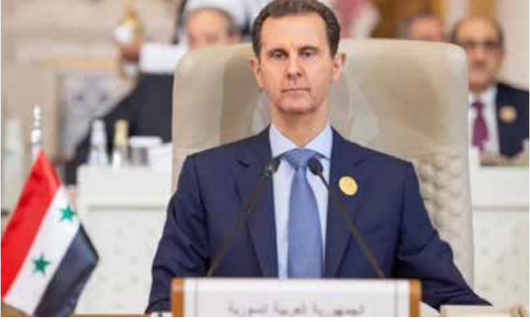
President Bashar al-Assad has denied Syrian government forces were involved in the 2013 chemical attack.

The conflict has left half a million people dead and caused half the population to flee their homes, including almost six million refugees