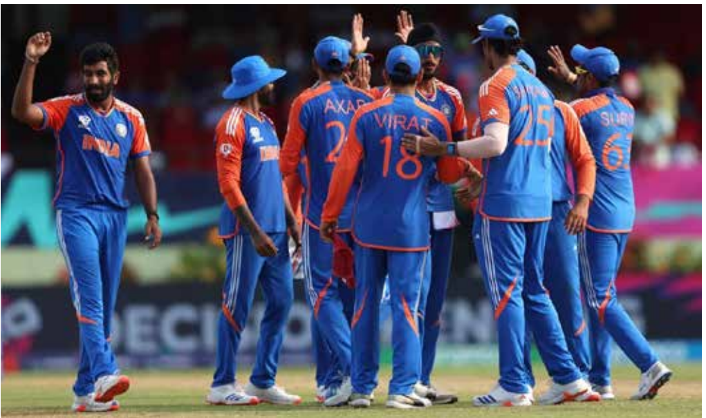
India's players celebrate their entry into the ICC Men's T20 World Cup final after beating England in the semifinal cricket match at the Guyana National Stadium in Providence, Guyana, Thursday, June 27, 2024.