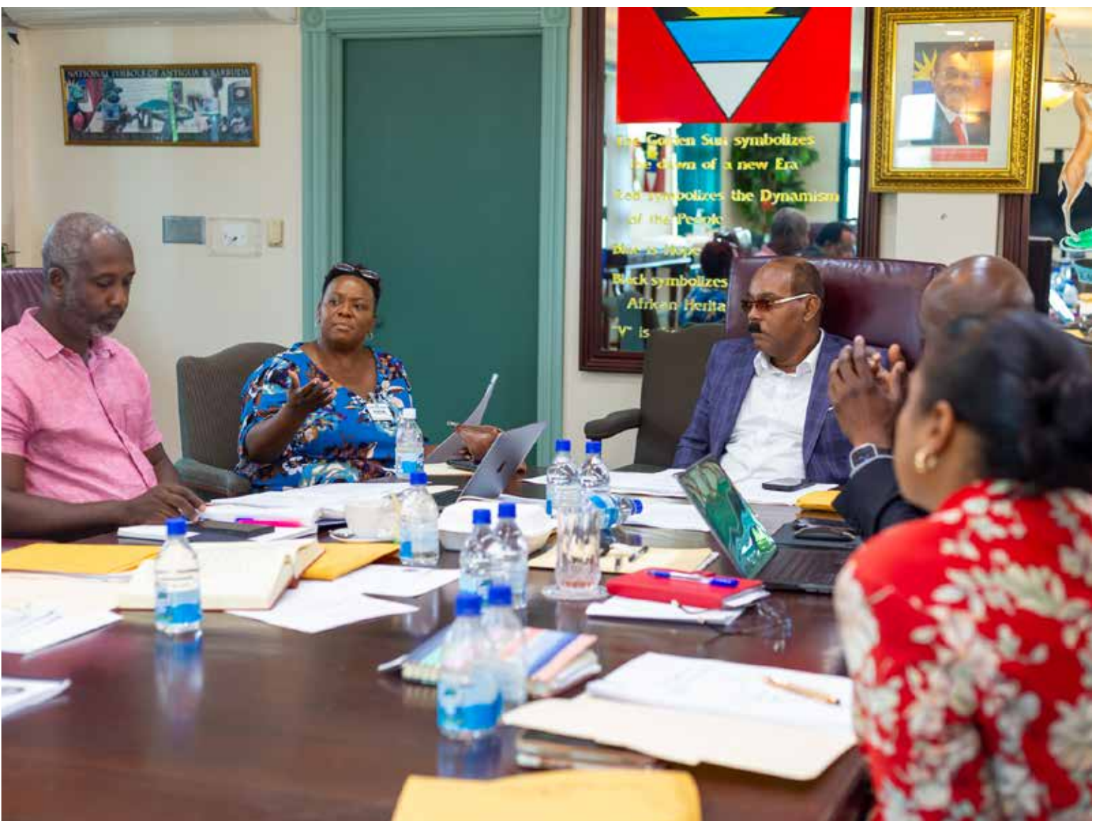
Two senior officials of the Harrison Centre, Antigua and Barbuda Institute for Continuing Education (ABICE) were invited to the Cabinet on Wednesday to discuss matters of interest, including a new scholarship programme. Story on page 9.