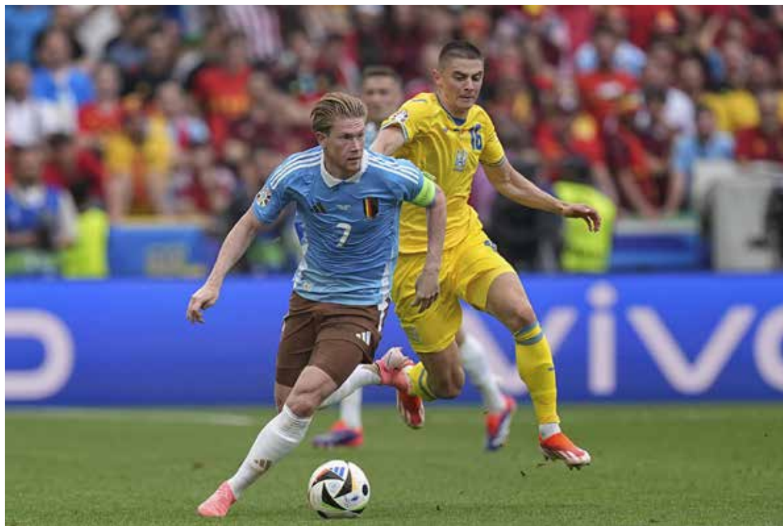
Belgium’s Kevin De Bruyne, left, fights for the ball with Ukraine’s Vitaliy Mykolenko during a Group E match between Ukraine and Belgium at the Euro 2024 soccer tournament in Stuttgart, Germany, Wednesday, June 26, 2024.

Playing at Euro 2024 against the backdrop of Russia’s invasion, Ukraine