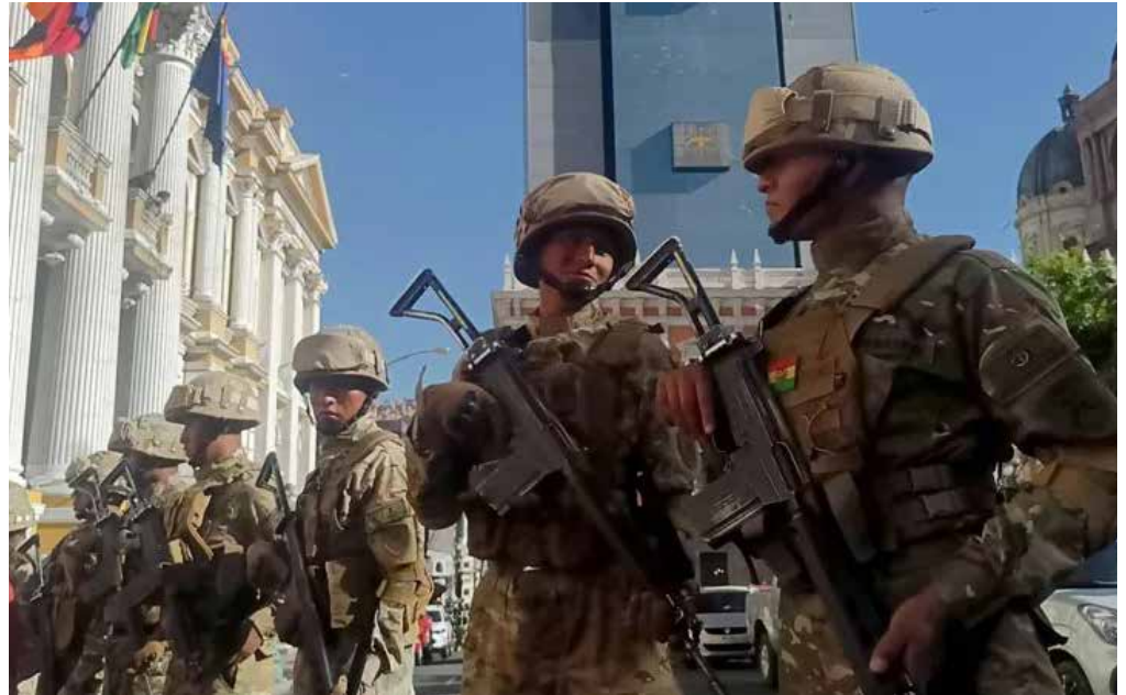
Soldiers took up positions outside key government buildings in La Paz.

Certainly, the government now looks more vulnerable, and others may try to dislodge Mr Arce’s administration - albeit through politics rather than via