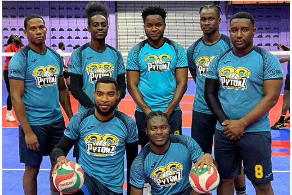
The Pytonz men's volleyball team and 25-18.

It took the Pytonz an hour and two minutes to eliminate the Storming Lions, winning their men's President Cup encounter 25-15, 22-25, 25-14,