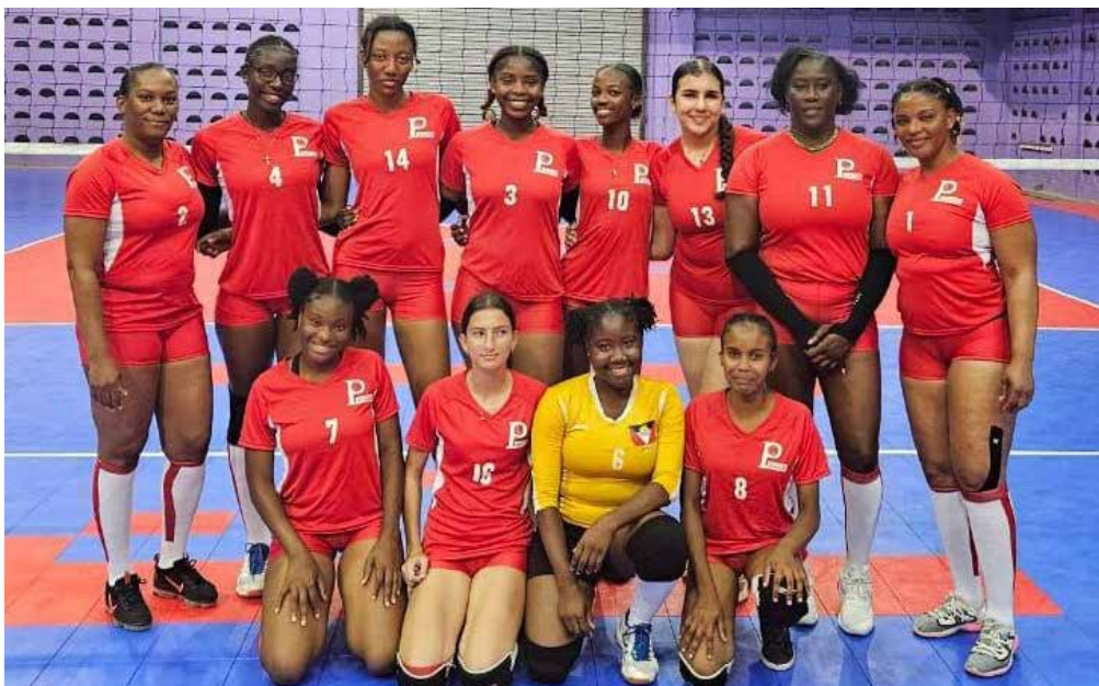
The Paragons female volleyball team