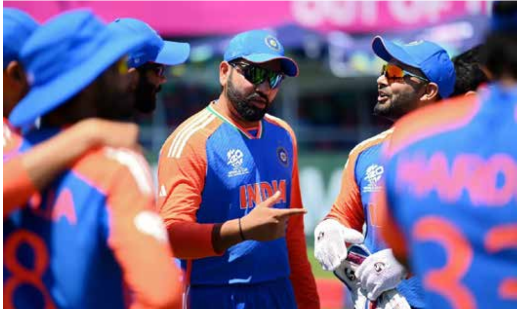
India's captain Rohit Sharma speaks in the team huddle during their ICC Men's T20 World Cup game against Pakistan at the Nassau County Cricket Stadium in New York, USA, June 9, 2024.

Spinners have been quite effective on the ground, but there's also been a bit in the surface for the quicks, with the highest score across the five games being Afghanistan's 183 for five against Uganda.