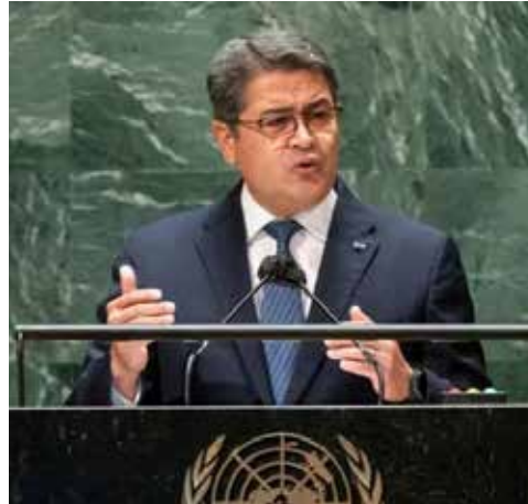
Hernández addresses the UN General Assembly in 2021.

“Hernandez’s conviction was based on the testimony, over the course of a three-week trial, of numerous witnesses whose testimony was corroborated