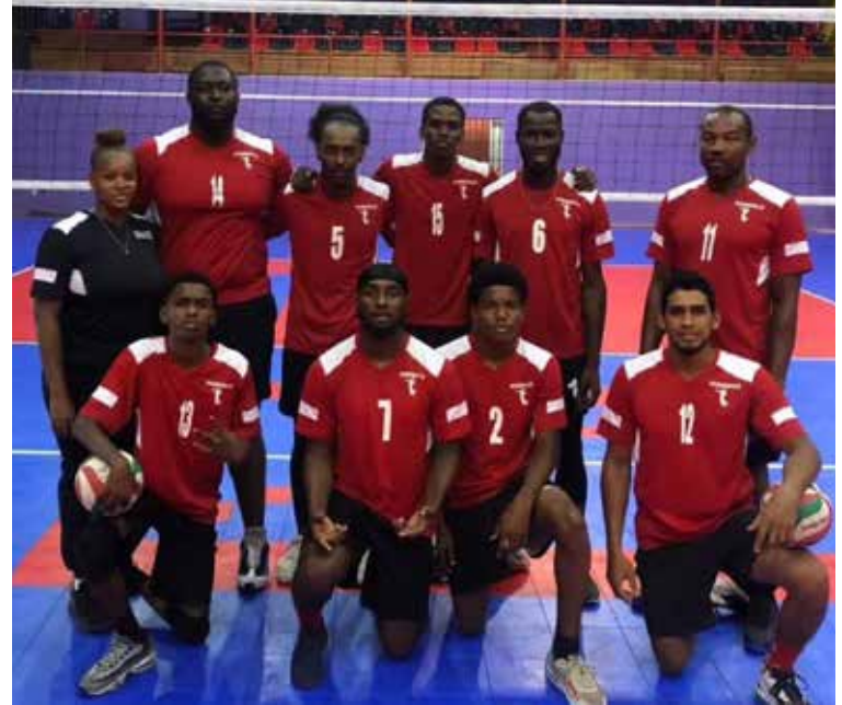
Stoneville men's volleyball team Squad to finish at the top of the women's league with a perfect record of 10 wins in

Their 25-10, 25-12, and 25-15 victory in an hour and 10 minutes allows Da