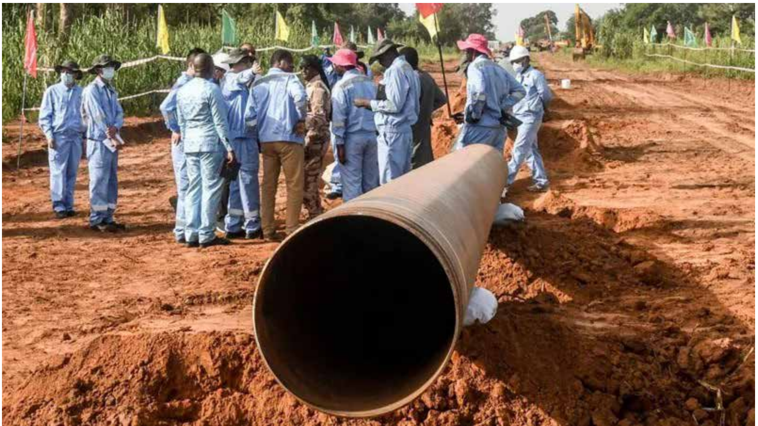
The oil pipeline between Niger and Benin was formally launched in November.