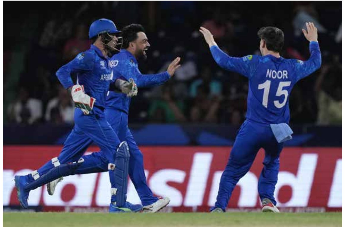
Afghanistan's captain Rashid Khan, centre, celebrates the wicket of Australia's Matthew Wade during the men's T20 World Cup cricket match between Afghanistan and Australia at Arnos Vale Ground, Kingstown, St. Vincent and the Grenadines, Saturday, June 22, 2024.

Man of the match Guldabin Naib took four wickets in an inspired spell in the middle overs to stall Australia's chase before Azmatullah Omarzai had final wicket Adam Zampa caught in the deep in the final over to complete a stunning win amid jubilant celebrations among the Afghan players and team management.