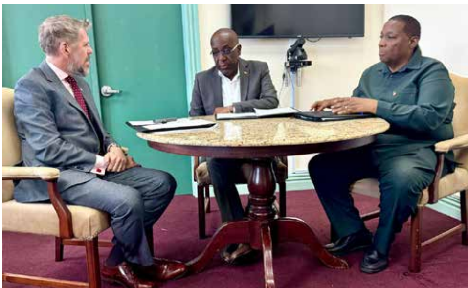
Foreign Affairs Minister E.P. Chet Greene welcomes new UK Resident High Commissioner Representative John Hamilton when they discussed a range of issues of mutual interest.