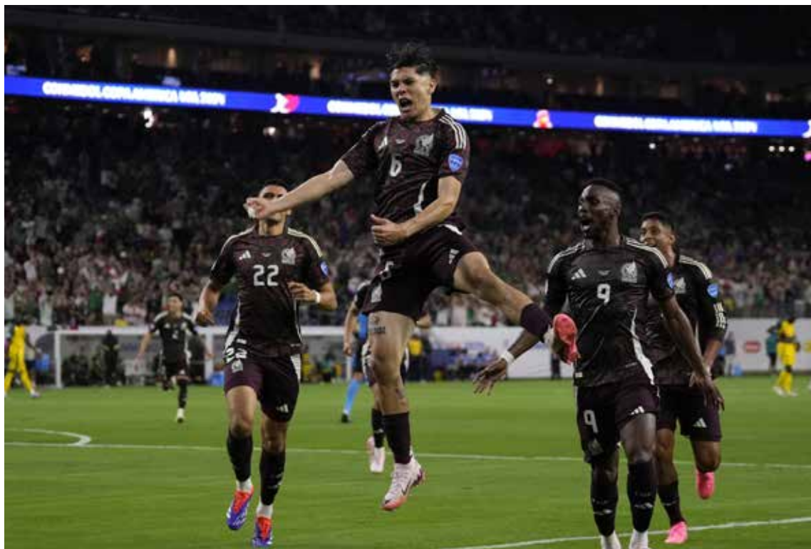
Mexico's Gerardo Arteaga jumps as he celebrates scoring his side's opening goal against Jamaica during a Copa America Group B soccer match in Houston, Texas, USA, Saturday, June 22, 2024.

peared to put Jamaica ahead with a short-range header in the 50th minute but the goal was disallowed for offside following a video review.