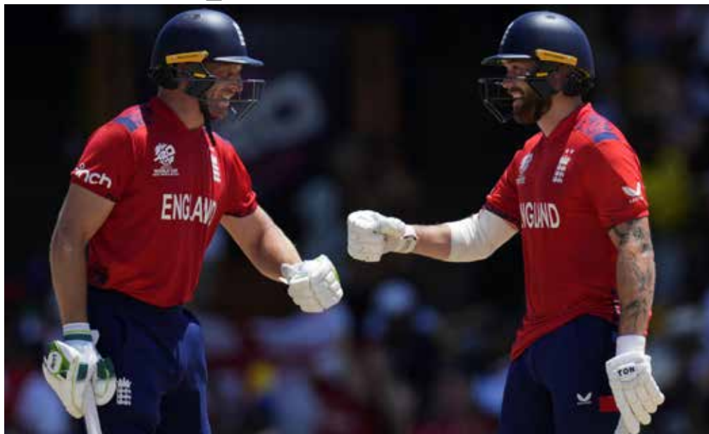
England's captain Jos Buttler, left, and batting partner Phil Salt celebrate scoring runs during the ICC Men's T20 World Cup cricket match between the United States and England at Kensington Oval in Bridgetown, Barbados, Sunday, June 23, 2024.