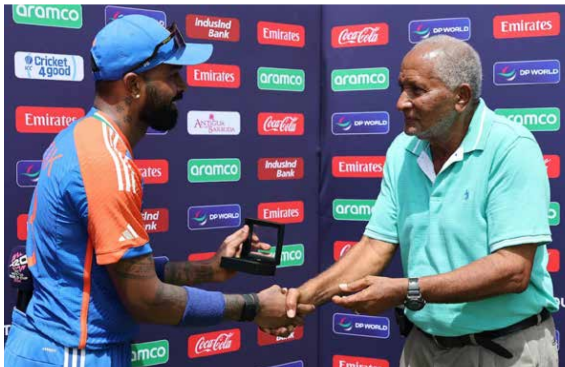
India's Hardik Pandya, left, received his Player-of-the-Match award from Sir Andy Roberts at the end of India's ICC Men's T20 World Cup Super Eight match against Bangladesh at the Sir Vivian Richards Stadium in Antigua on Saturday, June 22, 2024.

Sharma was caught in the fourth over off Shakib al Hasan, while Kohli put on another 32 off 27 balls