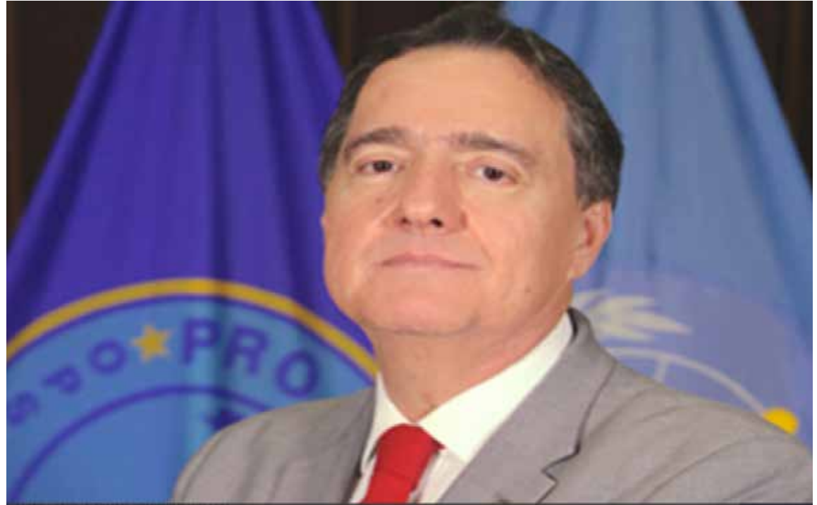
Director of the Pan American Health Organization (PAHO) Dr Jarbas Barbosa.

However, even before the pandemic, it said the