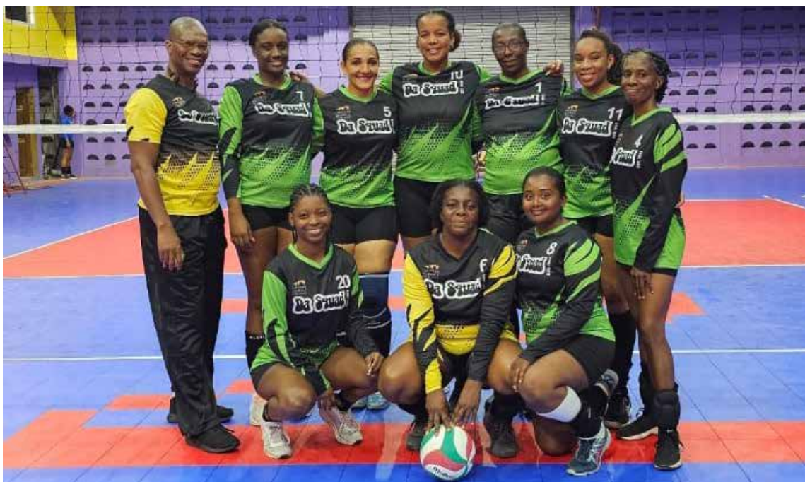
Caribbean Alliance Insurance Da Squad female volleyball team.

Paragons won their third successive match to clinch