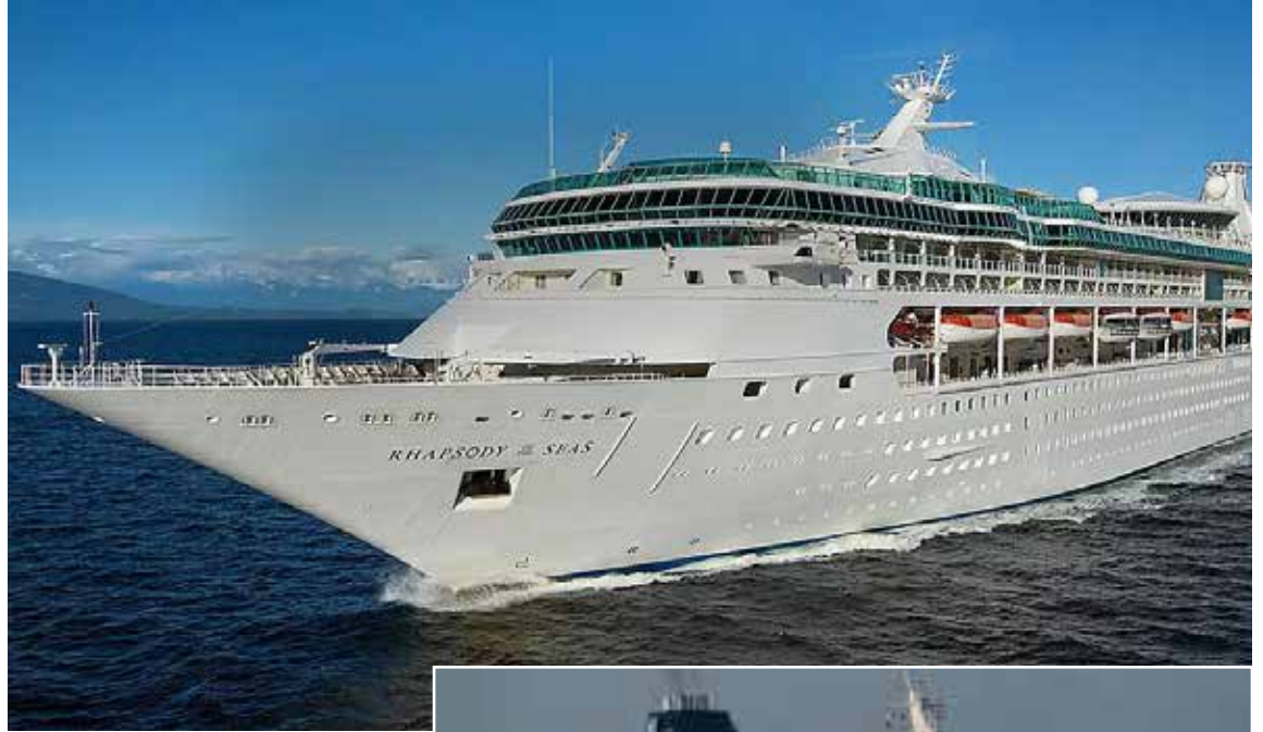
Rhapsody of the Seas

The Antigua Cruise Port continues to promote Antigua and Barbuda as an attractive destination year-round and so far, it has seen an increase in cruise ship calls over the summer