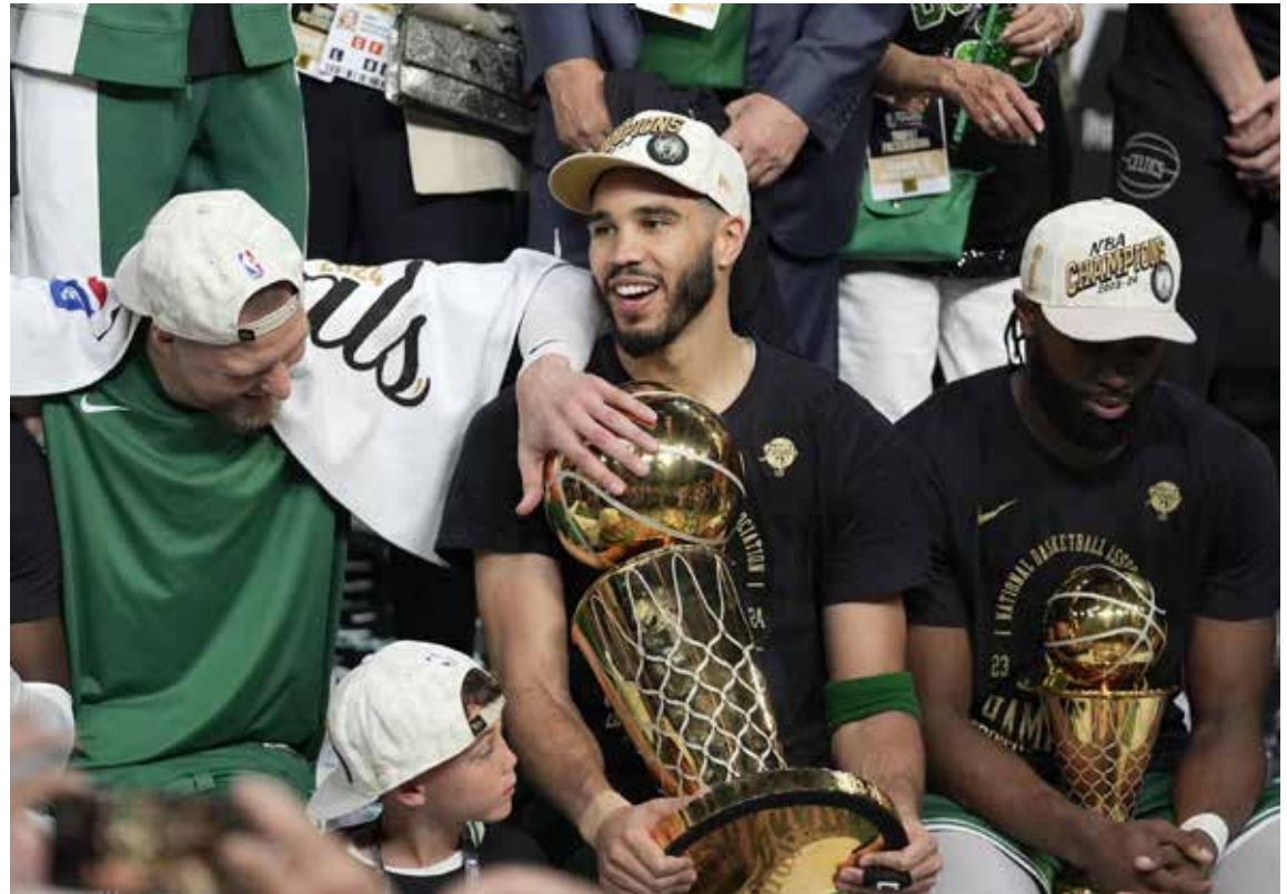
Boston Celtics forward Jayson Tatum, center, holds the Larry O'Brien Championship Trophy as he celebrates with center Kristaps Porzingis, left, and guard Jaylen Brown, right, after the Celtics won the NBA championship with a Game 5 victory over the Dallas Mavericks in Boston on Monday, June 17, 2024.

"I share this with my brothers and my partner in crime Jayson Tatum," Brown said after the 107th