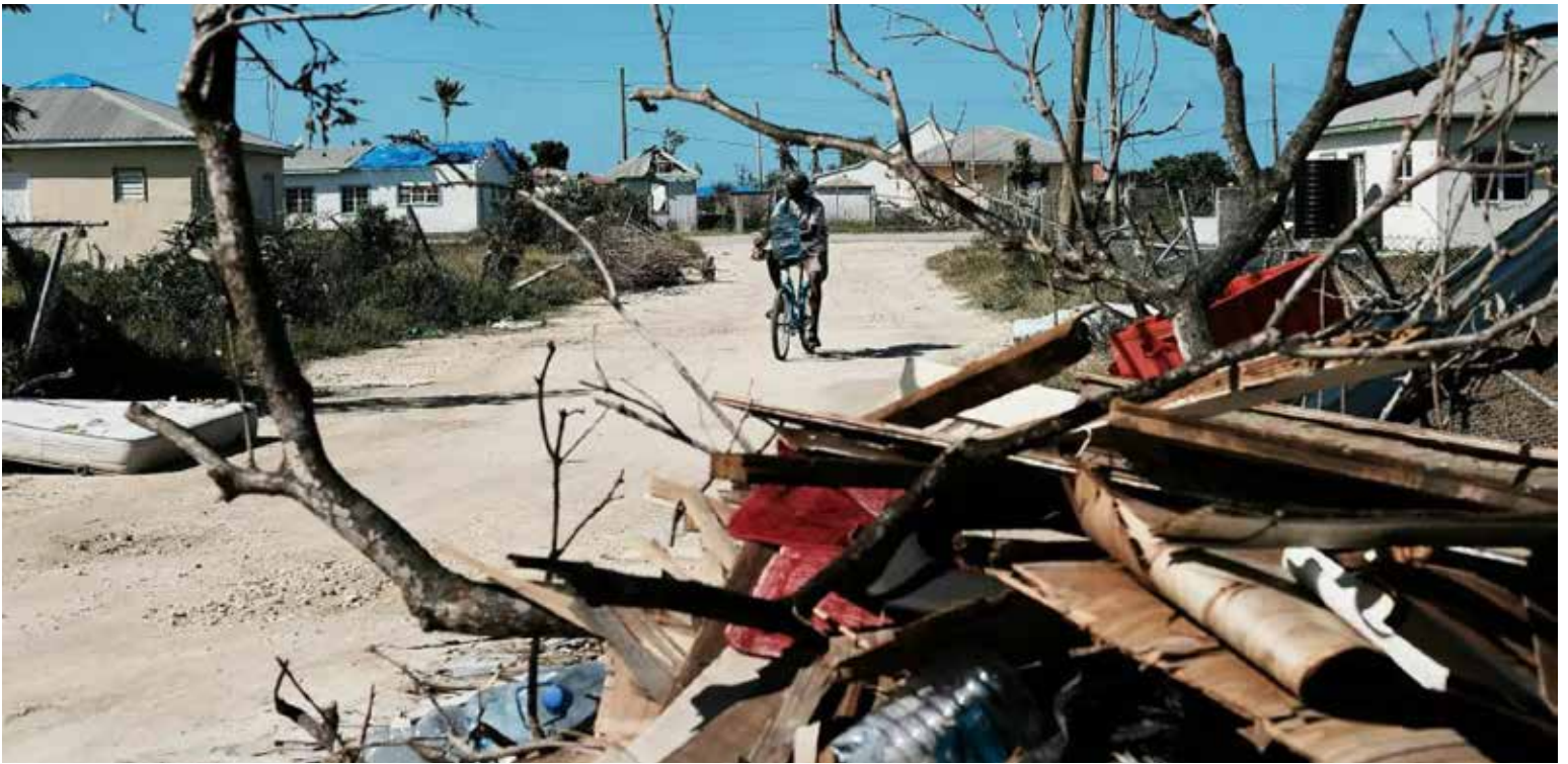
Barbuda following the devastation of Hurricane Irma in 2017