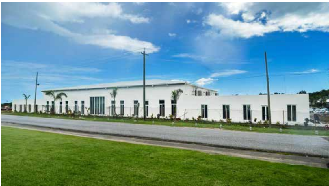
The AUA conference centre

The government has already declared that it intends to offer to host more international conferences with the recognition that the country has the capacity to successfully host these events.