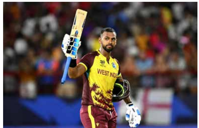
West Indies batsman Nicholas Pooran acknowledges the crowd after being dismissed for 98 against Afghanistan during their ICC Men's T20 World Cup Group C match at the Darren Sammy Cricket Ground in St. Lucia on Monday, June 17, 2024.

Pooran's knock is the highest individual score for cont'd on pg 23