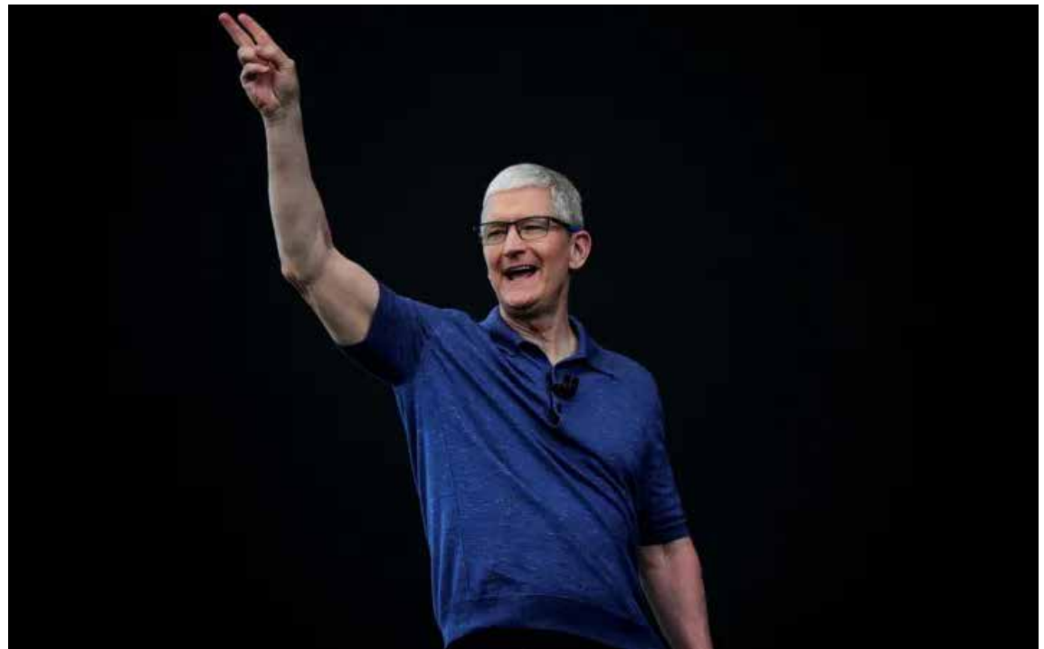
Apple boss Tim Cook pictured on-stage at WWDC 2024.

The announcement was not welcomed by all. Elon Musk, the owner of Tesla and Twitter/X, threatened to ban iPhones from his companies due to "data se-