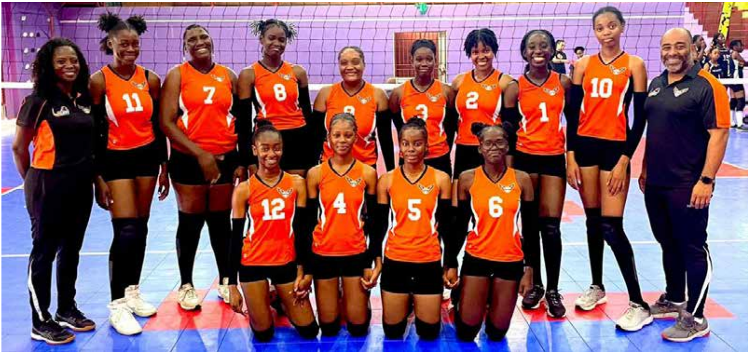
TOA Media and MKUU Tours Chargers Eagles female volleyball team.