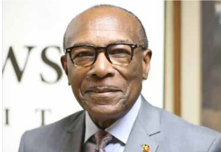
Health Minister, Sir Molwyn Joseph

Not only do they provide employment, but their students rent apartments, motor vehicles as well as