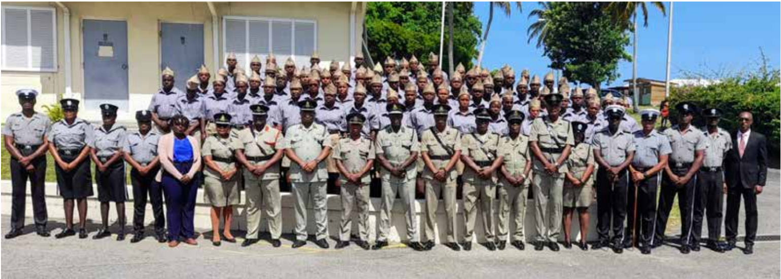
Group photo of the Police Administration and the more than 70 recruits at the commencement of training