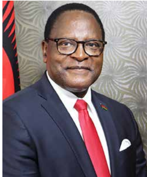
President Dr Lazarus McCarthy Chakwera.

The Ministry of Foreign Affairs said that his participation comes at the invitation and sponsorship of the Afreximbank and would have been the