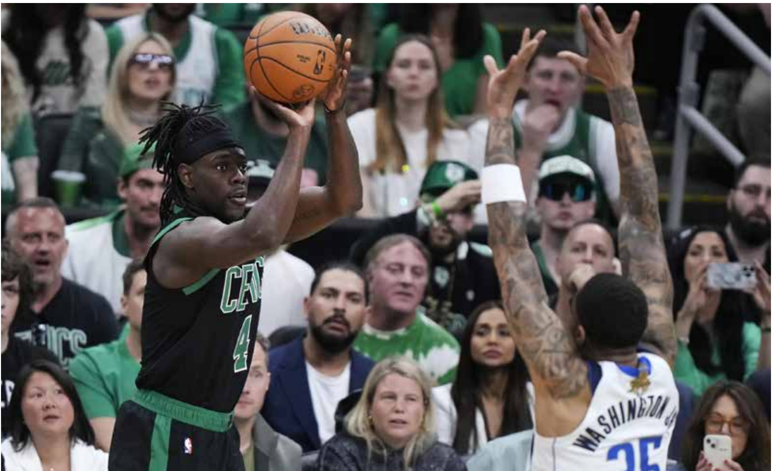
Boston Celtics guard Jrue Holiday takes a shot over Dallas Mavericks forward P.J. Washington (25) during the first half of Game 2 of the NBA Finals basketball series in Boston, Sunday, June 9, 2024.