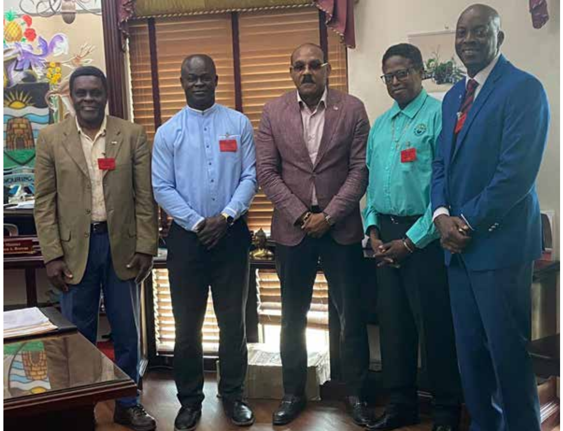
Prime Minister Gaston Browne (centre) with members of the Evangelical Alliance

“We asked the government to undertake a programme of education to inform the public that marijuana use in public places is not legal. He said there are those who mis-interpret the decriminalization of marijuana as permission to smoke openly in public and the Christian leaders are concerned about the message this is sending