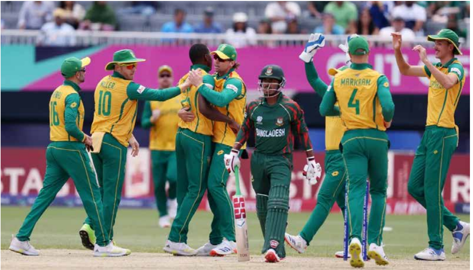
South Africa's players celebrate after Kagiso Rabada, third left, dismisses Bangladesh batsman Tanzid Hasan, center, during their Group D clash of the T20 World Cup match at the Nassau County International Cricket Stadium, New York, United States of America, June 8, 2024.