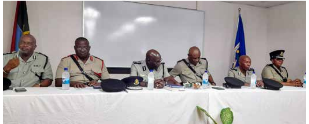
The head table at the opening ceremony for the training of new police recruits