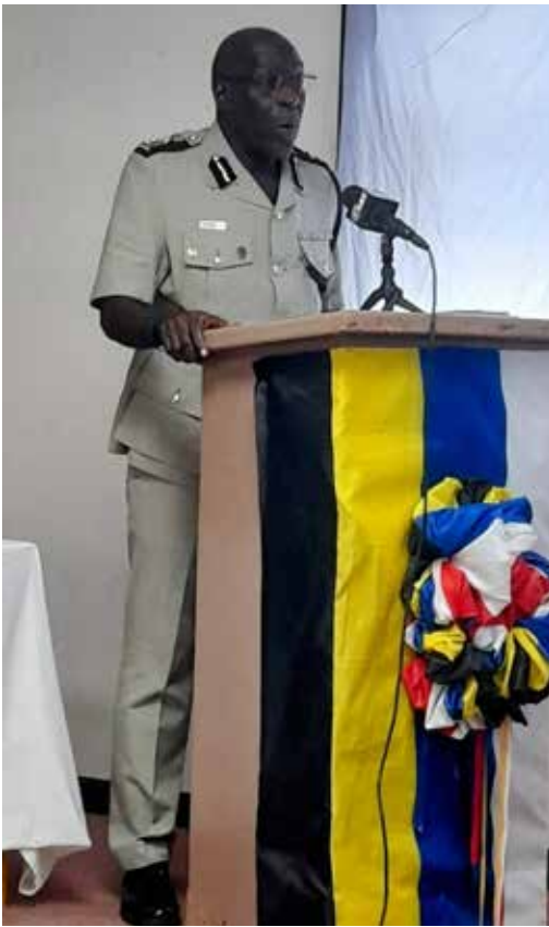
Police Commissioner, Atlee Rodney