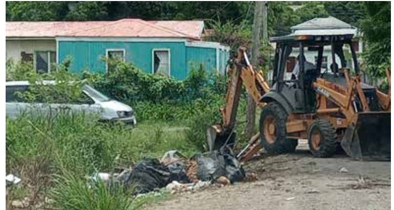
Indiscriminate dumping of garbage is a serious problem

Beside the sheer scope of keeping abreast with the need to keep these waterways clear to prevent flooding during heavy rainfalls, littering by members of the