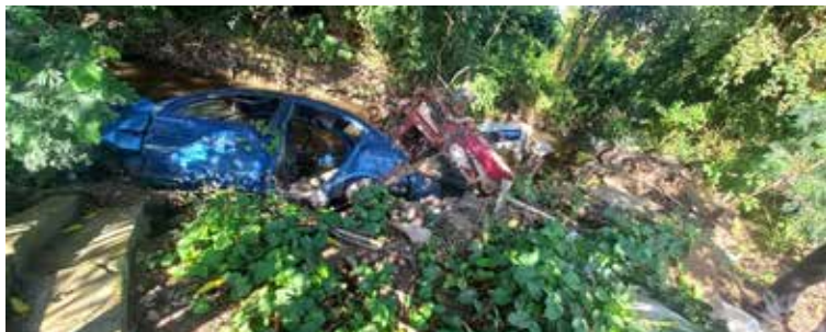
This discarded motor vehicle caused major blockage of waterways leading to flooding.