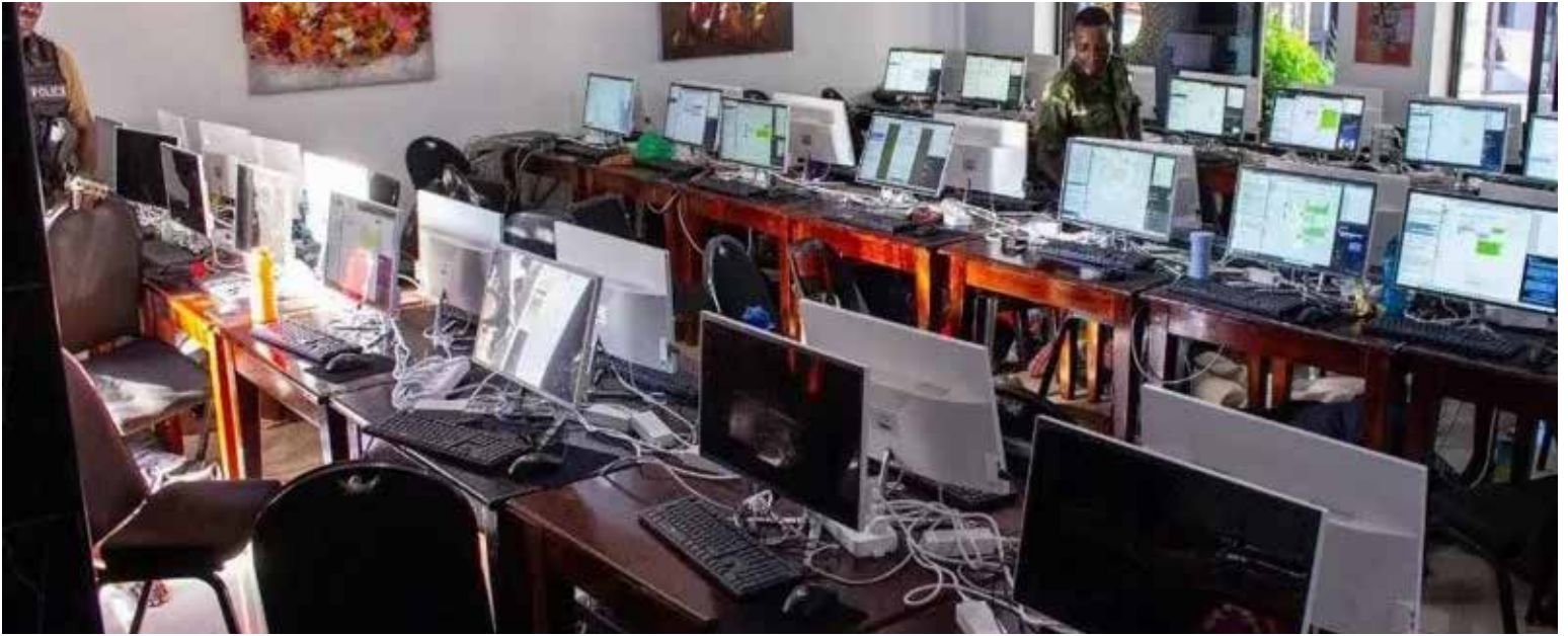
Dozens of computers were seized in a recent raid by officials.