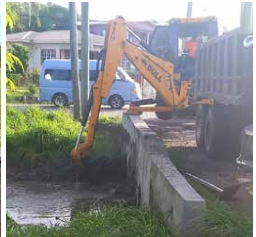
More garbage ...this is an eyesore and an issue for flooding