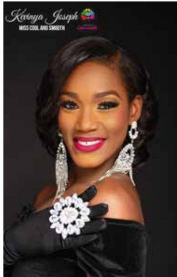
Commonwealth held in St. Lucia in 2015.

Notably, she secured the 1st Runner-up position in the prestigious Miss