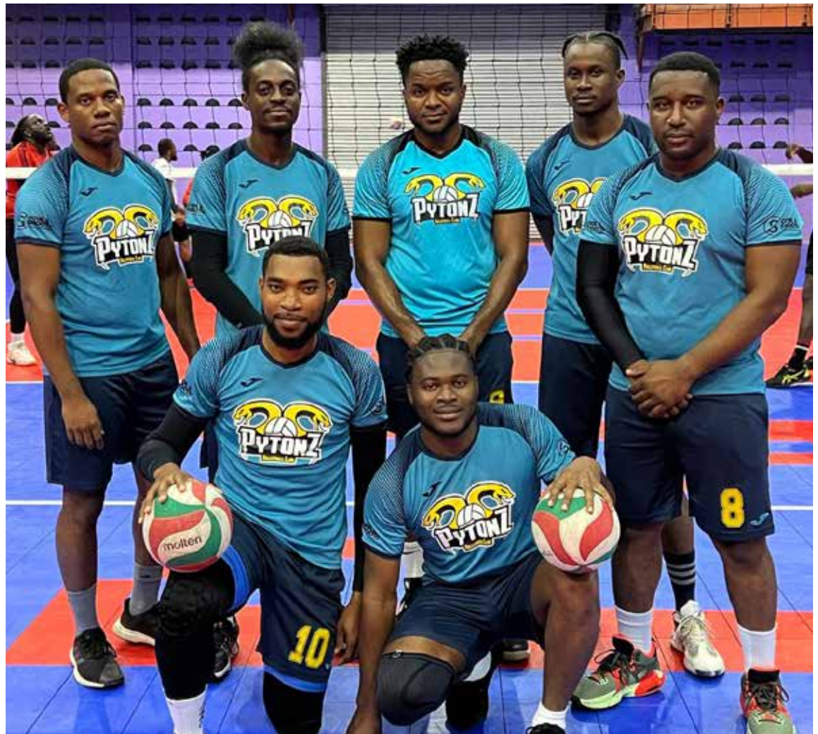
The Pytonz men's volleyball team

Paragons and Stoneville also recorded wins in their latest matches. Paragons, who are former Women's Division 1 champions, beat the bottom team, the Royal Cruisers, 3-0 in straight sets in