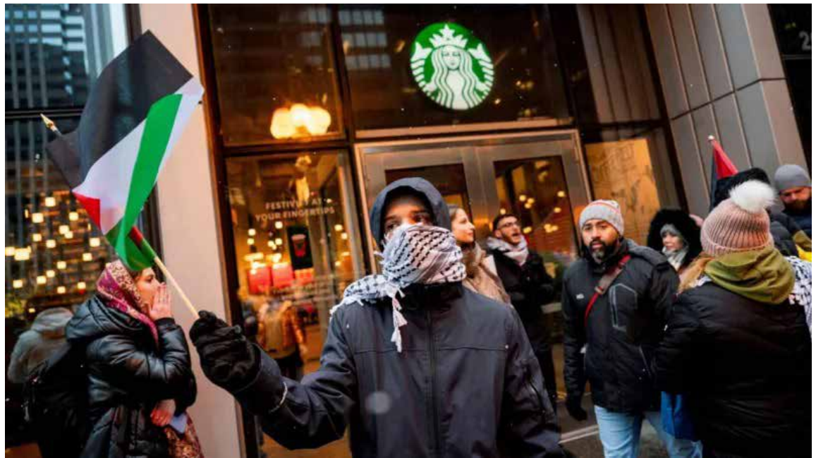
There have been protests outside Starbucks branches nationwide and calls for a ceasefire between Israel and Hamas

Starbucks - not the only American brand to face a backlash over the issue and not a target of the official Boycott, Divestment and Sanctions (BDS) movement - has blamed misinformation about its views, after issuing a blanket statement condemning violence in the