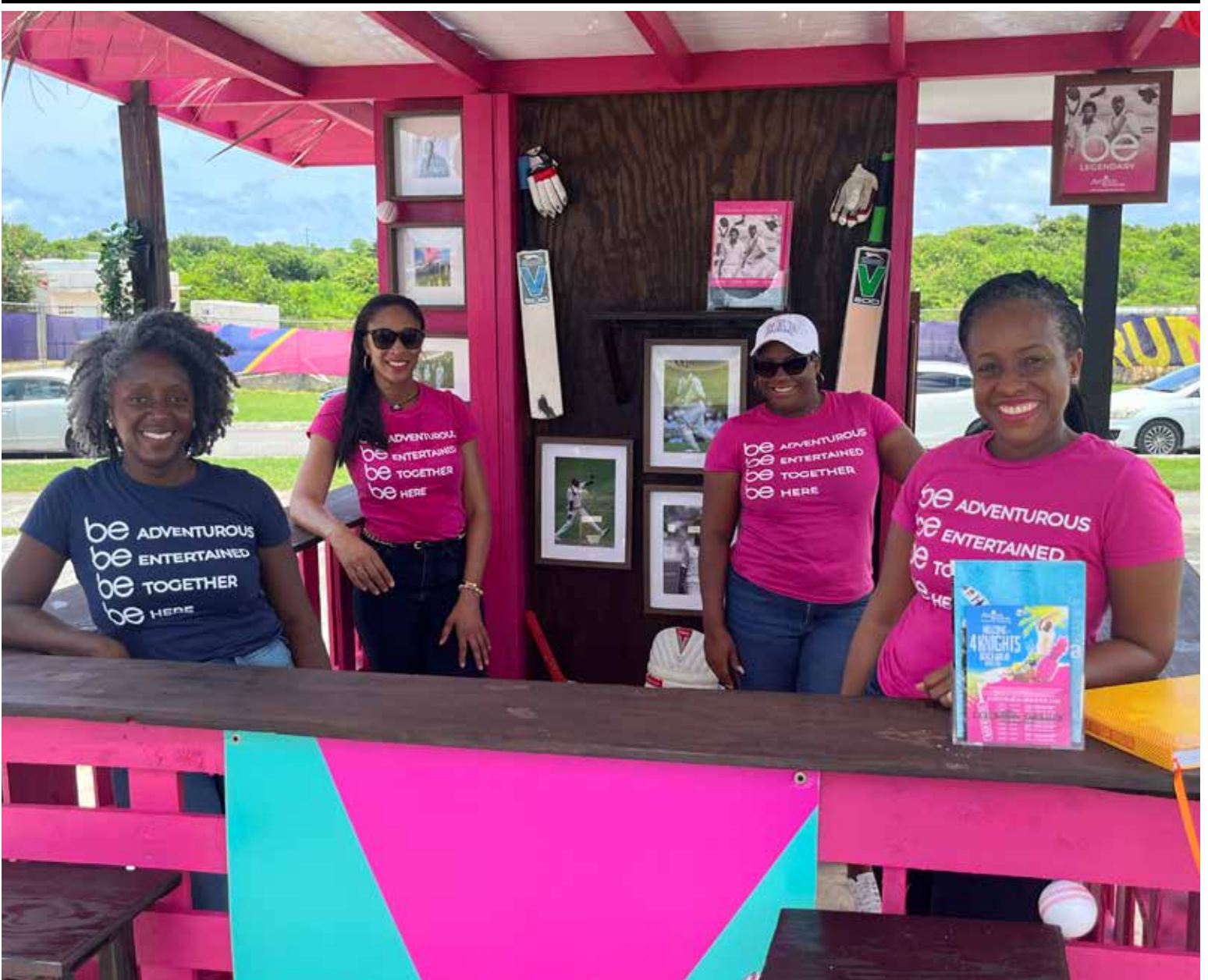
The ABTA created a 'beach atmosphere' at the ICC T20 World Cup Cricket Match at Sir Vivian Richards Stadium on Sunday. More photos on page 10.