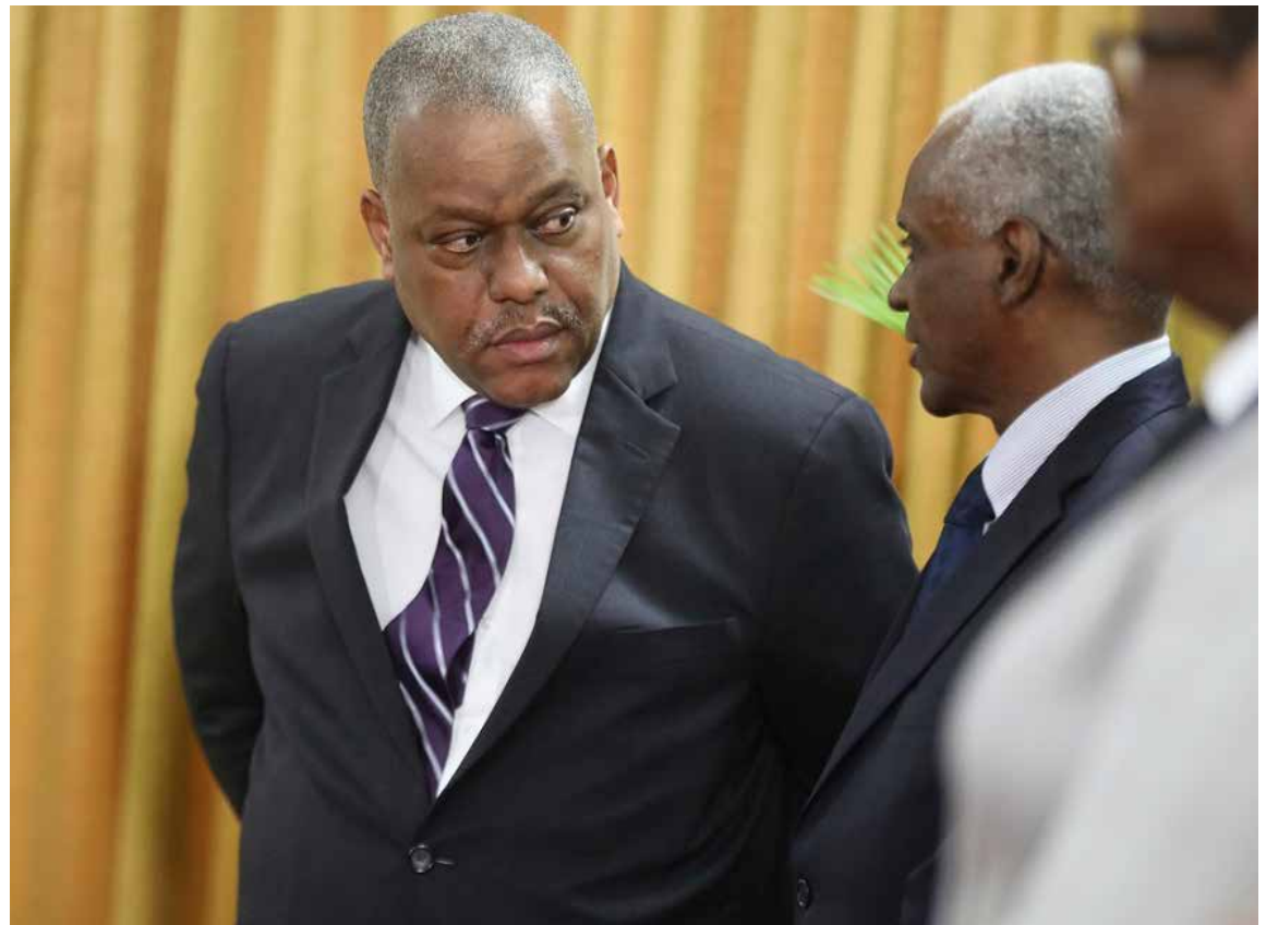
New Haitian Prime Minister Garry Conille, left, speaks to the president of the council Edgard Leblanc Fils during his swearing-in ceremony in Port-au-Prince, Haiti, Monday, June 3, 2024.

AP journalists observed high-ranking officials entering the hospital, includ-