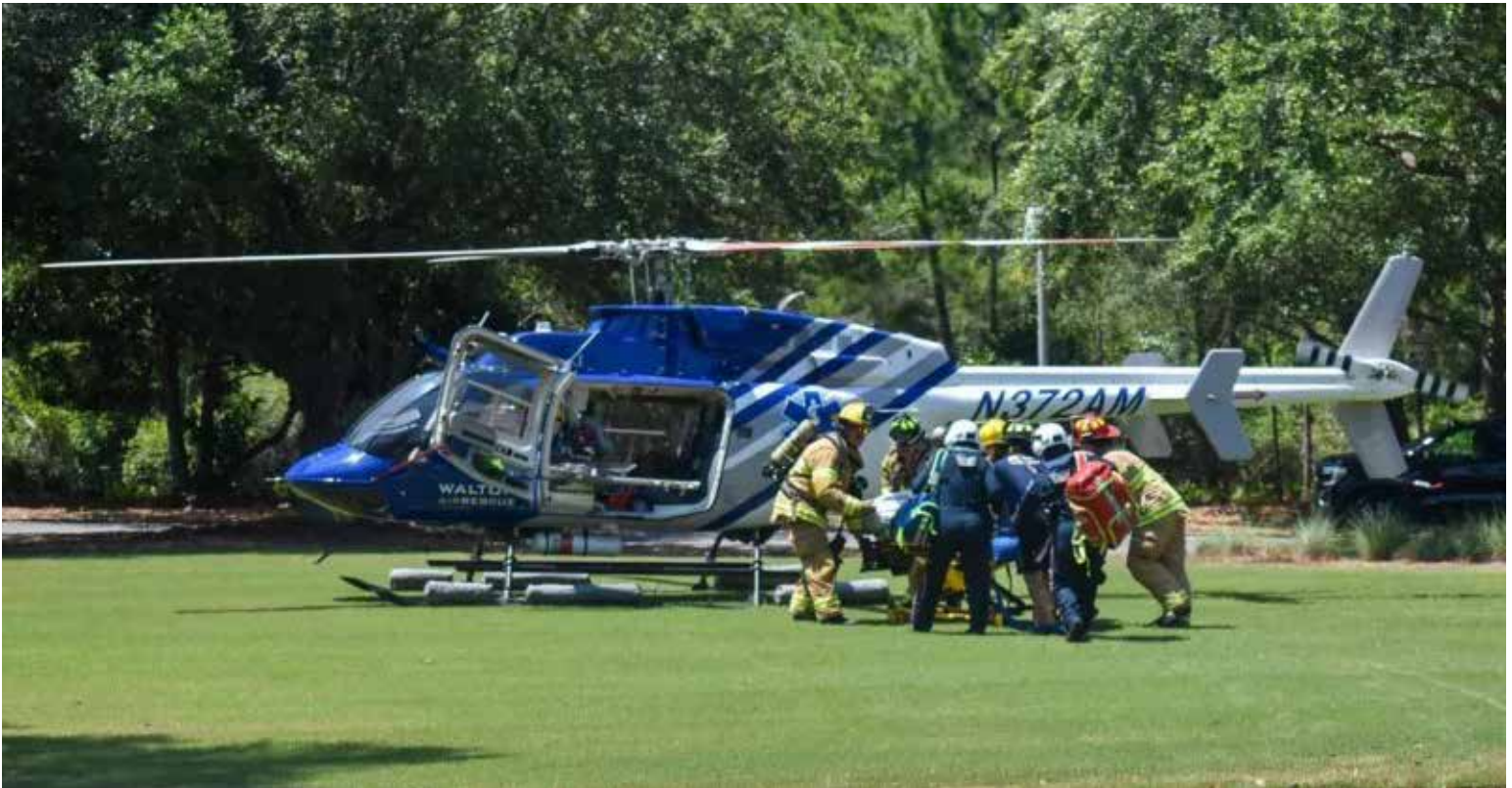
Fire officials said the 45-year-old woman, who was swimming, was airlifted to a trauma centre.