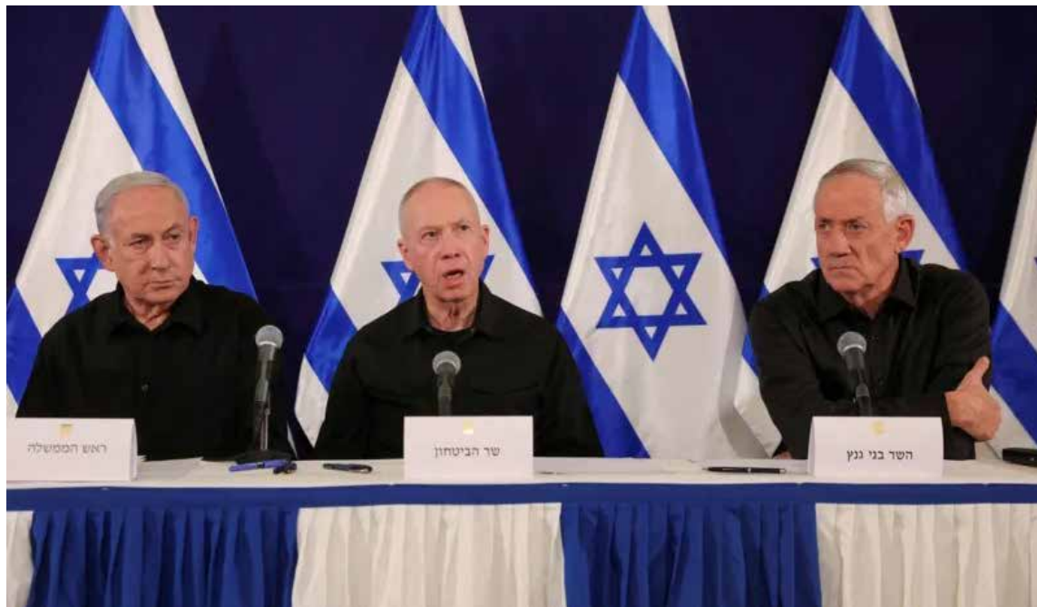
Israel formed a three-person war cabinet following the 7 October attacks.

Last month, Mr Gantz set a deadline of 8 June for Mr Netanyahu to lay out how Israel would achieve its six