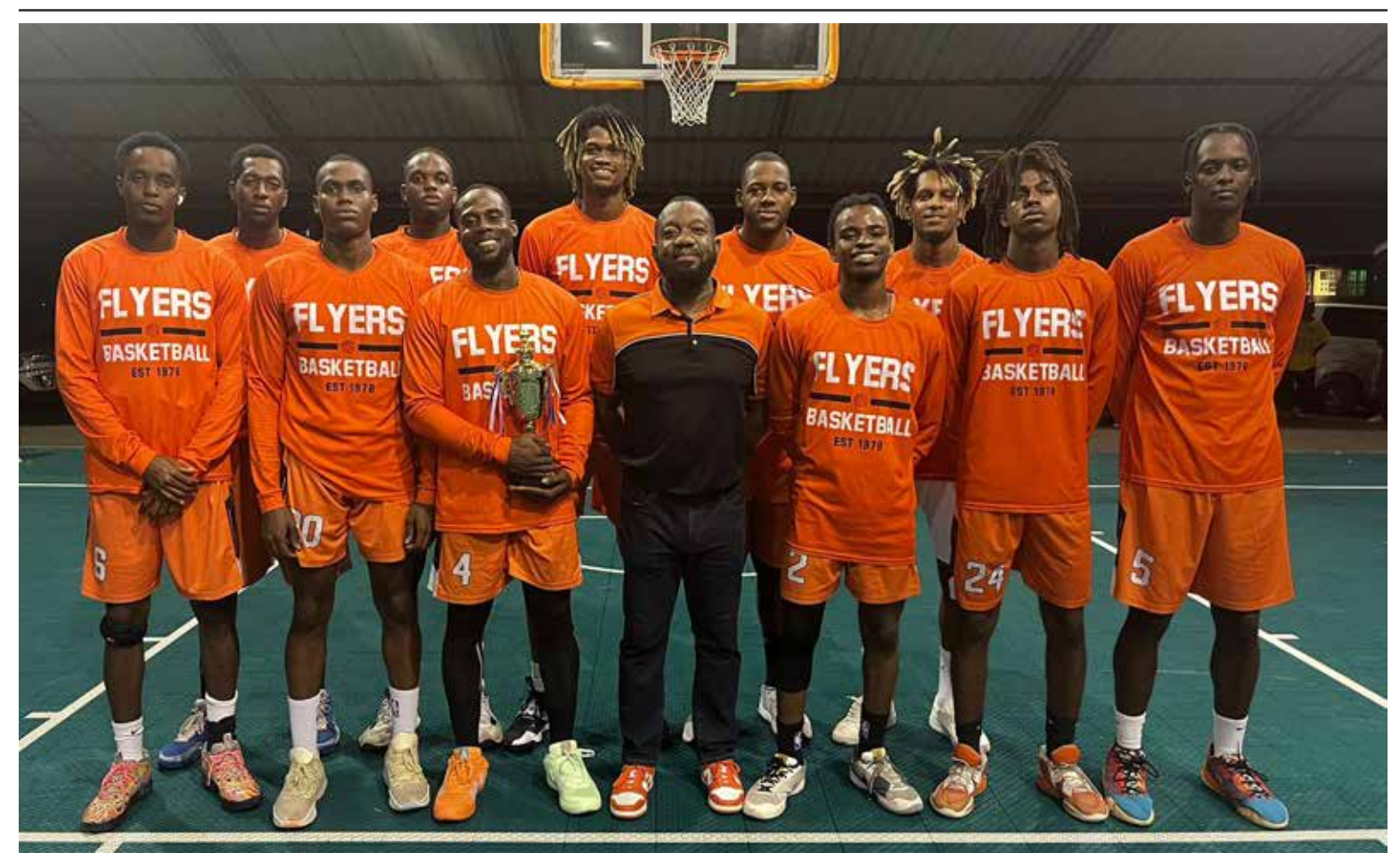
The EZ Fit Flvers basketball team