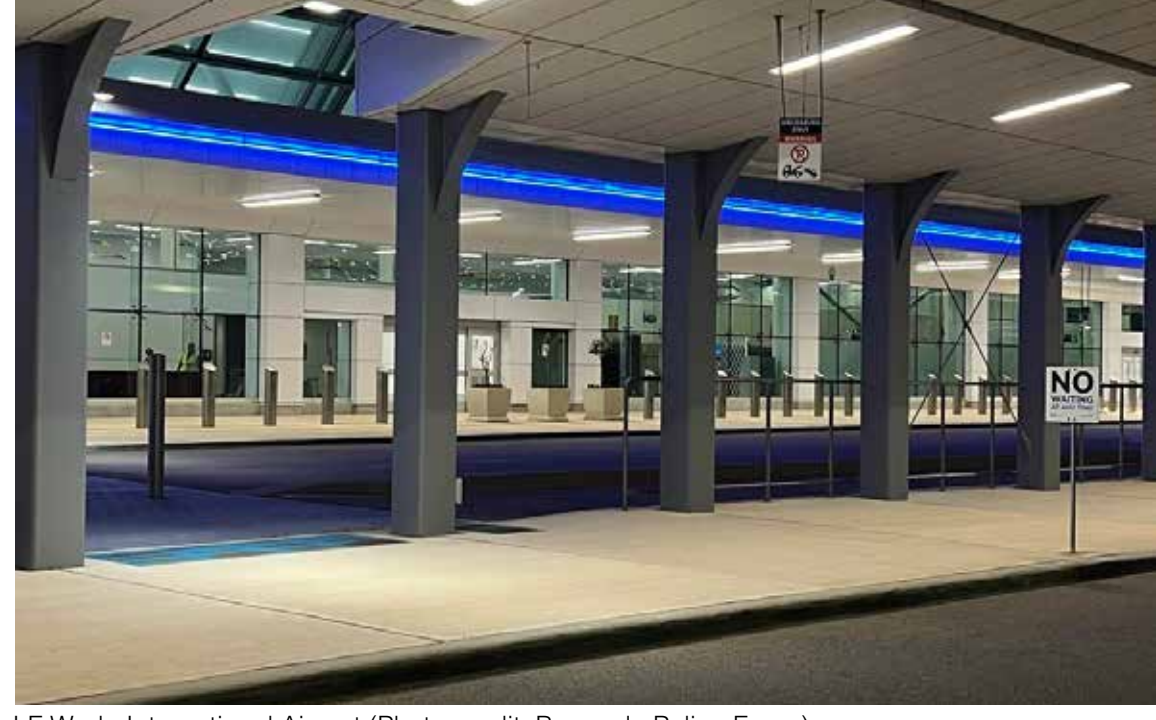
LF Wade International Airport

Meanwhile, on Sunday in Bermuda, police were notified around 9:30 pm by staff at the LF Wade International Airport of a bomb threat that was received via e-mail threatening the terminal and British Airways flight 158, which was due to depart for London Heathrow.