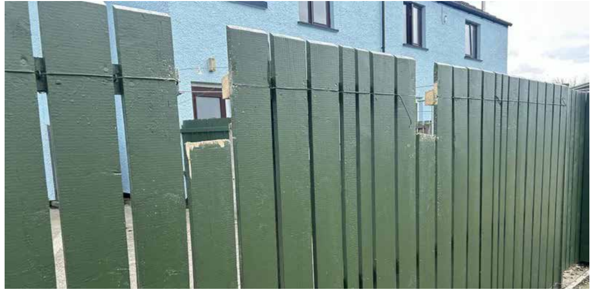
The PSNI said a man has been left with potentially life-changing injuries after he was nailed to a fence.

"We live in a democratic society where there is no justification for this. Those