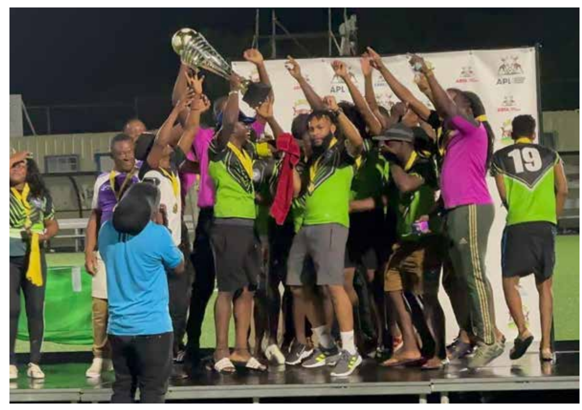
All Saints United celebrate after winning the Premier Division League title at the ABFA Technical Center at Paynters on Sunday, May 5, 2024.

Despite the draw, it was insufficient for the Ottos