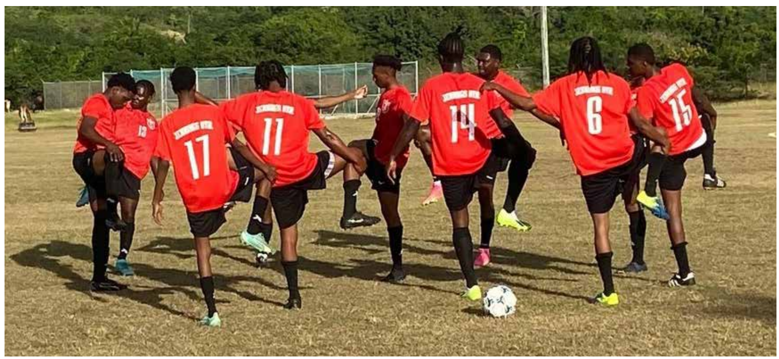
The Jennings United football team