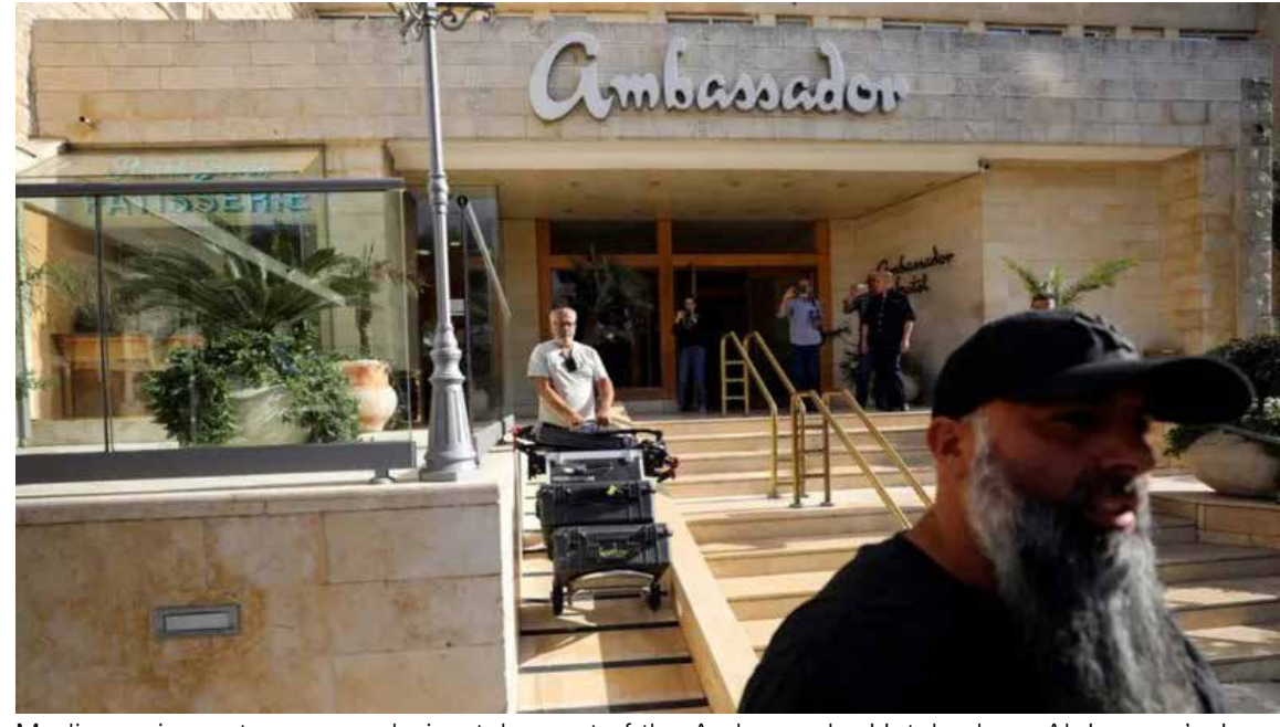
Media equipment was seen being taken out of the Ambassador Hotel, where Al Jazeera's Jerusalem office is based.

tively only partial, however, as the channel is still accessible through Facebook in Israel.