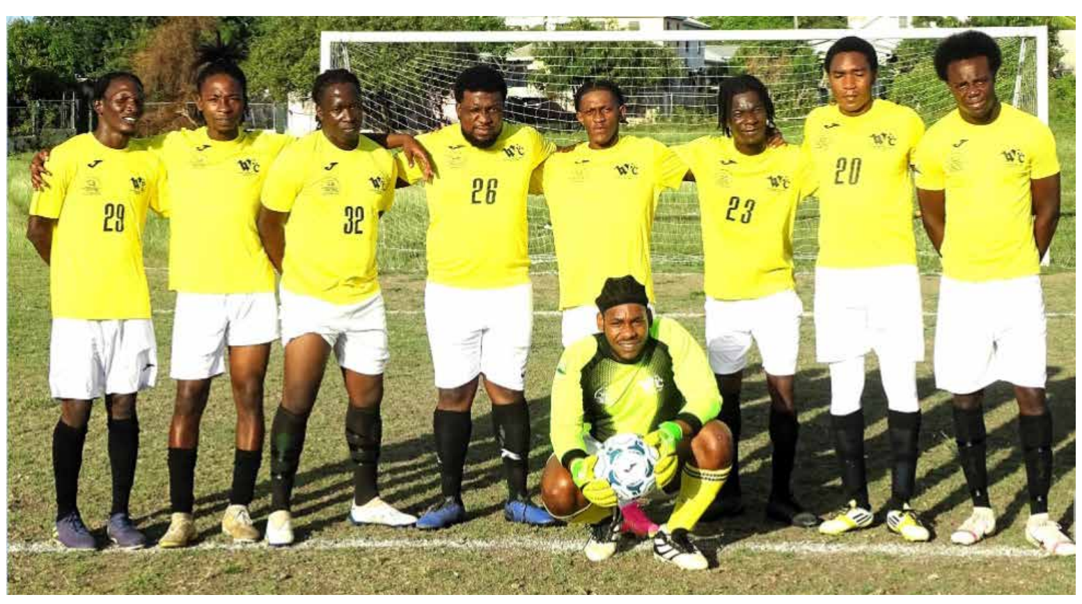
Lingies CPTSA Wings football team