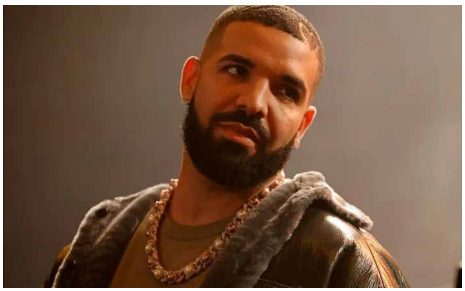
Drake says he would "have been arrested" if the allegations were true.