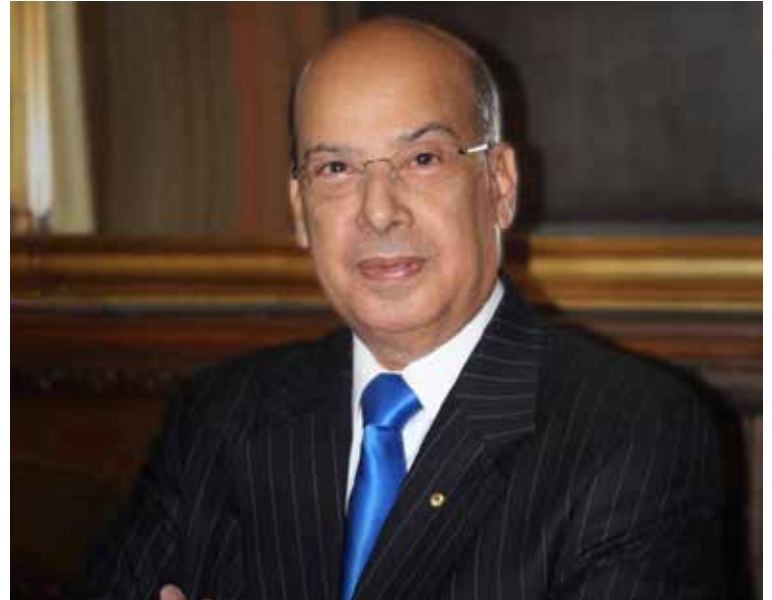
Sir Ronald Sanders

The choice of phrases like "black-clad" to describe a Chinese security guard at the Embassy and referring to the Embassy as a "fortress"