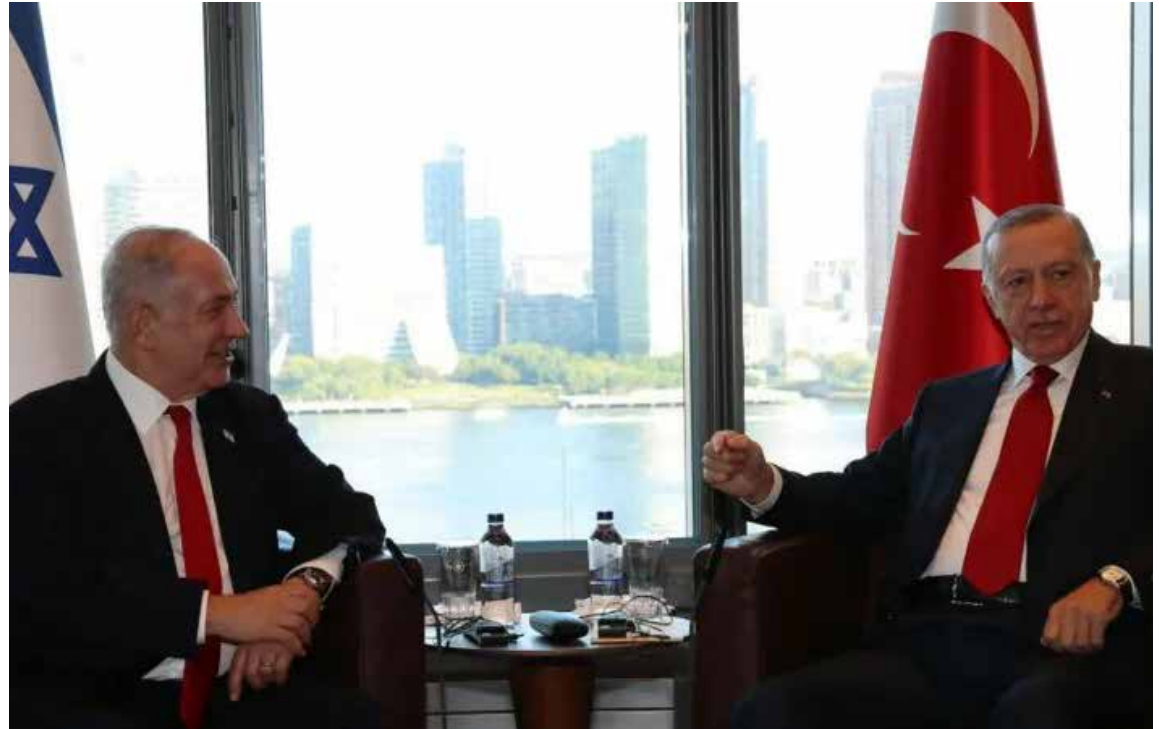
Turkish President Recep Tayyip Erdogan and Israeli Prime Minister Benjamin Netanyahu met in September 2023, just weeks before the outbreak of war.

In 1949, Turkey was the first Muslim-majority country to recognise Israel.