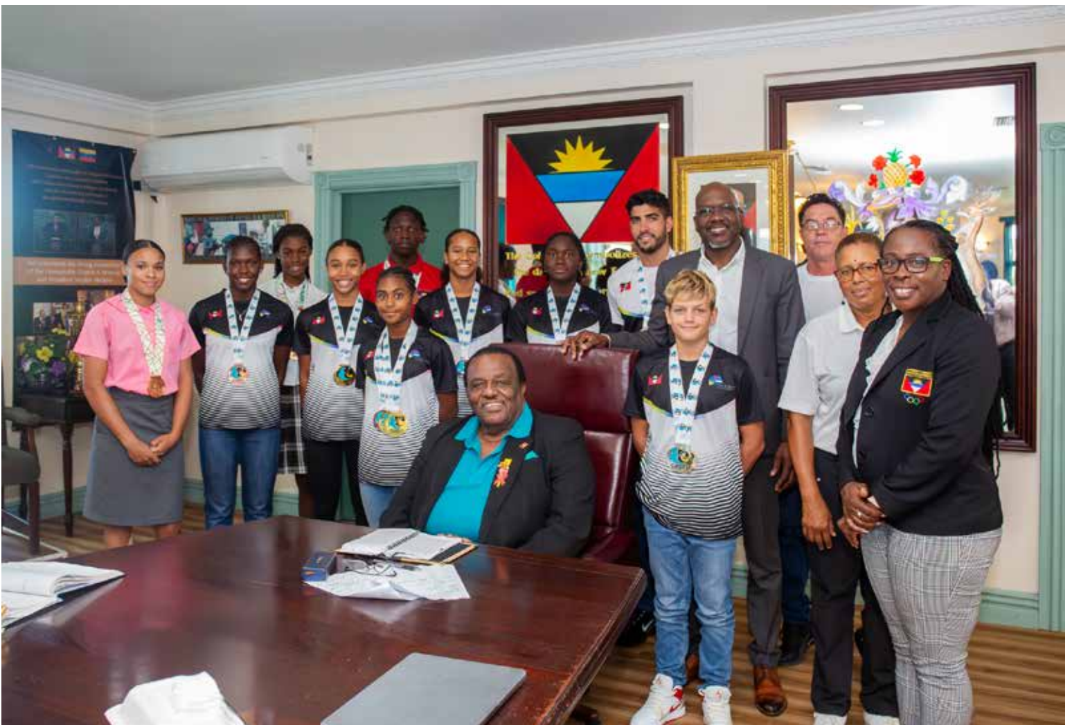
Medalists from the recently-held CARIFTA Games, and their coaches with acting Prime Minister Sir Steadroy Benjamin, centre, and Sports Minister Daryll Matthew. The athletes and coaches addressed the Cabinet on Wednesday.