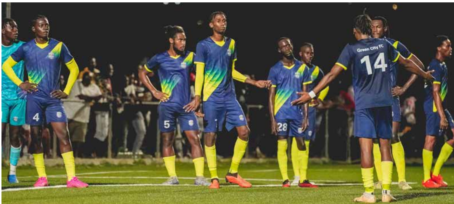
Players of the Green City football team.