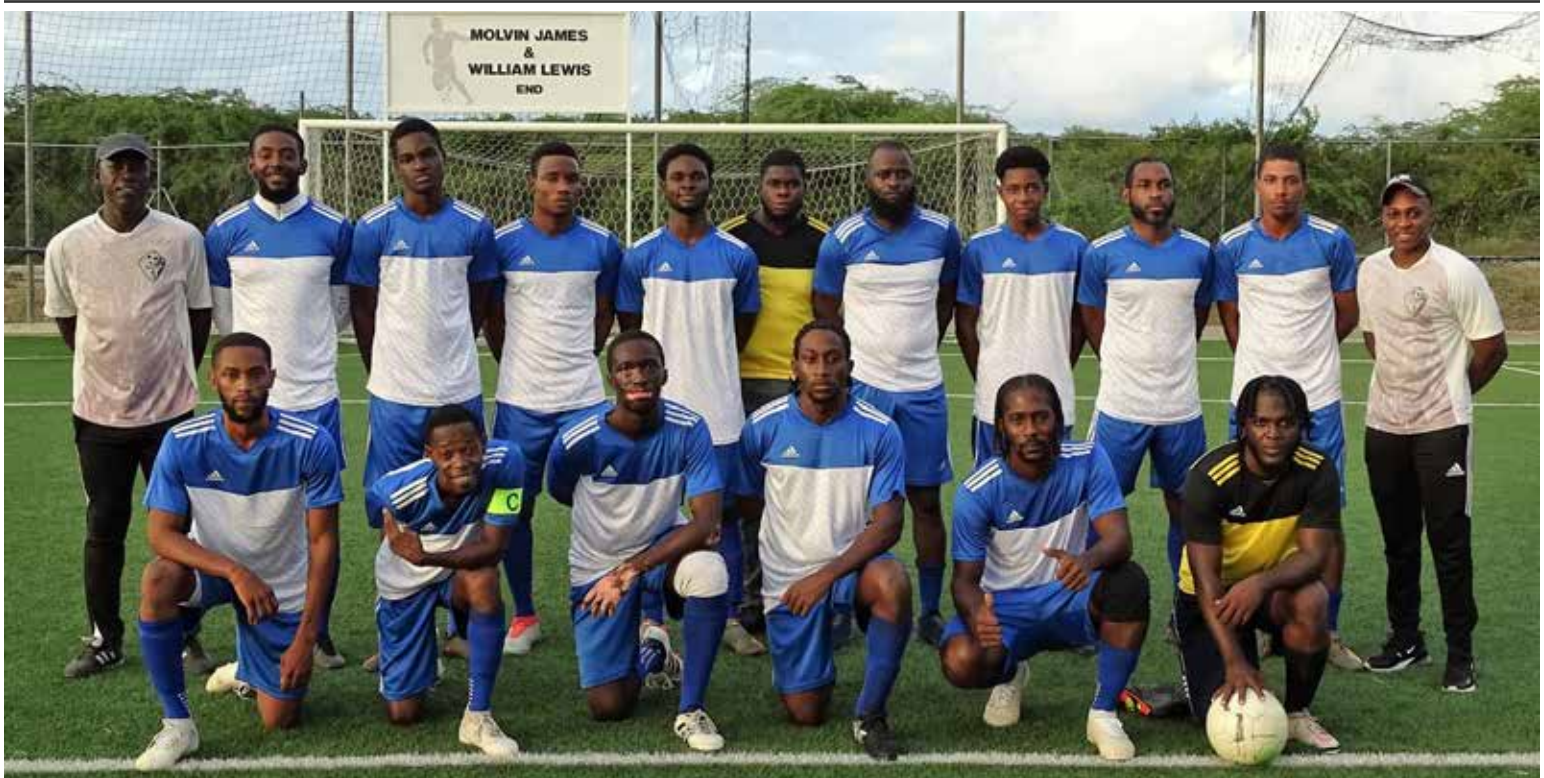
Players of the Sea View Farm football team.