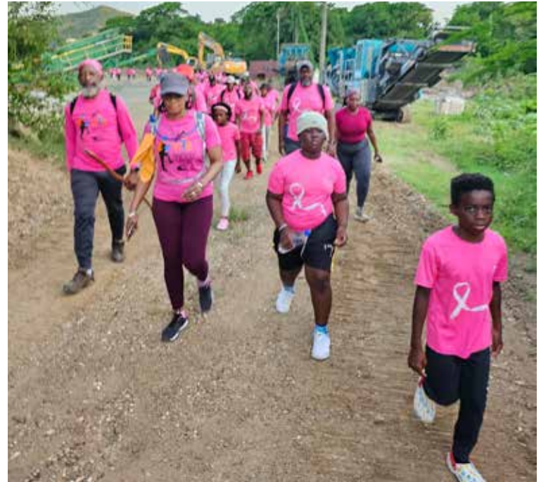
Hikers participating in CIBC Caribbean's Hike for the Cure Saturday 27th April, 2024

The next fundraising event will be Jam for the Cure T-Shirt Mas with