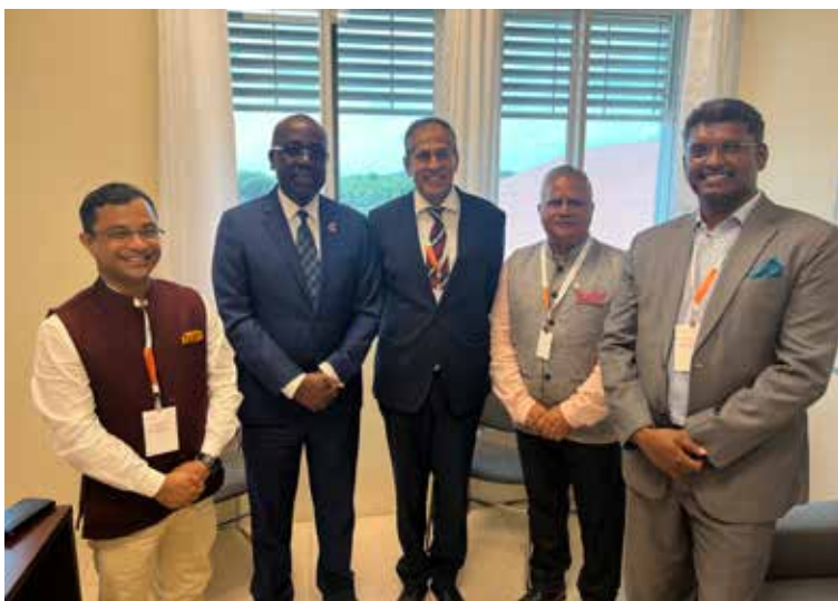
Foreign Affairs Minister E.P Chet Greene with members of the delegation from India.

"Given the current state of the world, with conflicts in Ukraine and in Gaza, there is a need for more of our people to be trained in the area of diplomacy," the minister noted.