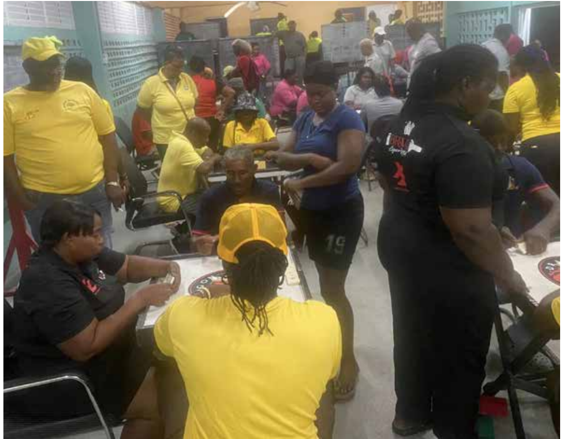
Players compete during the sixth-round of matches in the opening three-hand competition of the 2024 Antigua and Barbuda National Domino Association's domestic season at the ABNDA's headquarters in Ottos.

Fire Police, which occupied second place at the end of the fifth round of matches with an overall total of 361 points, was not involved in the sixth round of matches after gaining a