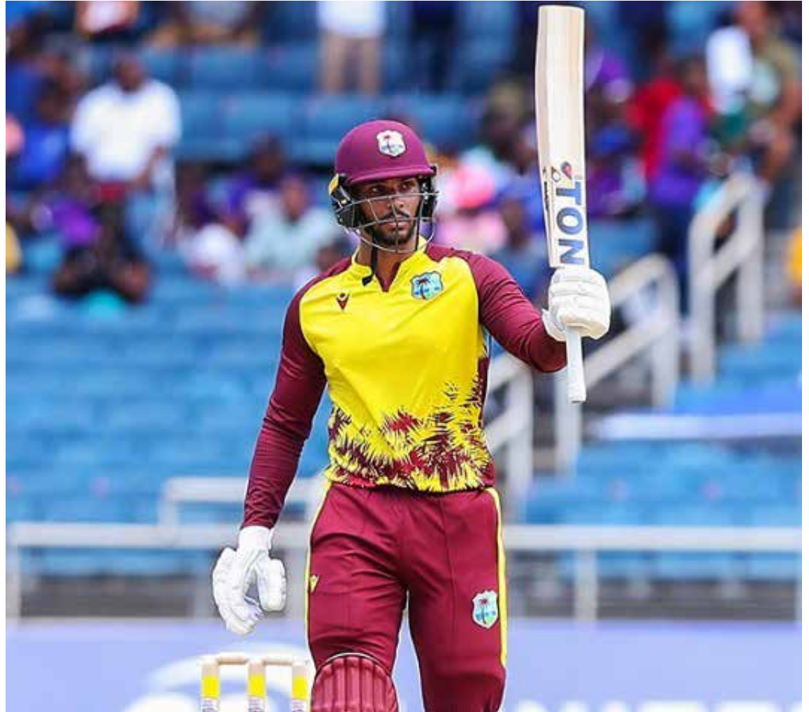
West Indies batsman Brandon King

players from the West Indies on the rise following their recent series sweep over South Africa, with Brandon King (up five spots to eighth), Johnson Charles (up 17 places to 20th) and Kyle Mayers (up 12 rungs to 31st) all making giant inroads on the rankings for T20I batters following some