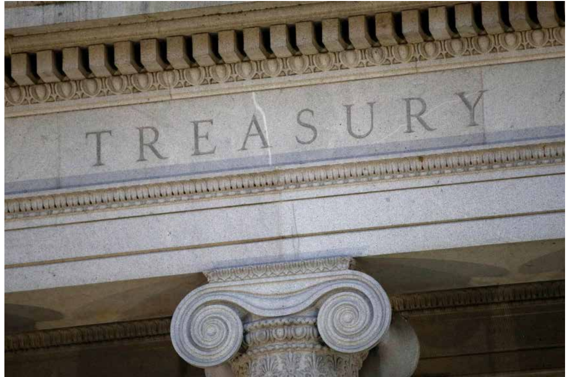
This June 6, 2019, file photo shows the U.S. Treasury Department building at dusk in Washington.

"This reinstated authorisation is intended to help the