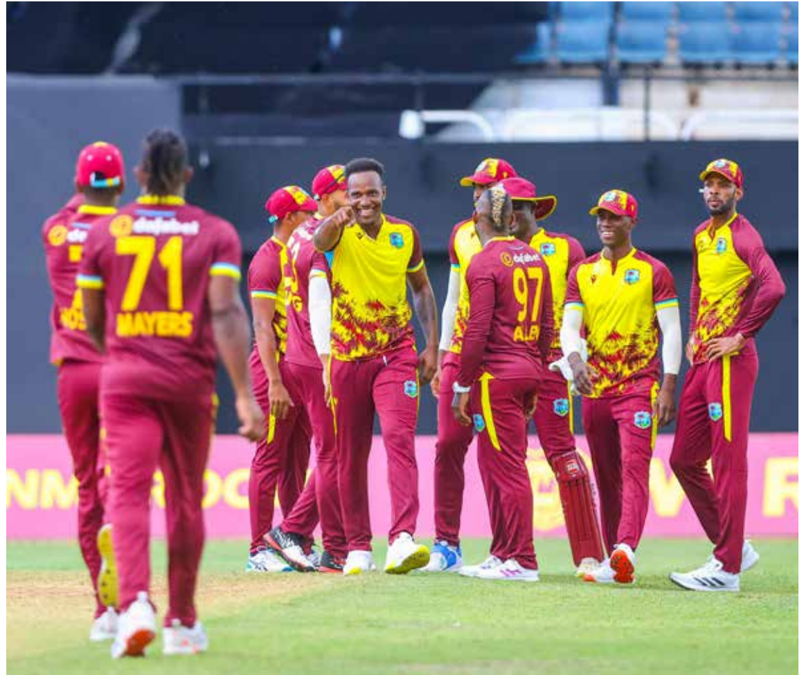
Players of the West Indies T20I team.

There were individual bright spots for West Indies in the series, who gained