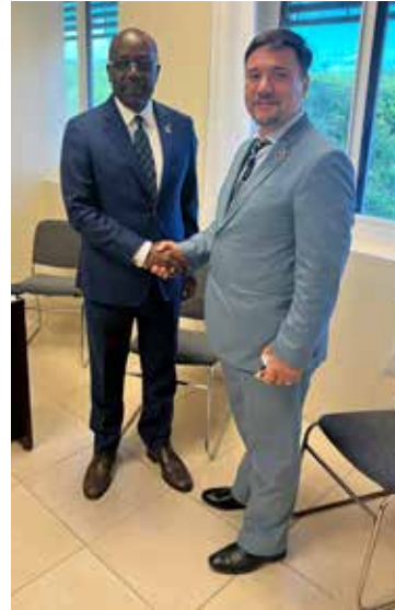
Foreign Affairs Minister E.P Chet Greene with the representative of Romania.

The Singaporean Minister in the Ministry of Foreign Affairs and Education, Dr. Mohammad Maliki Os-