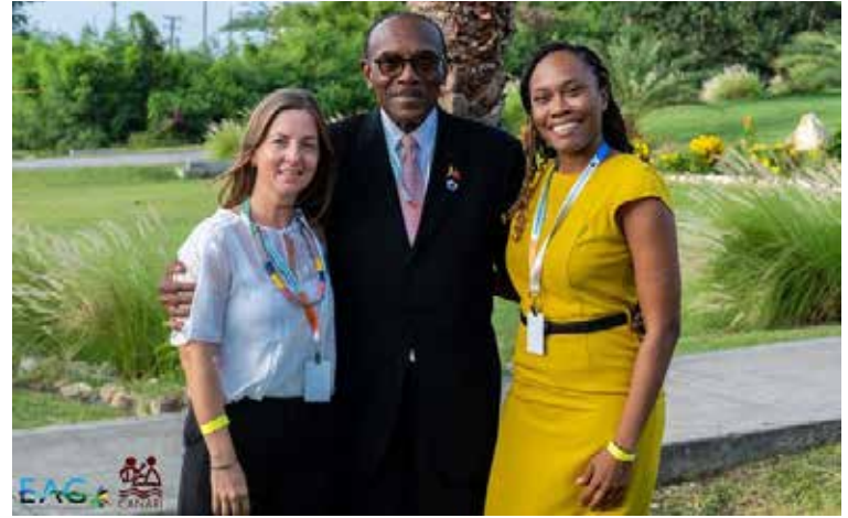
Minister of Environment, Sir Molwyn Joseph with participants at SIDS4 side discussion