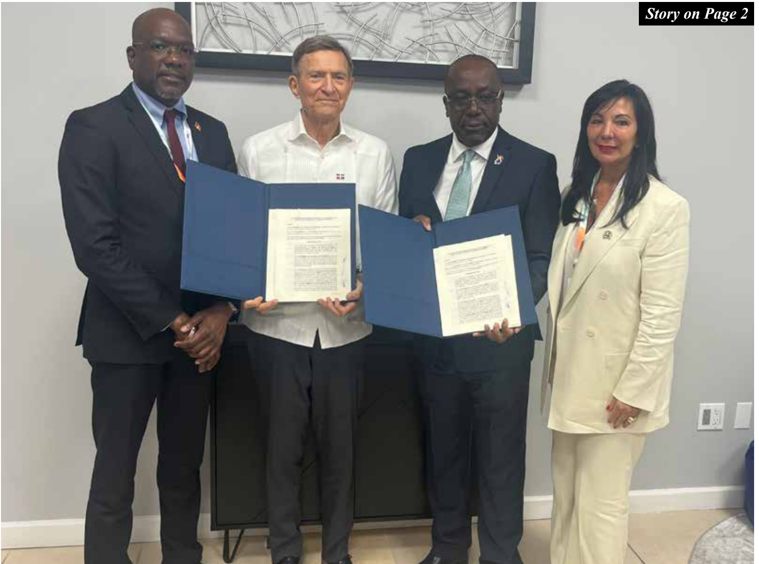
Minister of Education Daryll Matthew, left, and Foreign Affairs Minister E.P. Chet Greene, second right, along with representatives from the Dominican Republic display the signed agreement.