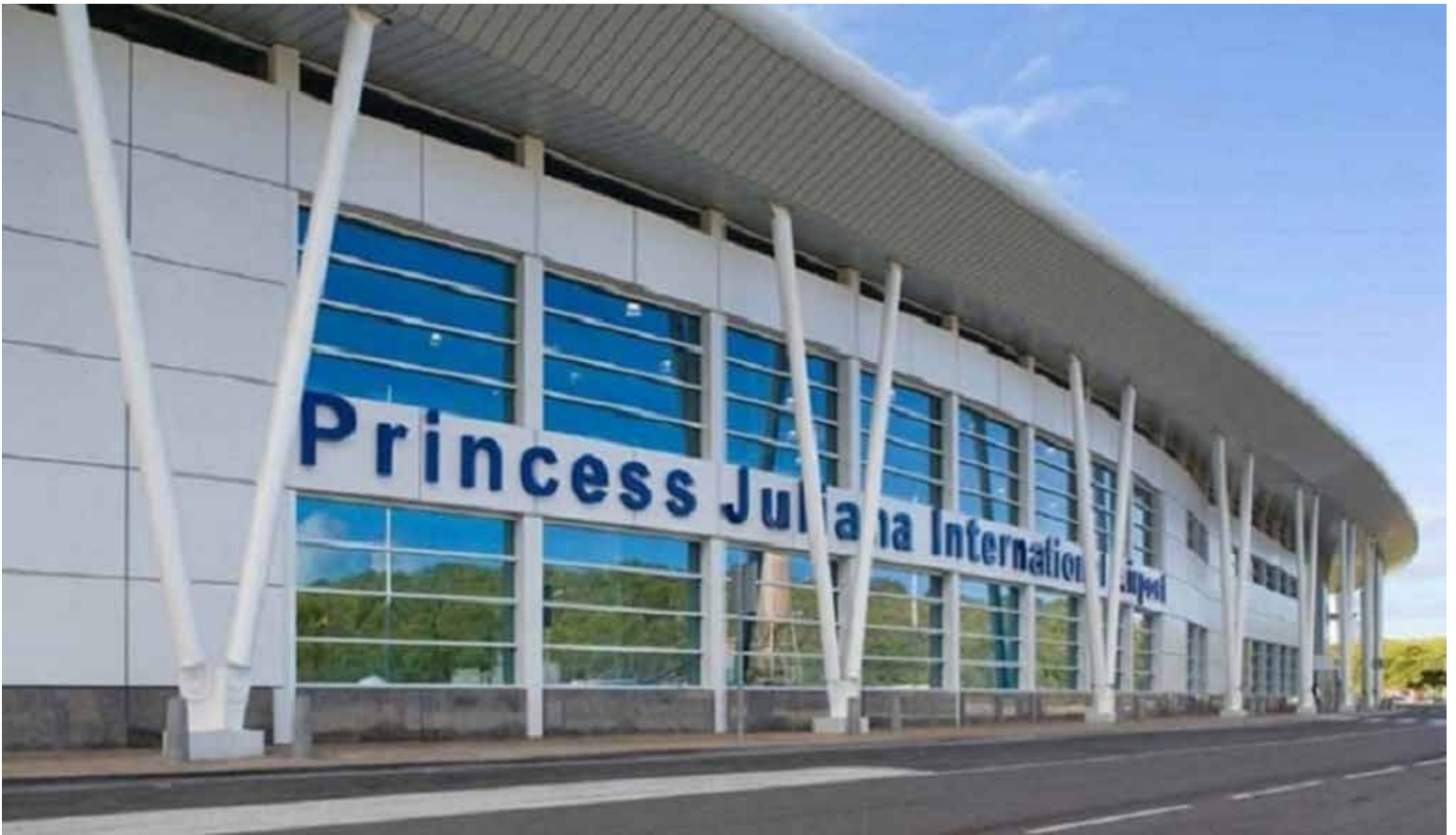
Princess Juliana International Airport.