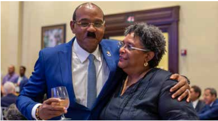
PM Browne embraces his Barbadian counterpart, Mia Amour Mottley