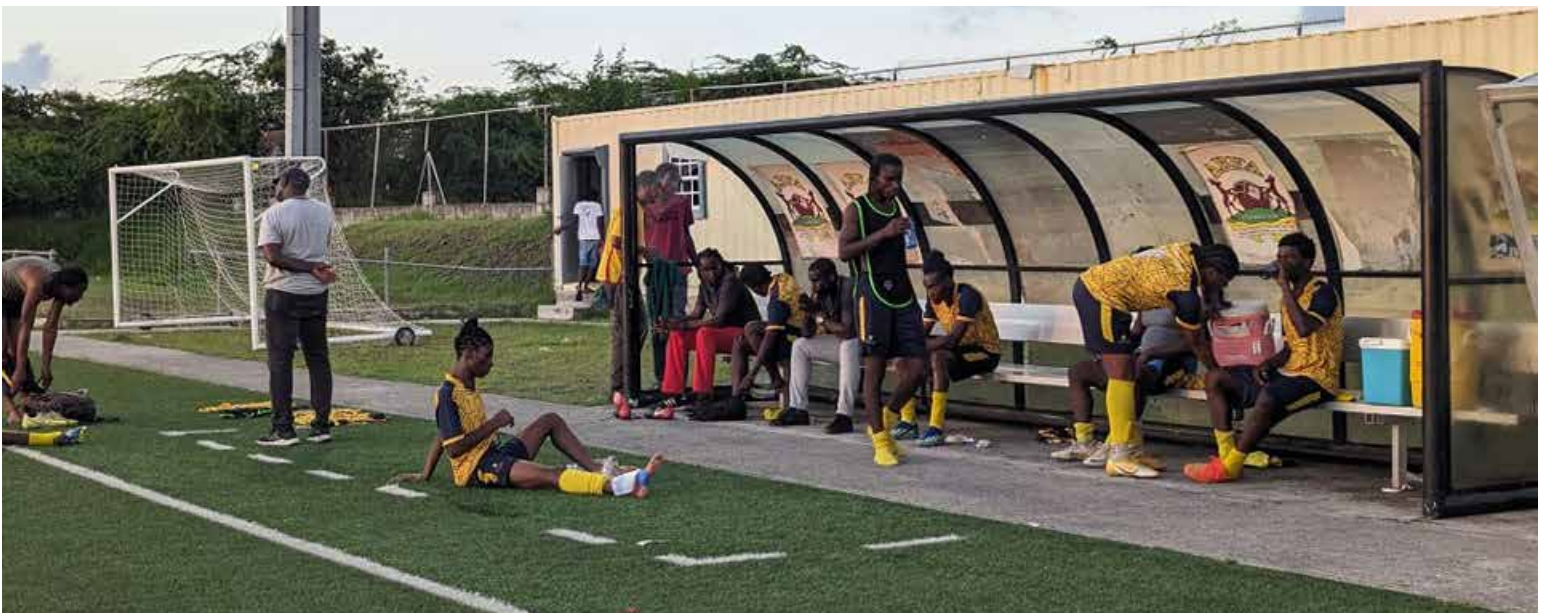
Players of the Five Islands teams after a game in the First Division at the ABFA Technical Center in May 2024.