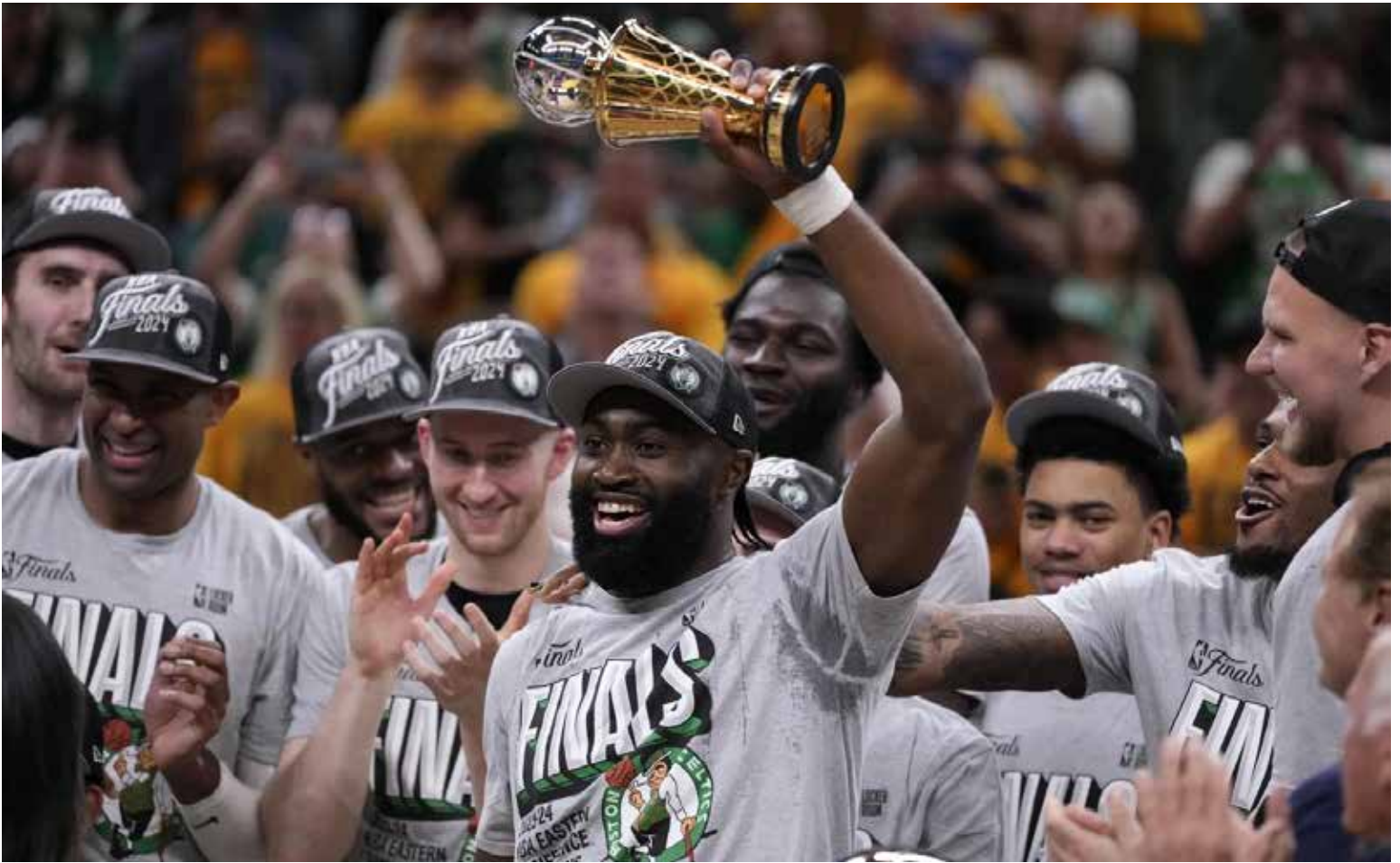
Boston Celtics guard Jaylen Brown, center, celebrates with his teammates after Game 4 of the NBA Eastern Conference basketball finals against the Indiana Pacers in Indianapolis, Monday, May 27, 2024. The Celtics won 105-102.