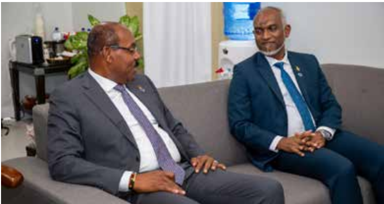
PM Browne with President of the Maldives