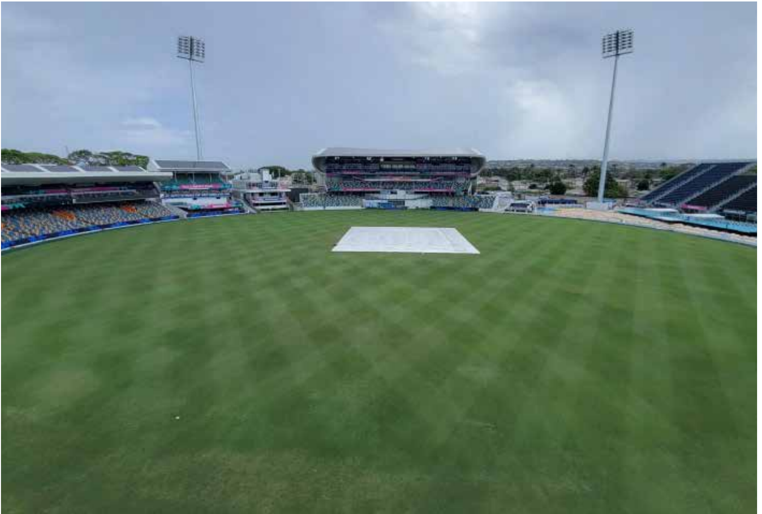
The Kensington Oval in Barbados