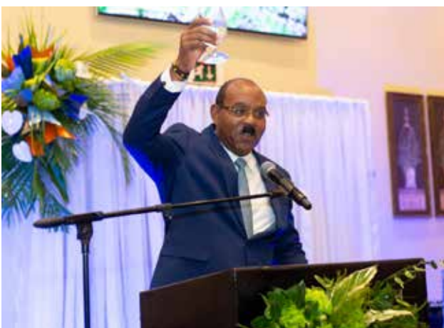
PM Browne raises a toast for a successful SIDS4