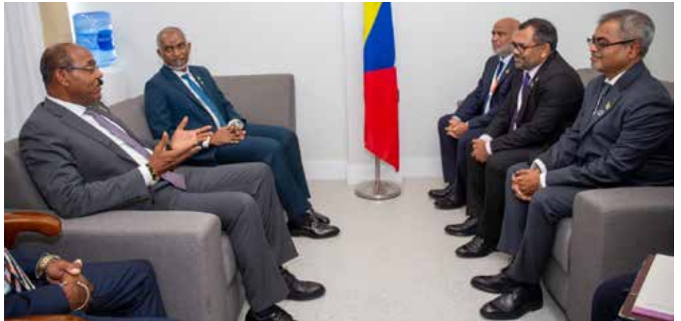
PM Browne with the president of the Maldives and his team