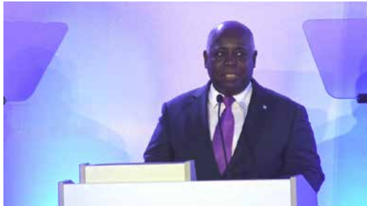
Bahamas Prime Minister Phillip Davis addressing Fourth International Conference on Small island States in Antigua and Barbuda.

He said while this problem is not unique to The Bahamas, in the past five years, every island in the Caribbean has experienced