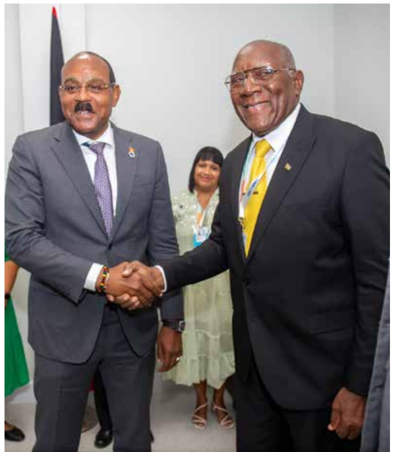
PM Browne with a Cuban Government representative.