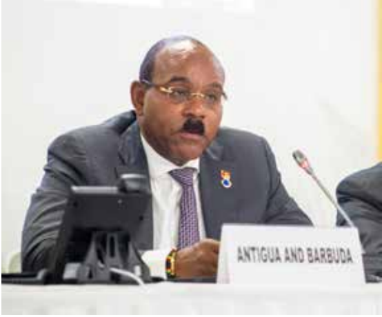
PM at one of several meetings held Tuesday