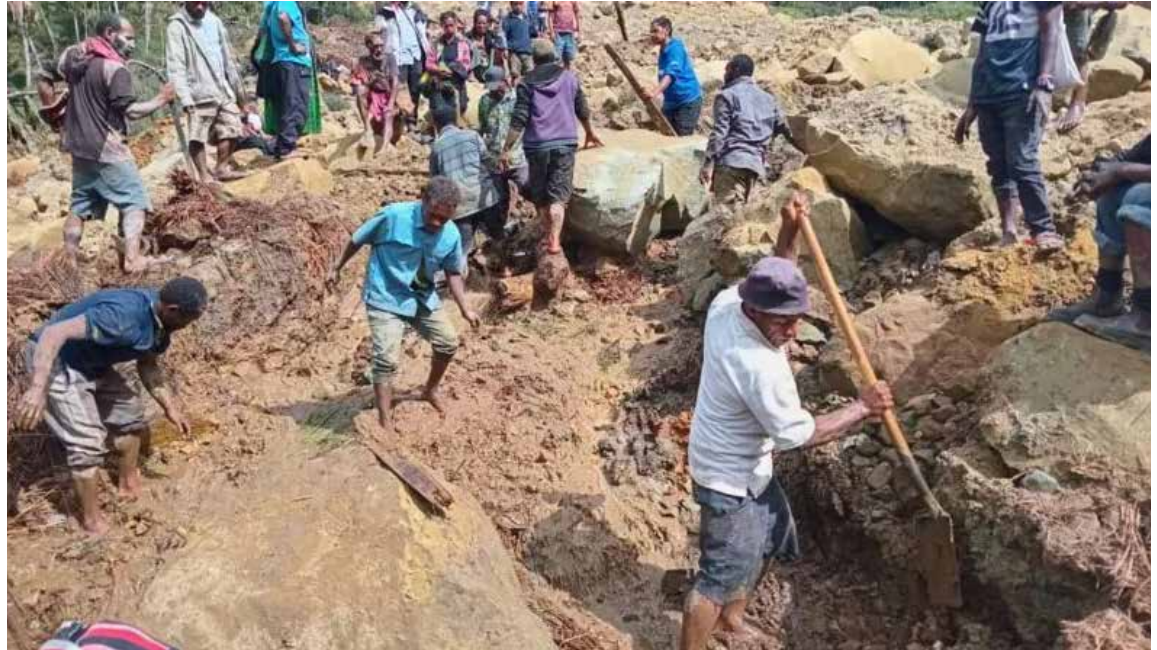
Villagers have been using shovels, sticks and their bare hands to try and remove huge rocks and rubble.

“It is not a rescue mission, it is a recovery mis-