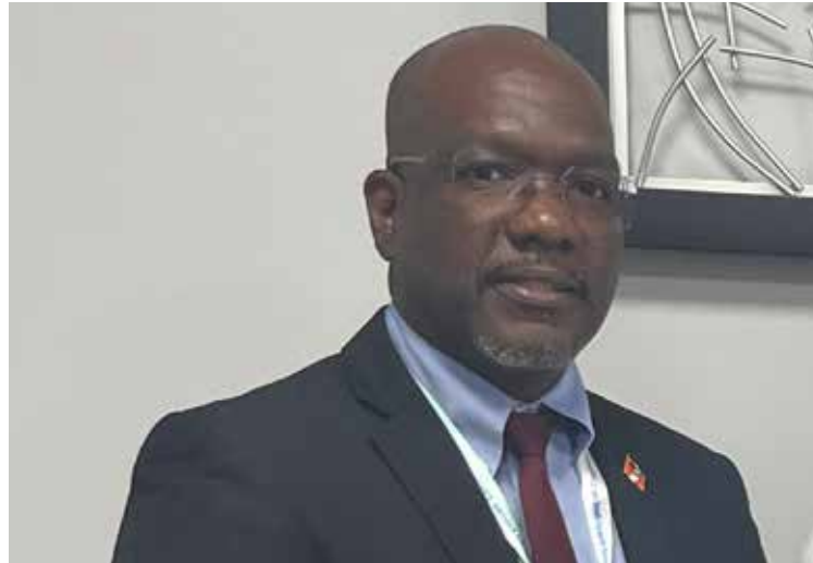
Minister for Creative Industries, Daryll Matthew

"This era of rapid technological advancement offers unprecedented opportunities for cultural tourism, cultural valorization, and cultural institutions, especially in Caribbean Small Island Developing States (SIDS). By integrating technology-driven artistic expression, our small island nations can enhance the cultural landscape, preserve heritage, and stimulate economic growth, while navi-