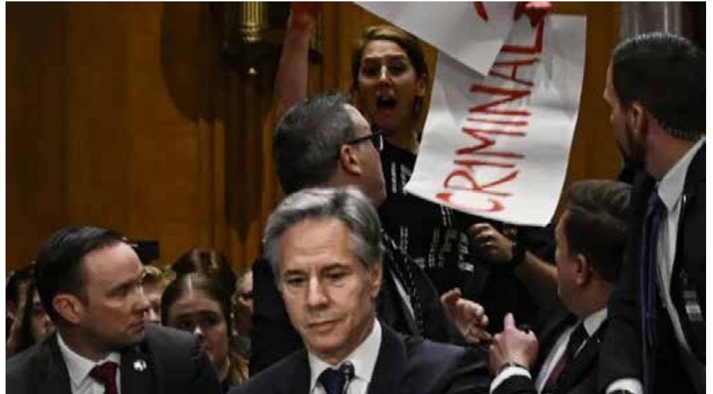
Protesters disrupted Antony Blinken’s testimony to the US Senate on Tuesday.

Mr Khan is also seeking arrest warrants for three Hamas officials - Yahya Sinwar, its leader in Gaza, Mo-