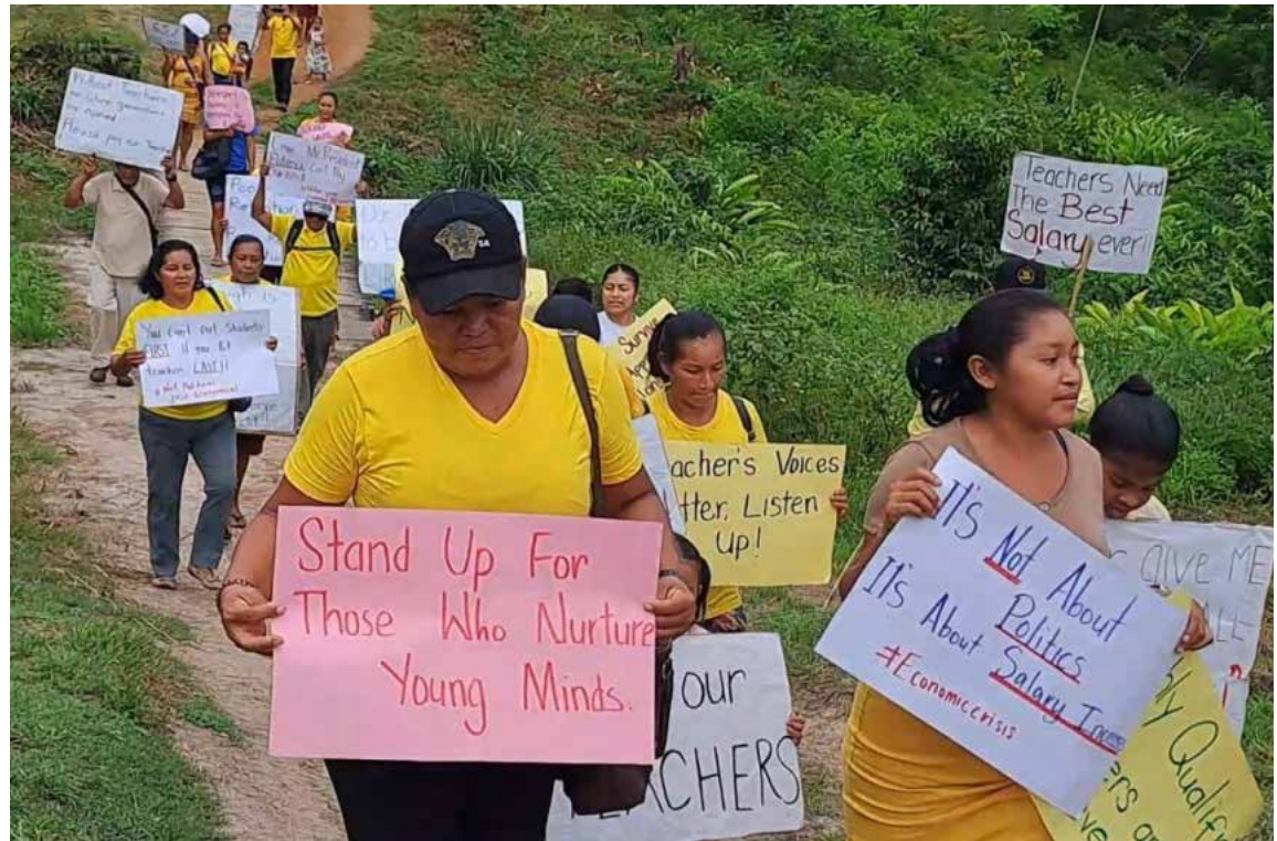
Guyanese teachers holding placards at a recent protest.