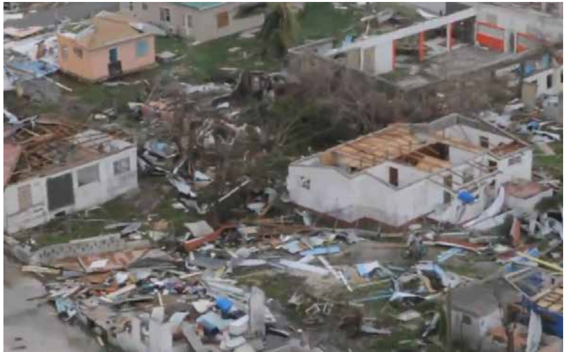
Barbuda after it was devastated by Hurricane Irma in 2017

Antigua and Barbuda’s Ambassador to the United States and the OAS, Sir Ron Sanders is giving the credit entirely to PM Browne and the former Tuvalu PM Kausea Natano,