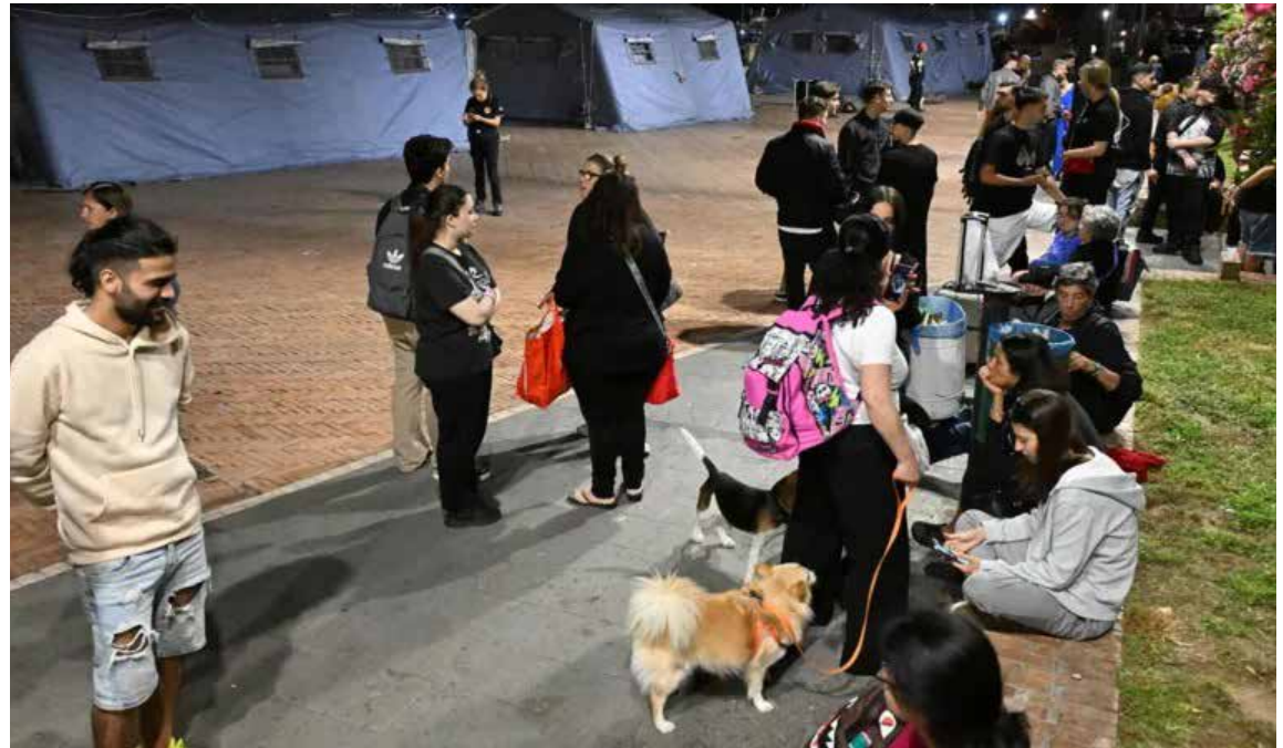
Pozzuoli residents, some with pets, waited out the tremors at camps set up by the Italian government's Civil Protection department.

damage to structures has been reported, some schools in Naples remained shut on Tuesday for inspections - and a women's prison in Pozzuoli was evacuated as a precaution.