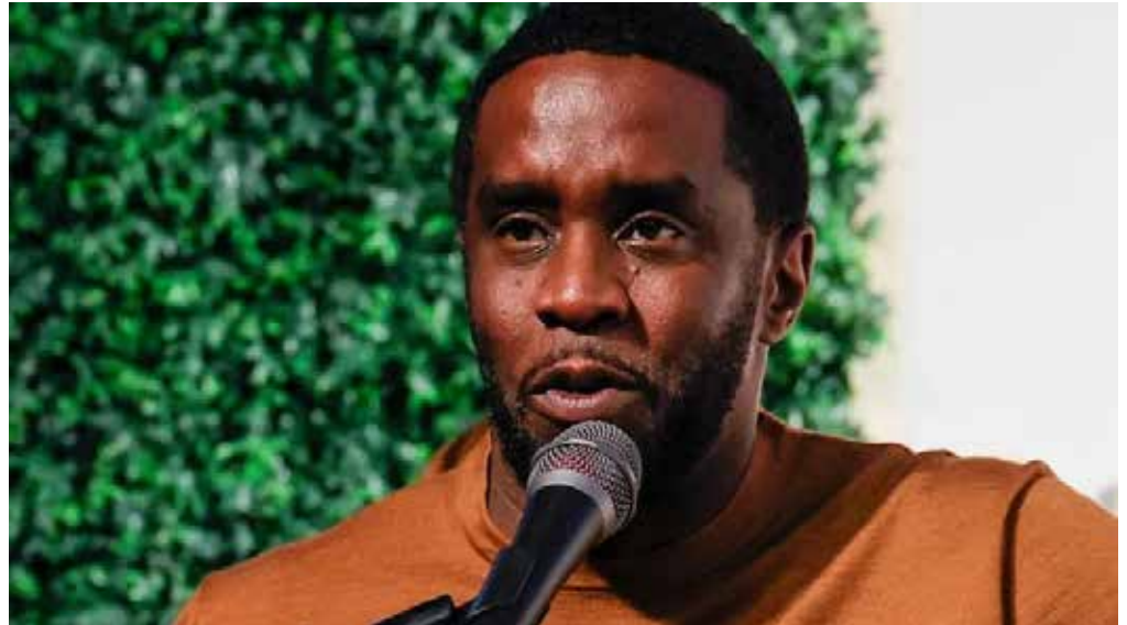
Sean “Diddy” Combs

brutal. After kicking Ms Ventura like a football, Mr Combs, wearing just a towel, is seen dragging her across the floor.