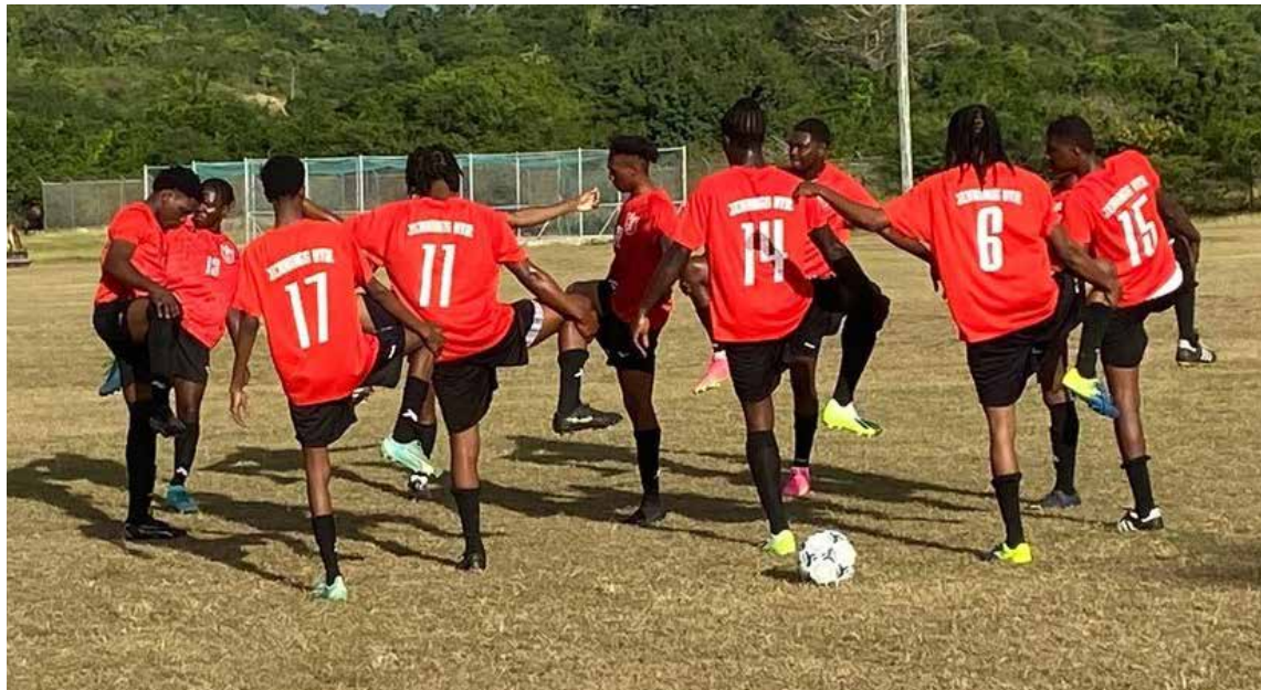
Players of the Jennings United football team