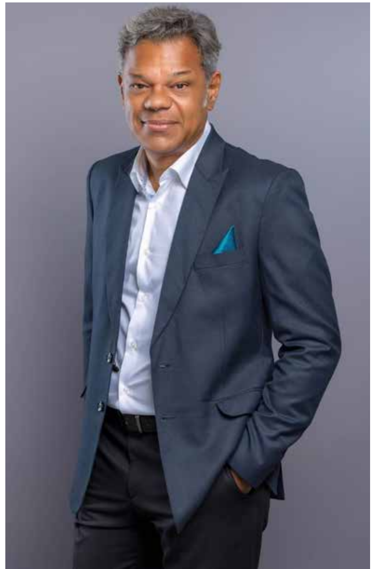
Sint Maarten PM Dr Luc Mercelina.

Prime Minister Mercelina says he yesterday