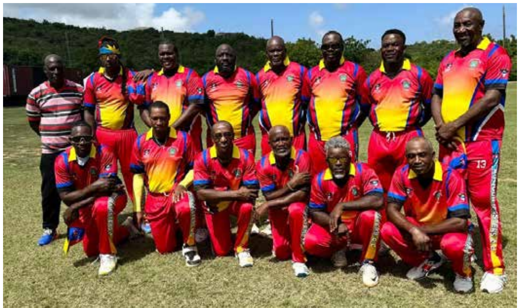
The Antigua Masters cricket team