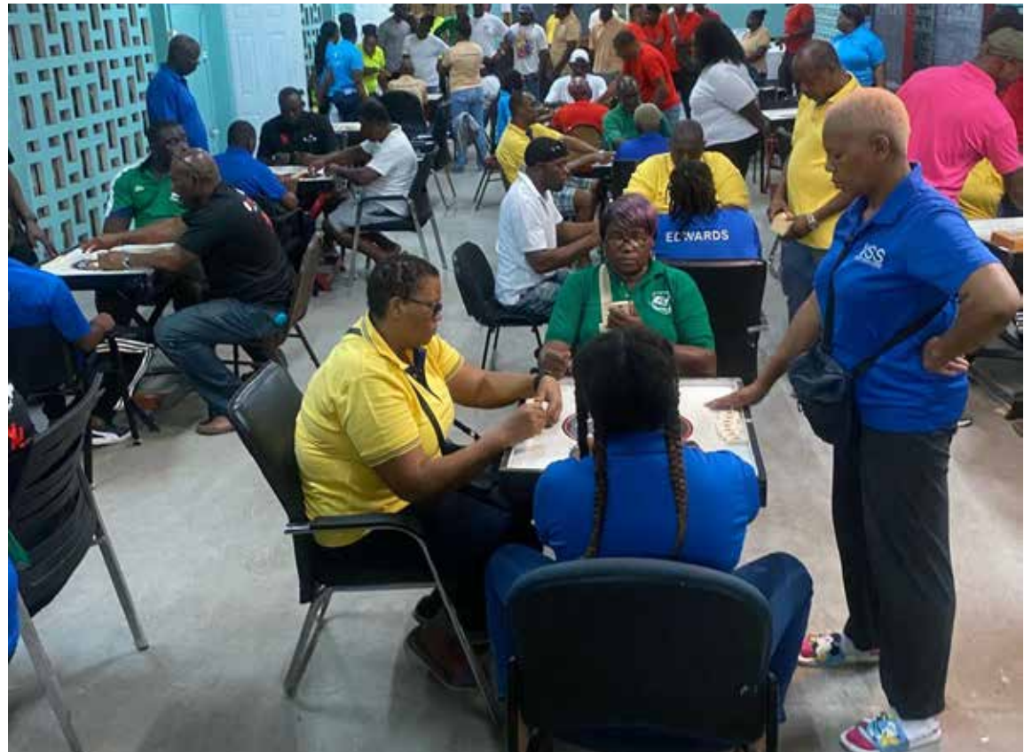
Players compete during the opening round of matches in the ABNDA's three-hand domino competition at its headquarters in Ottos. (file photo)

Double Six Ice jumped to third place with a total of 158 points after securing victory in their second round encounter with 81 points to prevail against Highly Favoured with 76 points and SK Eagles with