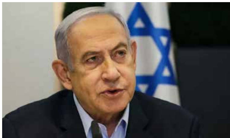
Benjamin Netanyahu has long warned that Israel will invade Rafah.

More than half of Gaza's 2.5m population is in Rafah, having fled there to escape fighting in other parts of the territory. Conditions in the overcrowded city are dire, and displaced people there have spoken of a lack of food, water and medication.