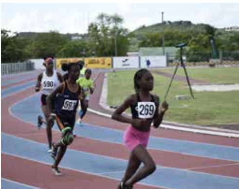
Athletes compete during the 11th Sir Reginald Samuel Track & Field Classic at the YASCO Sports Complex in St. John's on April 28.

presentations to the outstanding athletes. Sir Reginald is the designer of the national flag of Antigua and Bar-