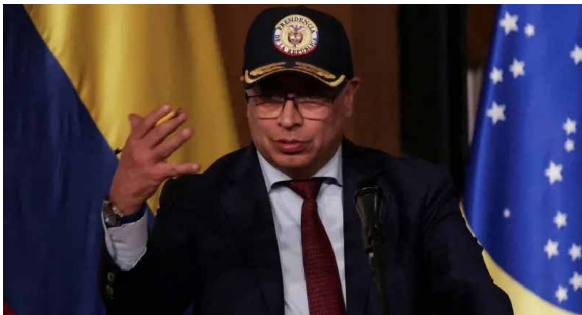
Colombia's president Gustavo Petro blamed military corruption for huge losses of arms and ammunition at two bases.

He said the missing items came to light during surprise visits to two military bases - Tolomaida and