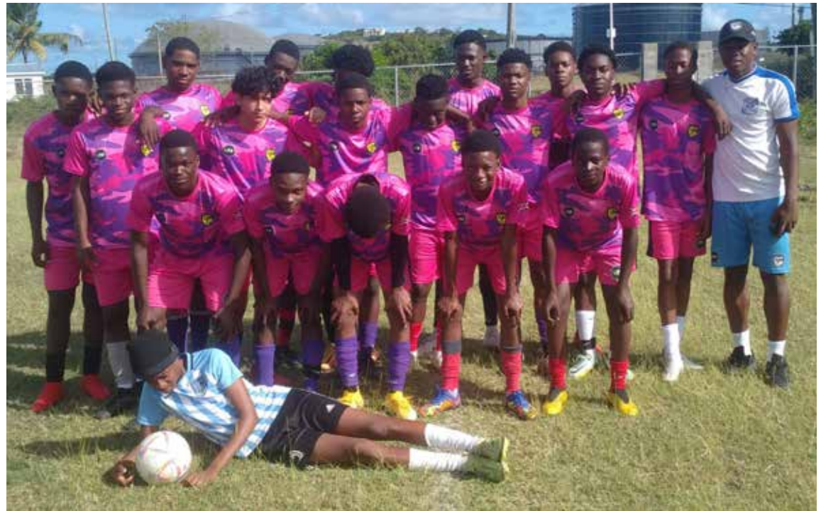
New Evolution is the reigning Under-17 Boys Division champions of the Gomez/Netherlands Insurance Youth Football League. (File photo)