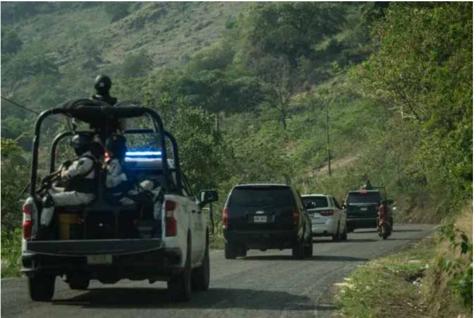
The levels of violence are such that candidates for political office travel with a security convoy.