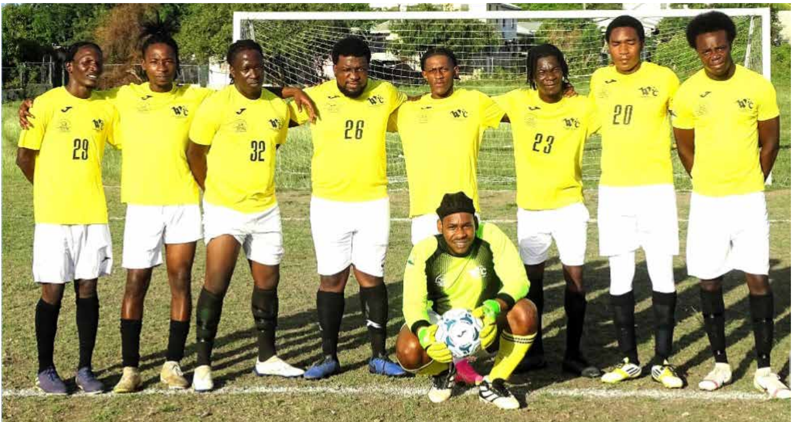
Players of the Lingies CPTSA Wings football team