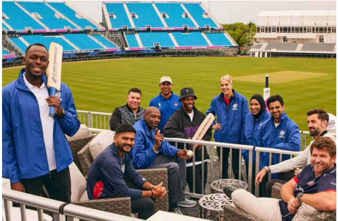
Usain Bolt, left, and several other people at the Nassau County International Cricket Stadium in New York, USA, on May 15.

The event marks the official final countdown to the first ICC Men's T20 World Cup 2024 in New York, with Sri Lanka and