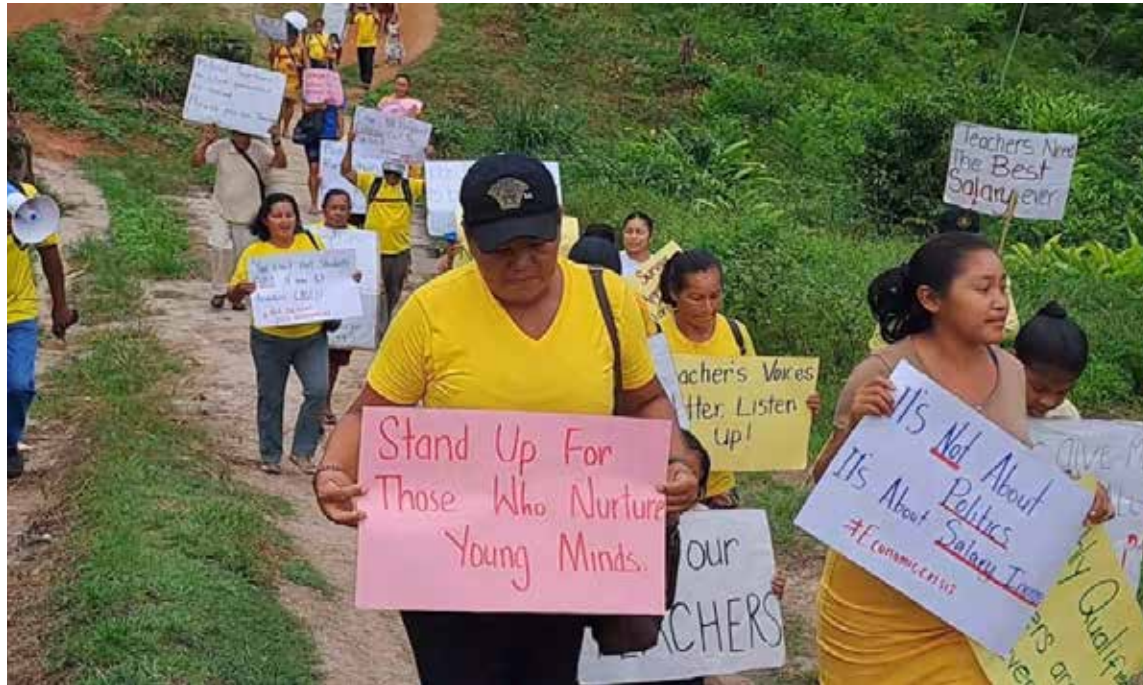
Guyanese teachers holding placards at a recent protest.

"The GTU remains committed to advocating for the rights and welfare of all teachers, and we will continue to explore all