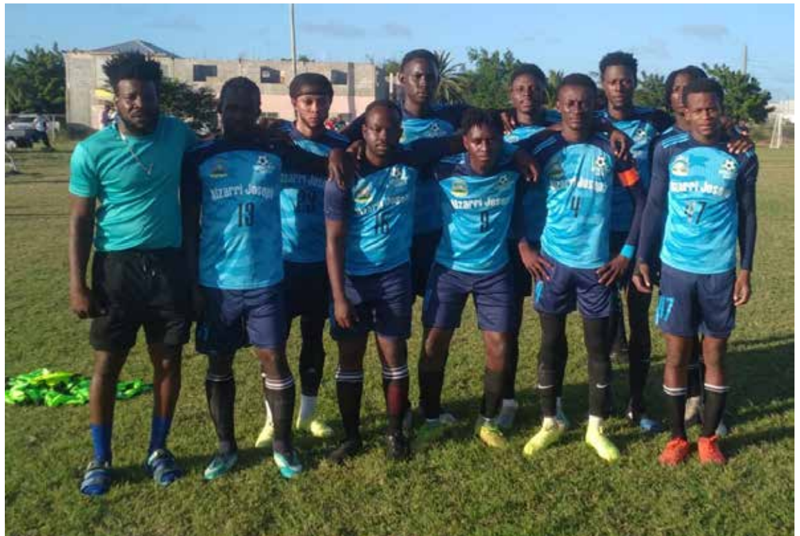
Players of the Attacking Saints football team