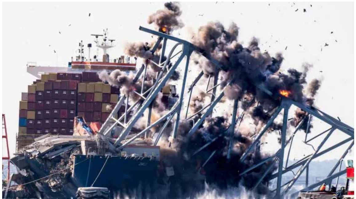
The crew of the Dali remained on-board even as explosives were used to destroy part of the Key Bridge on its hull.

“Once we broke the ice and got everyone to say their name and what part of India they were from, and talk about if they were married or had children, we got the ball rolling,” he said. “They were willing to kind of poke fun at one another a little bit... we did our best to get them laughing and