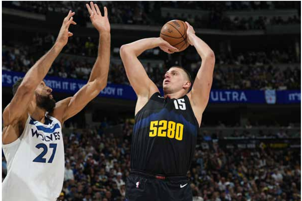
Denver Nuggets center Nikola Jokic, right, shoots over Minnesota Timberwolves center Rudy Gobert during the first half of Game 5 of their NBA basketball second-round playoff series in Denver, Tuesday, May 14, 2024.

had his opponents smiling. 16 points and assist on four er rout.