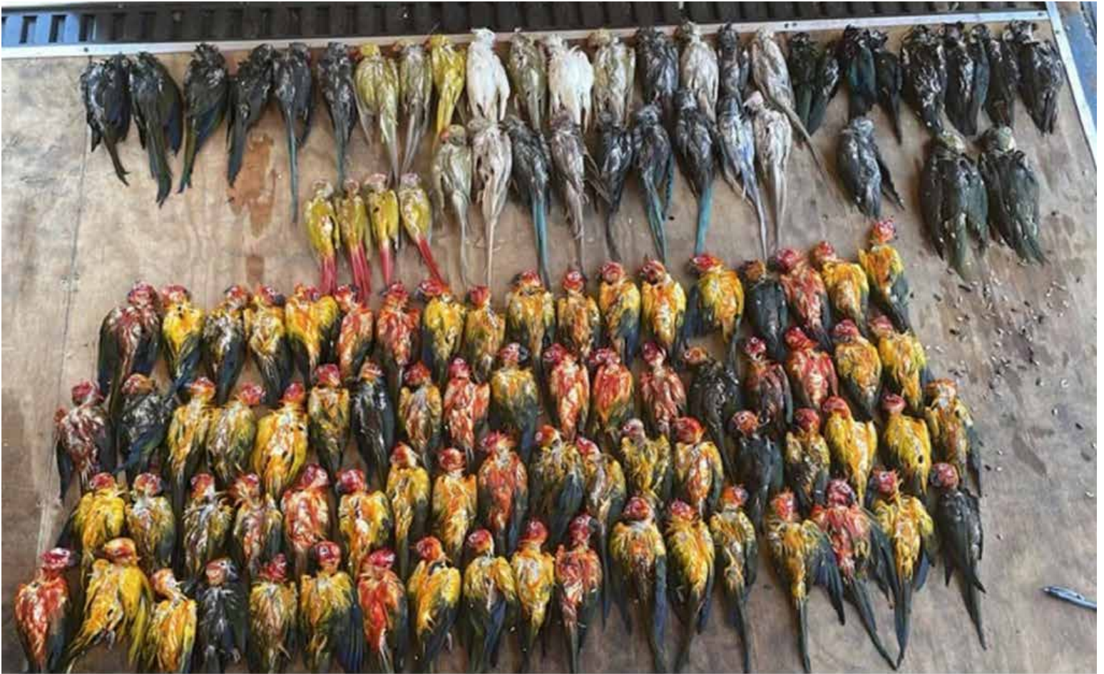
Deceased birds recovered from the ocean.