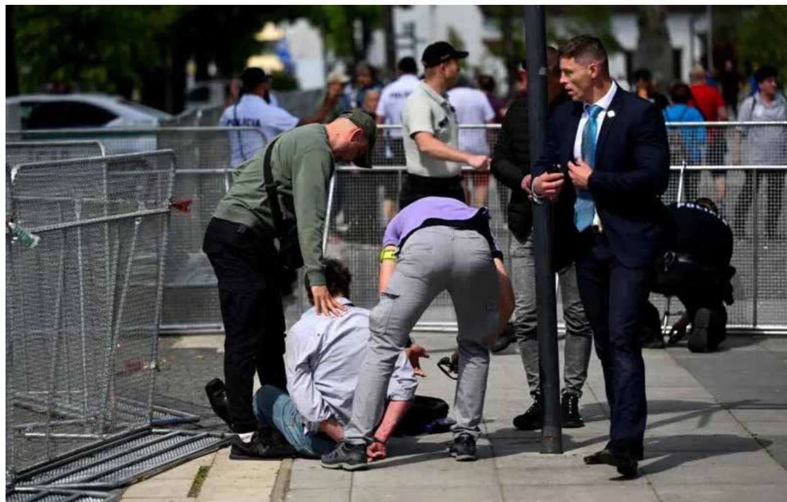
A man was immediately detained by guards and bystanders in Handlova.

He was airlifted by helicopter to a nearby hospital before being flown to another