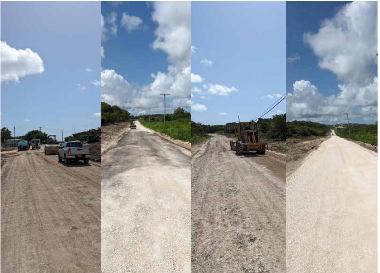
The Ministry of Works finalizing work on the detour route that will run through Royals Estate during the SIDS Conference.